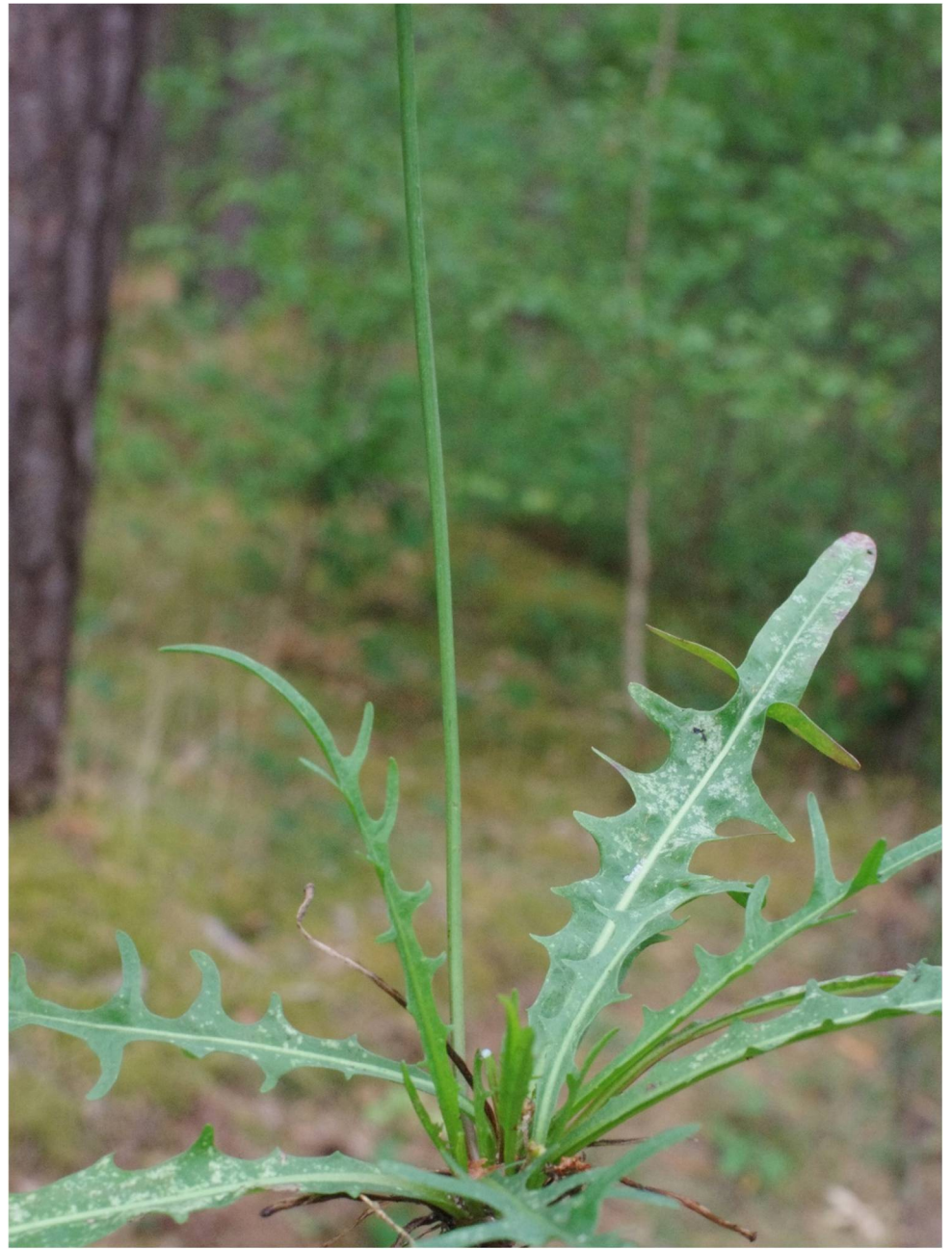
Leontodon autumnnalis L.

3134/311-1, S Mechau, 52°50'53"N, 11°20'40"E, 15.07.2022