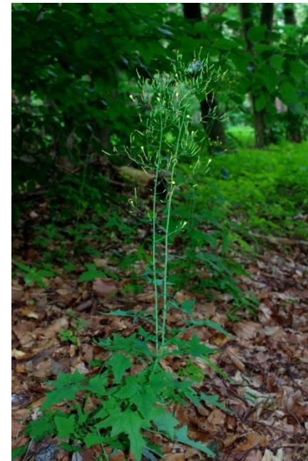
Lactuca (Mycelis) muralis

Haideburg, Speckinge, TK 4239/1/2/2, 51°47'53"N, 12°13'56"E, 10.7.13