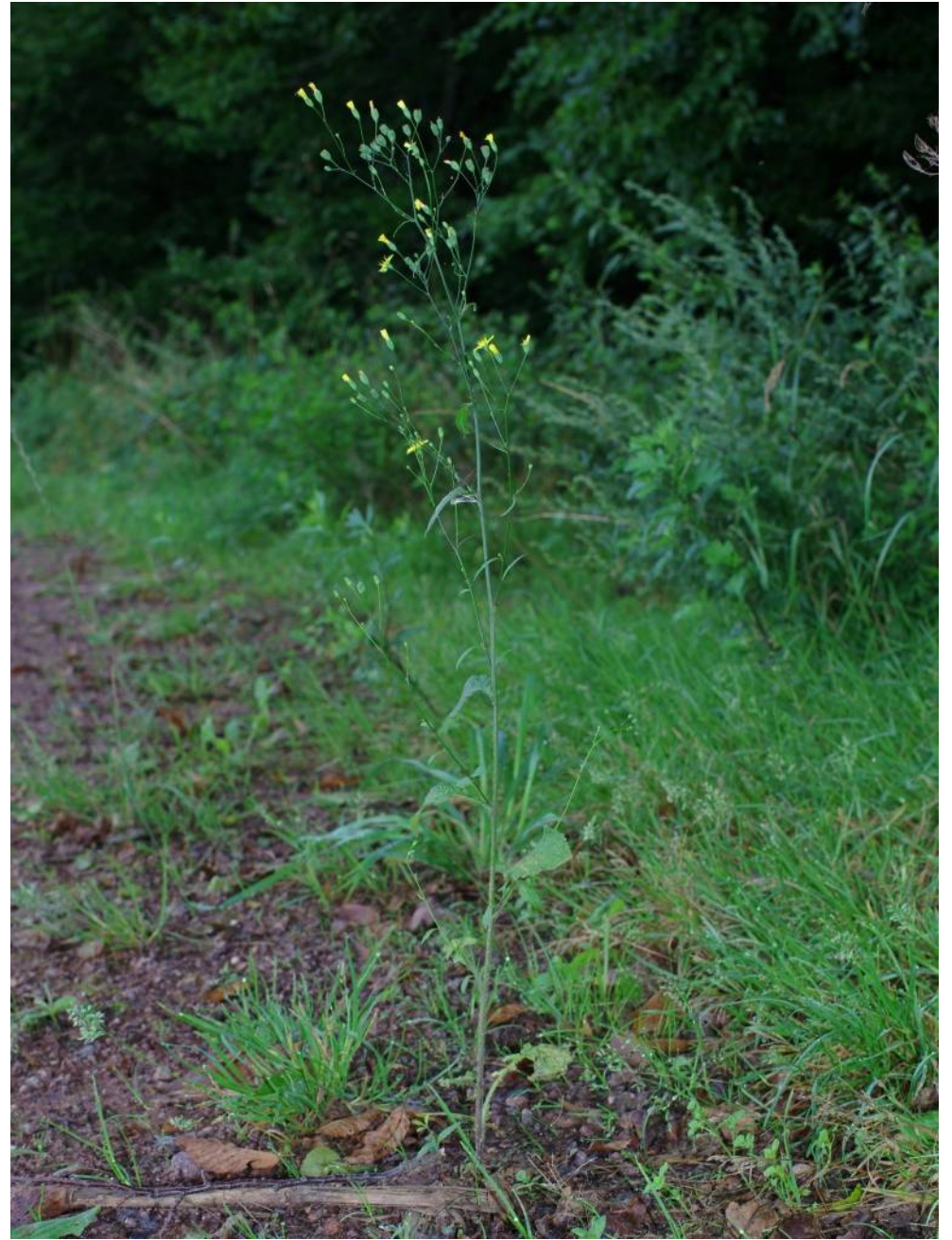
Lapsana communis subsp. communis

N Schierau, TK 4239/4/2/1, 51°44'58"N, 12°17'37"E, 10.8.13