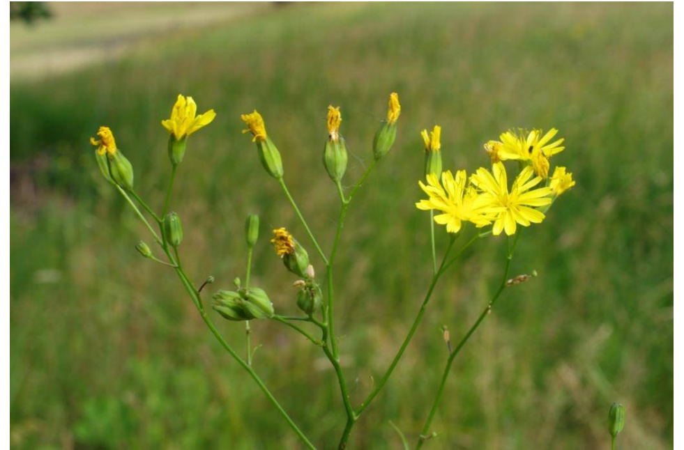
Lapsana communis subsp. communis

O Roßlau, 4139/2/1/3, 51°52'59"N, 12°15'22"E, 15.06.2015