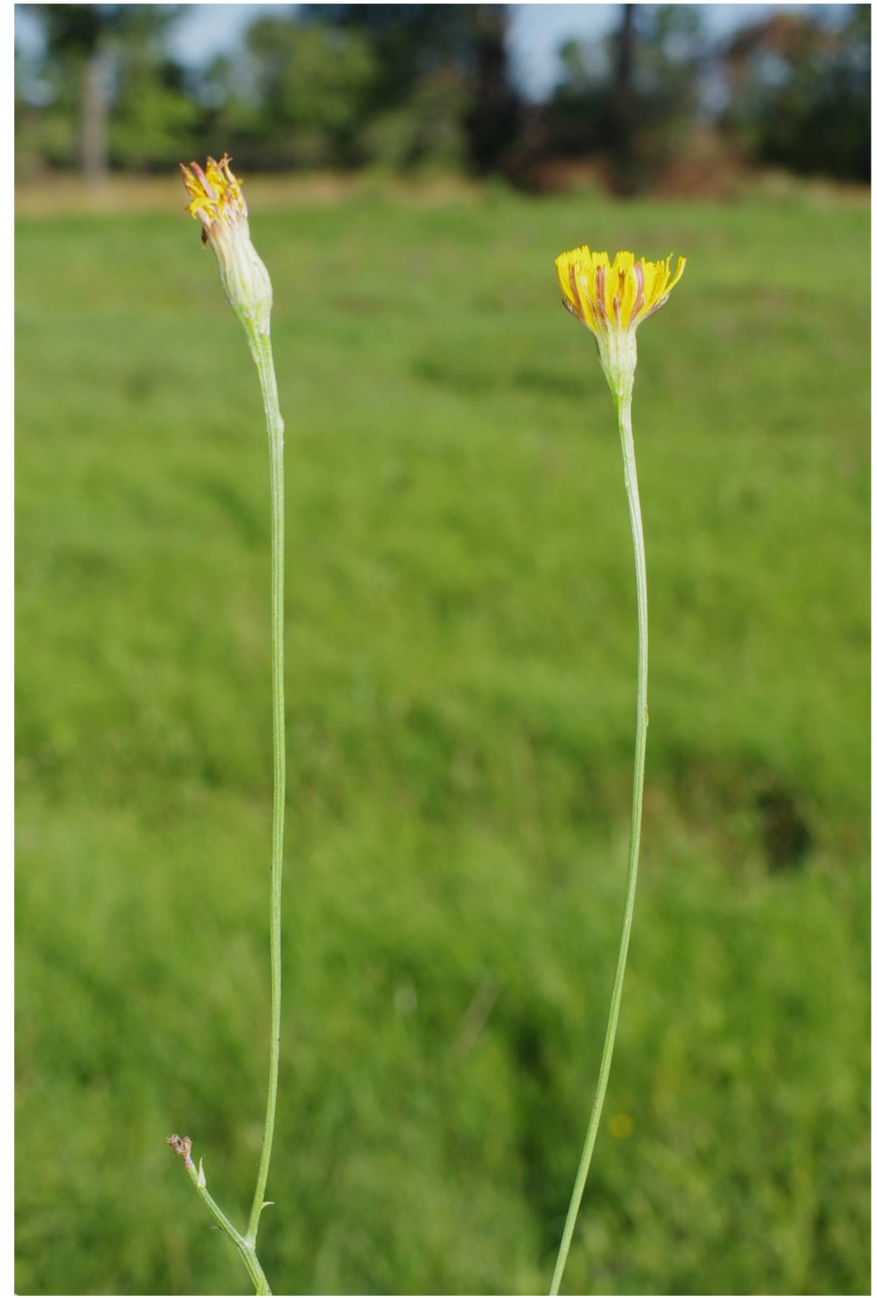
Leontodon autumnalis L.

4133/111-1, Wegeleben, 51°53'12"N/11°10'39"E, 01.09.2022