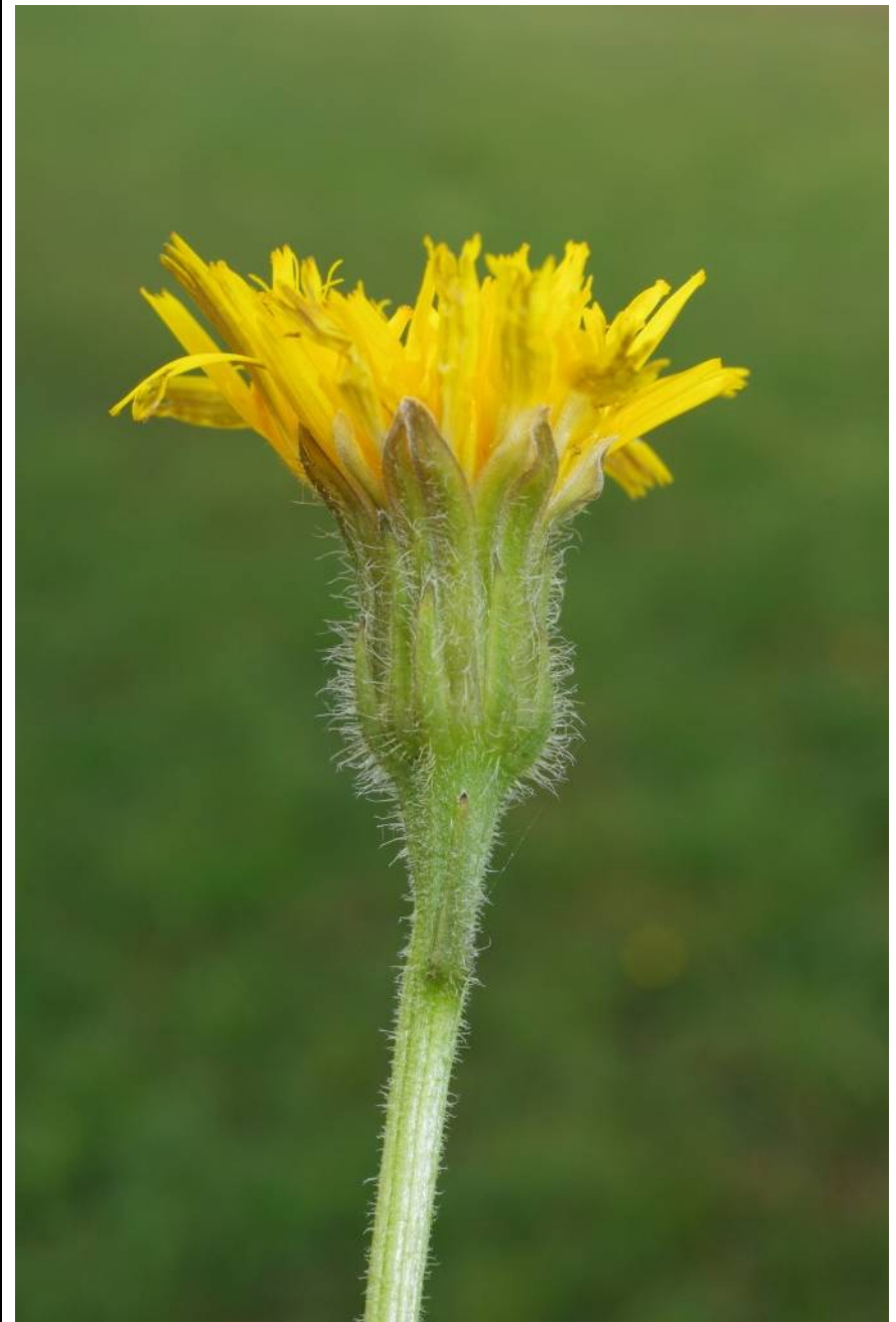
Leontodon hispidus subsp. hispidus

Kleutsch, TK 4239/2/2/1, 51°47'38"N, 12°18'04"E, 13.07.2015