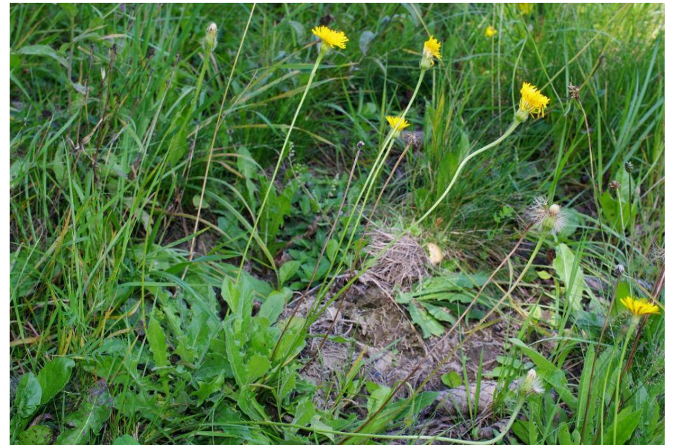
Leontodon hispidus subsp. hispidus

O Trautenstein, TK 4431, 51°41'07"N, 10°47'25"E, 14.08.2014