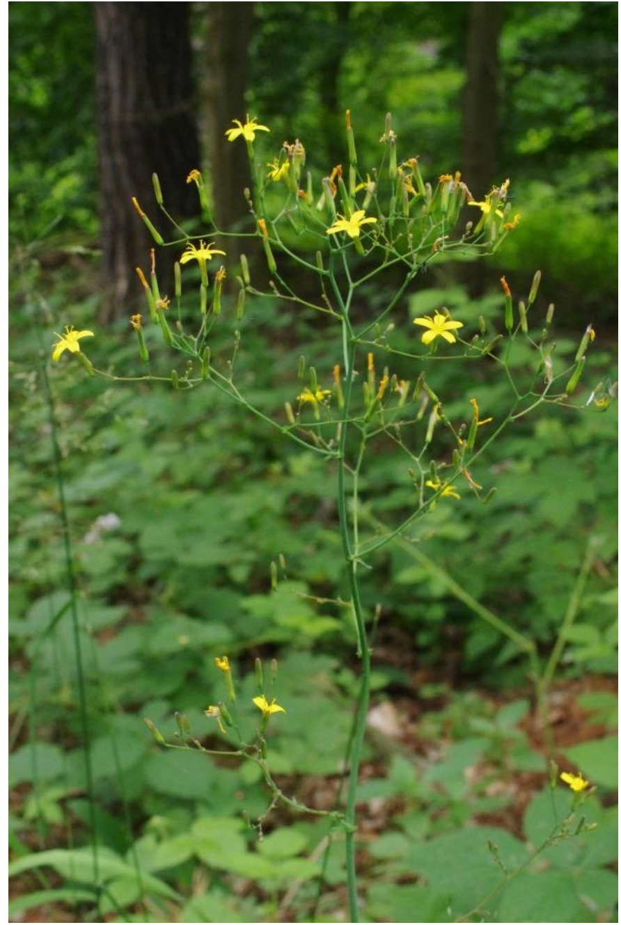
Lactuca (Mycelis) muralis

Haideburg, Speckinge, TK 4239/1/2/2, 51°47'53"N, 12°13'56"E, 10.7.13