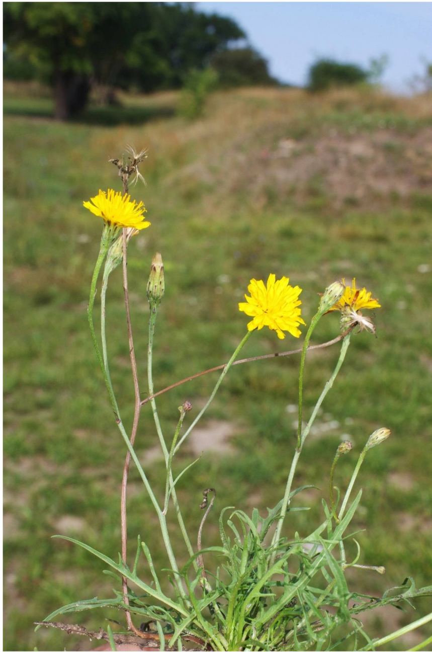
Leontodon autumnalis L.

4137/242-3, NO Kühren, 51°52'07"N, 11°59'13"E, 21.08.2022