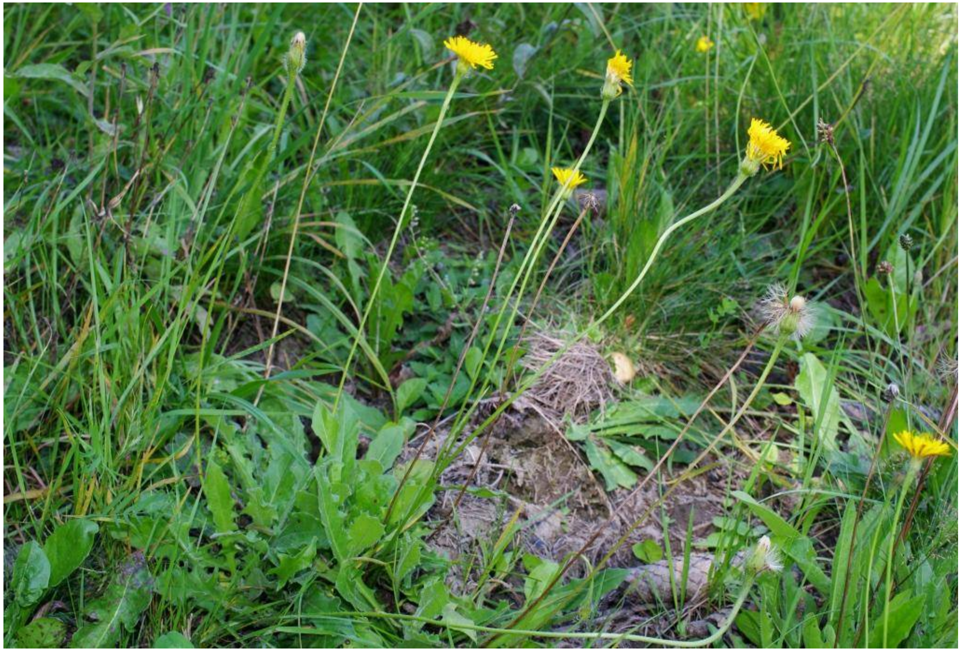
Leontodon autumnalis L.

O Trautenstein, TK 4431, 51°41'07"N, 10°47'25"E, 14.08.2014