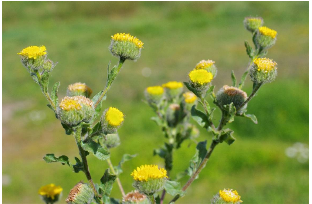
Vockerode, 4140/134, 51°51'07"N/12°21'14"E, 19.09.2020