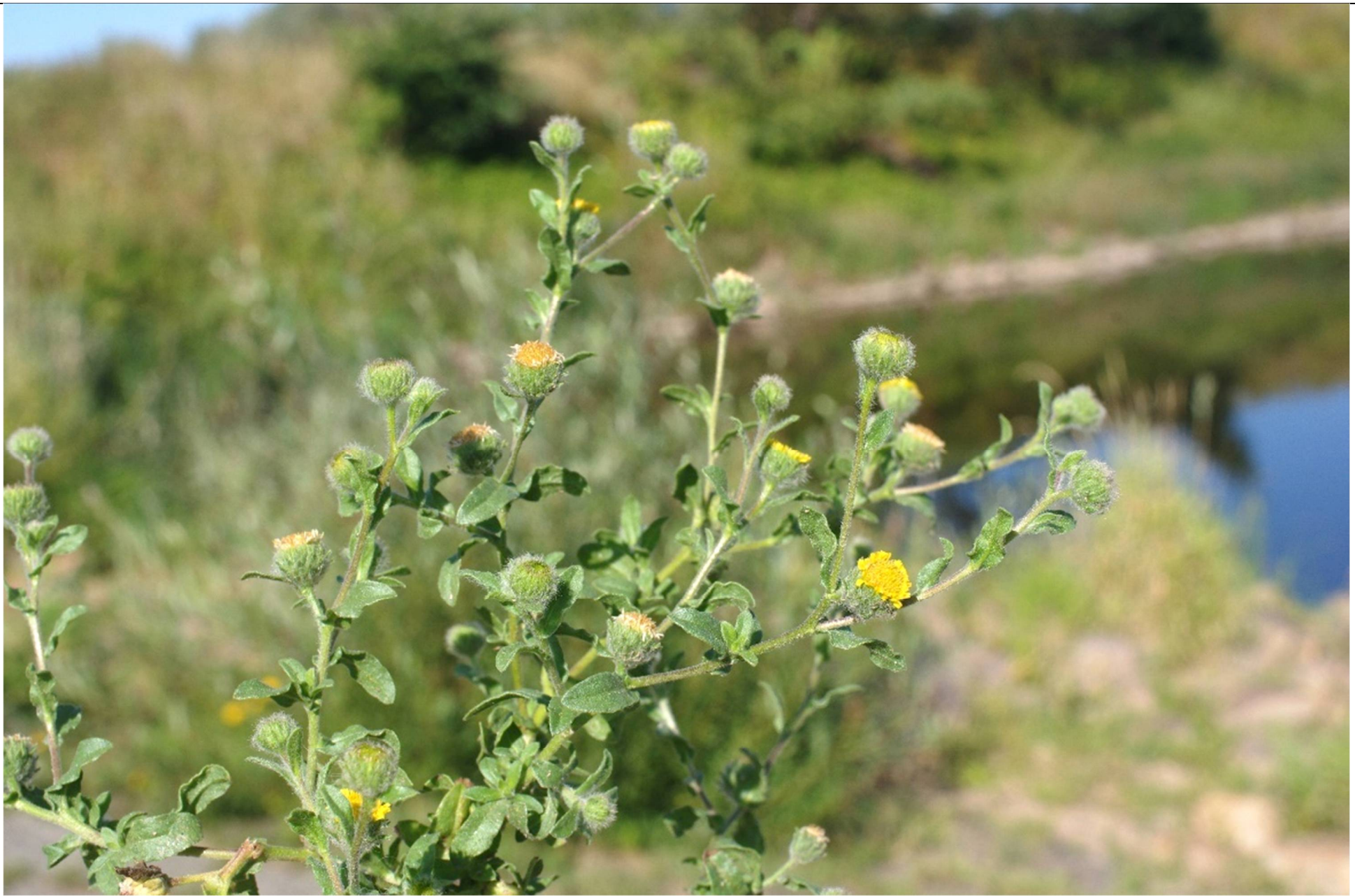
Pulicaria vulgaris Gaertn.

4139/223-4, O Roßlau, 51°53'07"N, 12°18'16"E, 23.08.2022