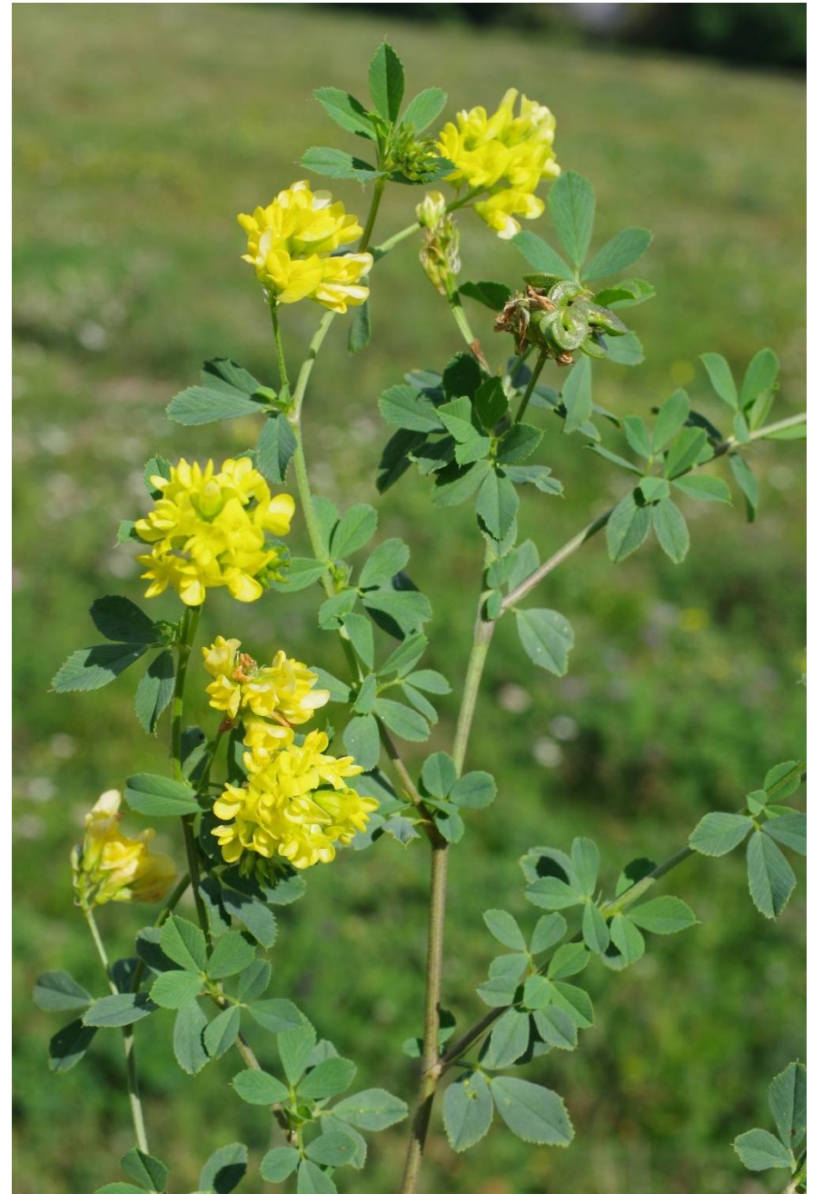
Medicago x varia

4139/324-4, Dessau, Askanische Straße, 51°49'40''N/12°13'53''E, 09.09.2022