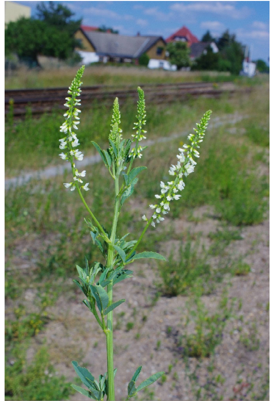
Melilotus albus Medik.

4238/121-3, Elsnigk, 51°47'25"N, 12°03'26"E, 16.06.2022