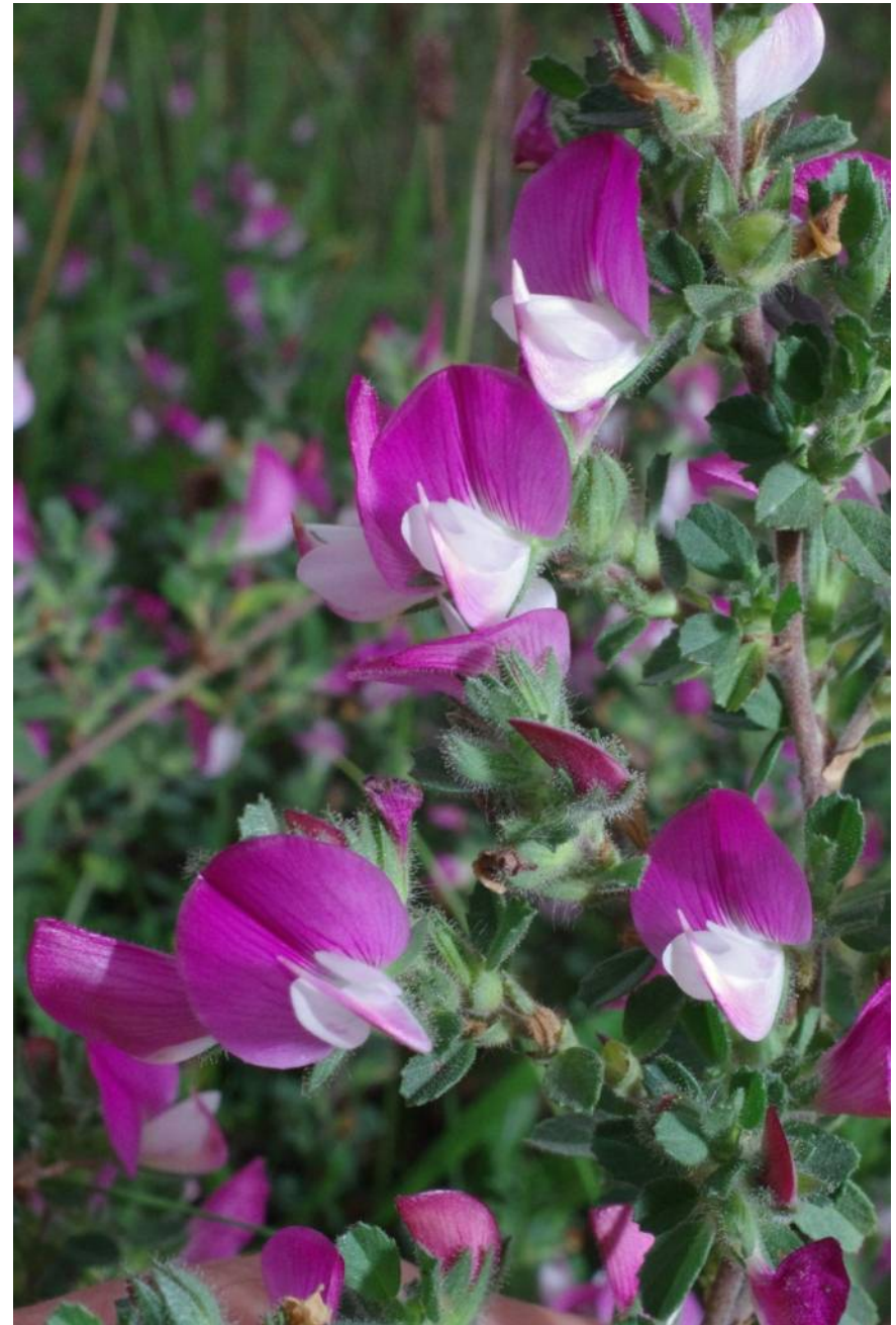
N Thurland, TK 4239/3/2/3, 51°43'57"N, 12°13'34"E, 2.9.13