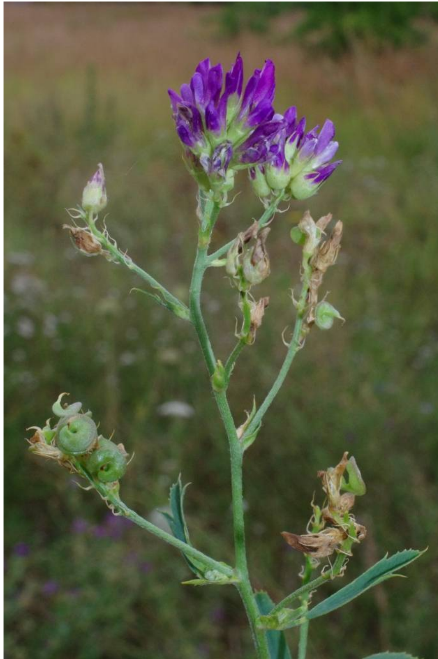
Medicago sativa SW Dessau, TK 4139/3/4/3, 51°48'46"N, 12°14'00"E, 6.8.13