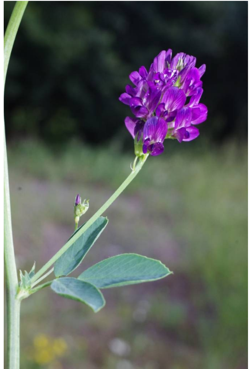
Medicago x varia

O Waldersee, TK 4139/4/2/2, 51°50'49"N / 12°19'37"E, 31.7.2014; 29.158 D