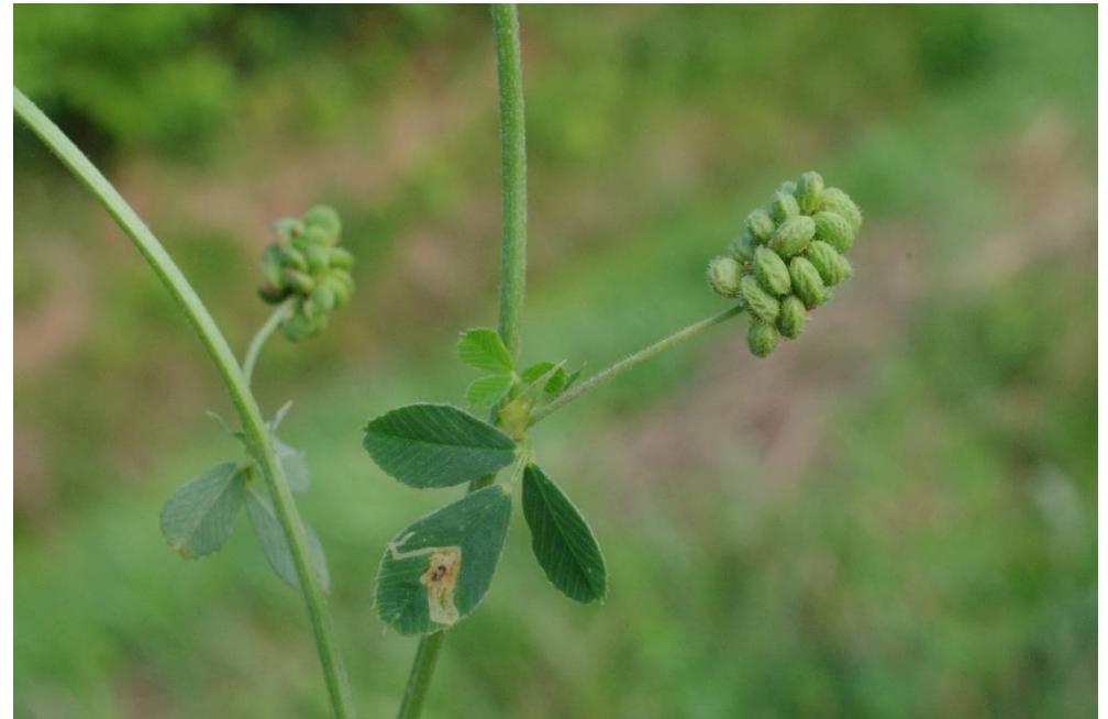
Medicago lupulina L.

3132/244-1, Salzwedel, 52°51'43"N, 11°08'55"E, 17.07.2022