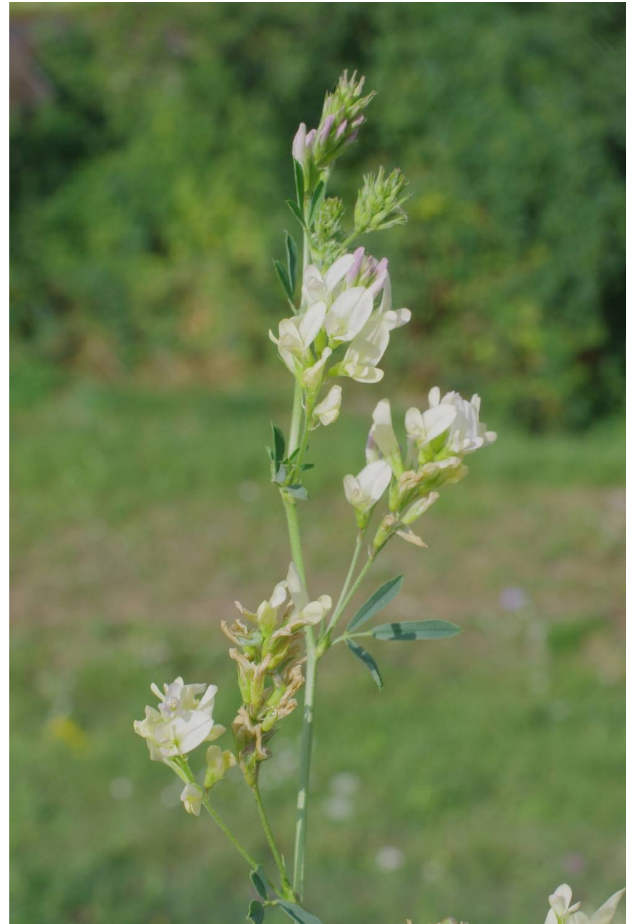
Medicago x varia

4139/413-1, SW Dessau-Waldersee, 51°50'10"N, 12°15'37"E, 04.08.2023