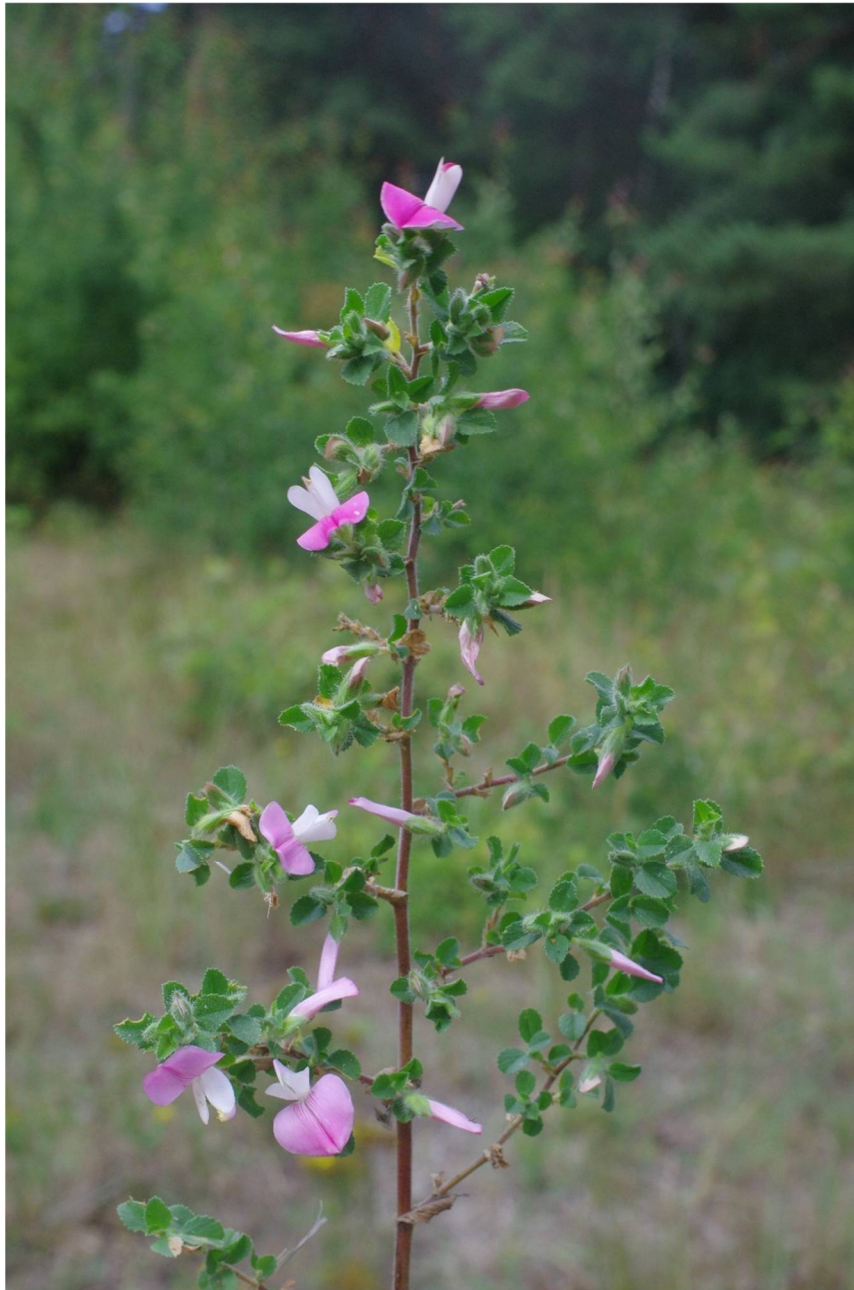
Ononis spinosa 4241/143-1, S Uthausen, 51°45'34"N, 12°33'27"E, 22.07.2023