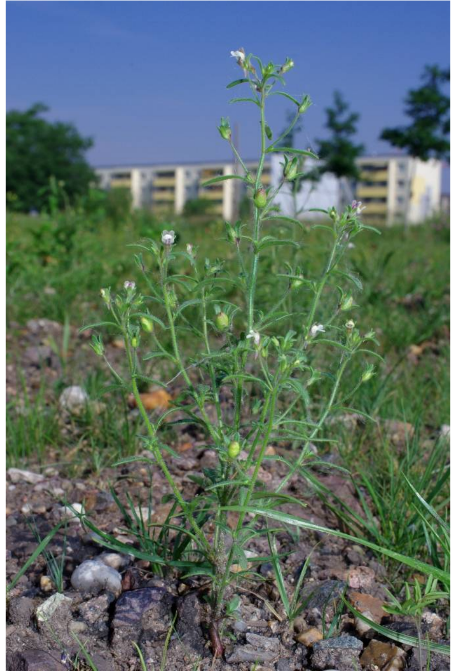
Dessau, TK 4139/3/4/2, 51°49'10"N, 12°14'57"E, 19.6.13