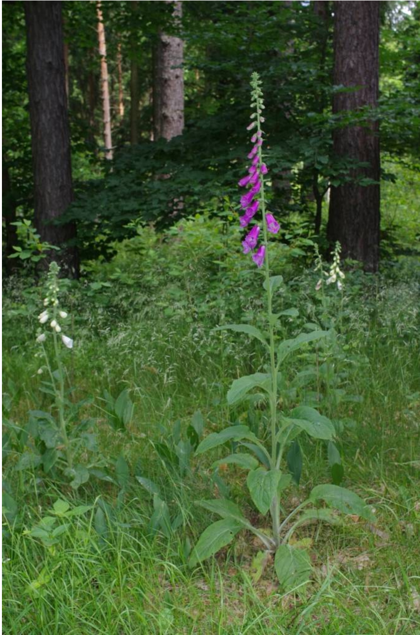
Digitalis purpurea NO Coswig, Pfaffenheide, TK 4040/4/4/3, 51°54'30"N / 12°27'51"E, 2.6.2014