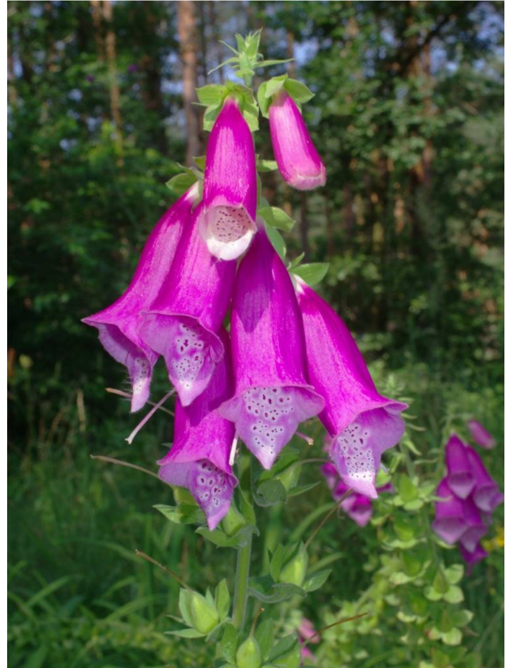
S Haideburg, TK 4239/1/2/4, 51°47'02"N, 12°14'39"E, 6.7.13