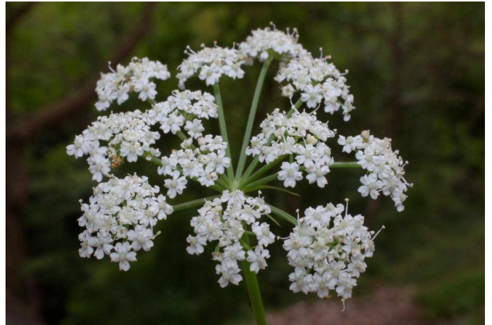
Ioannina, Amaranthos, 40°09'28"N, 20°42'53"E, 22.9.14 246.315