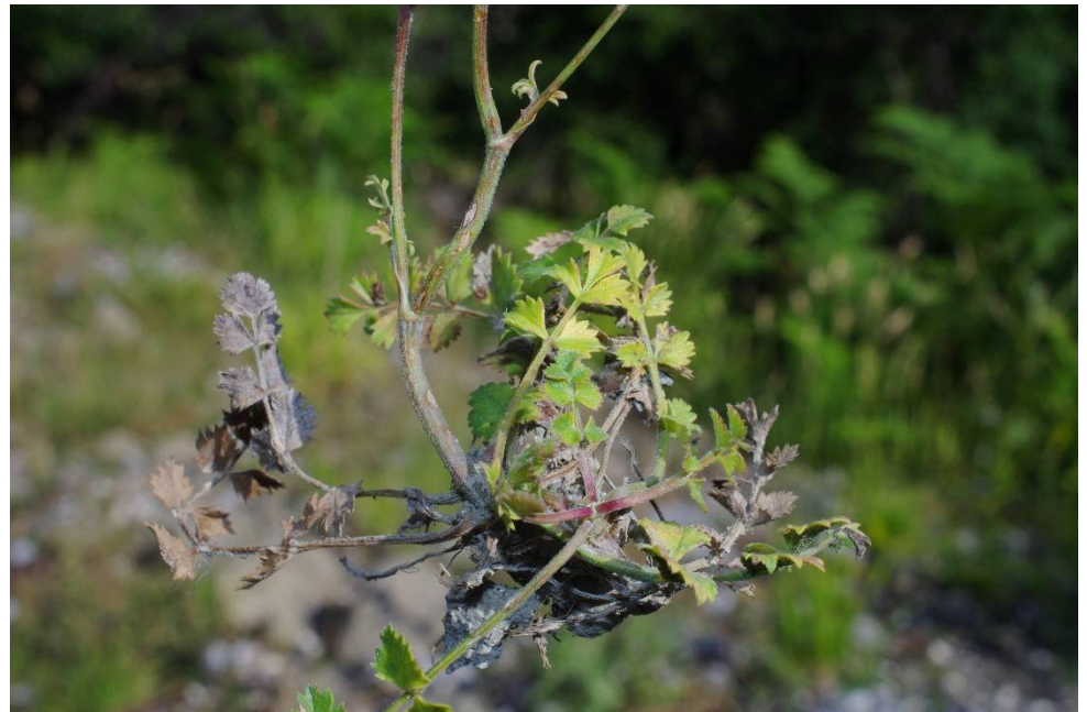
Pimpinella tragium subsp. tragium

Ioannina, Anilio, 1233 m, 39°45'34"N, 21°11'58"E, 20.07.2017; 284.068