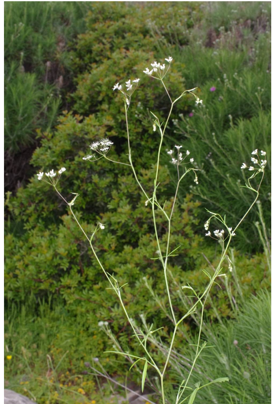
Las 053, Kreta, Lassithi, SW Plaka, 35°17'30"N, 25°43'48"E, 12.04.2017 275.671