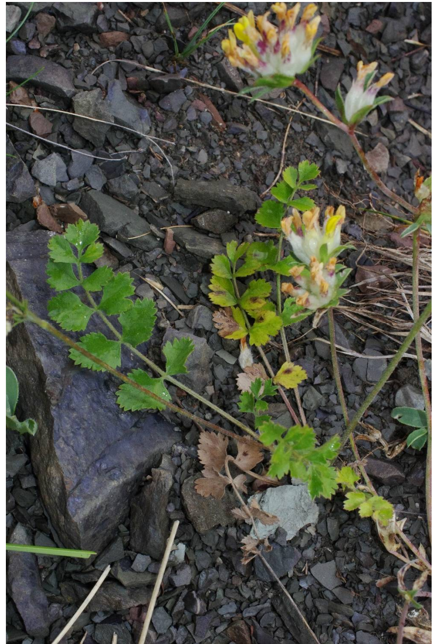
Ioannina, ONO Anilio, 940 m, 39°45'25"N, 21°11'13"E, 16.06.2017; 276.952