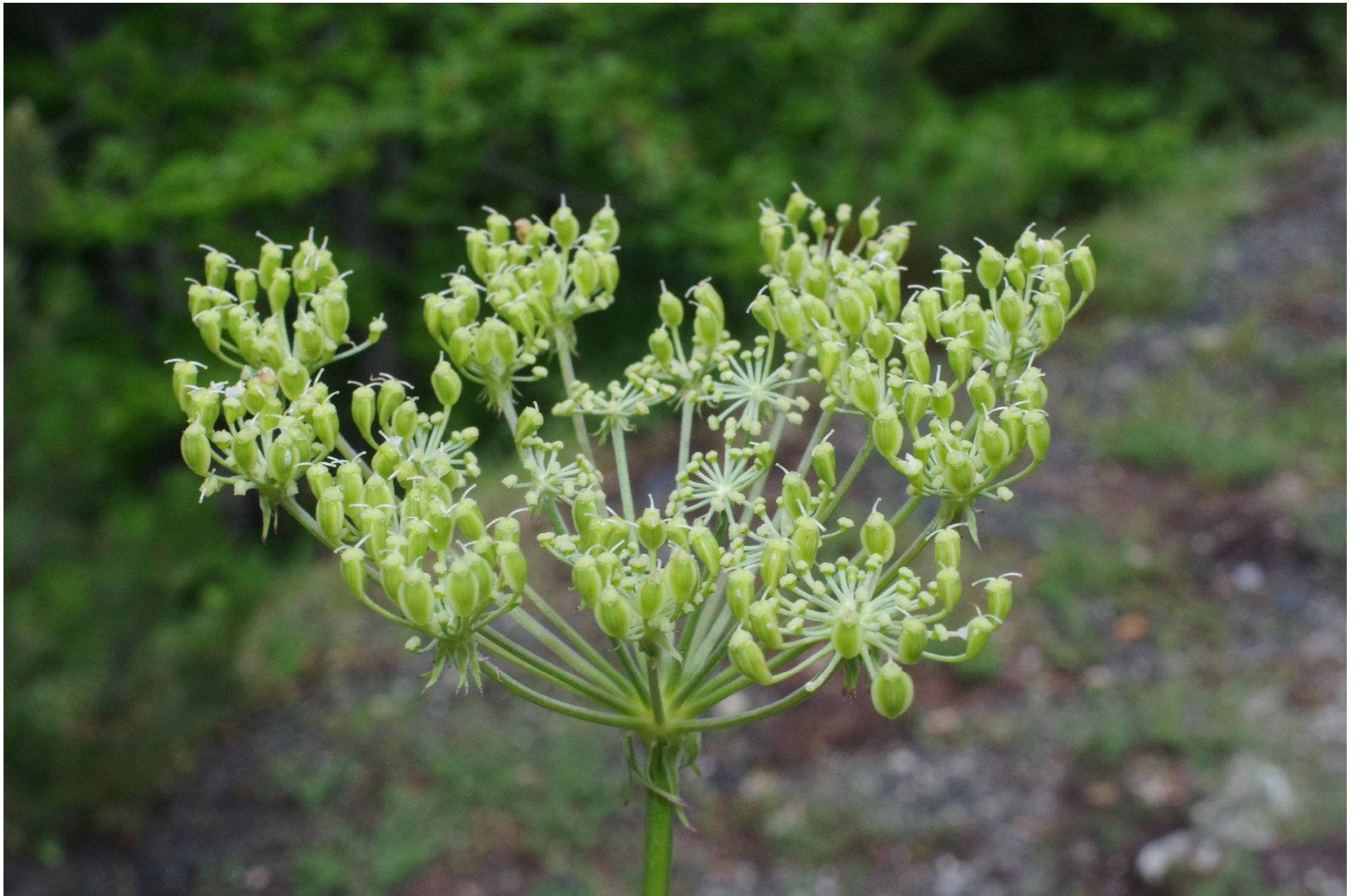
Peucedanum austriacum Imathia, S Ag. Pavlos, 1275 m, 40°40'05"N, 21°57'47"E, 18.07.2017 283.788