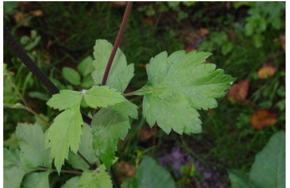
Pastinaca sativa subsp. urens

Pella, SW Edessa, 40°48'20"N, 22°00'51"E, 15.10.14 251.562