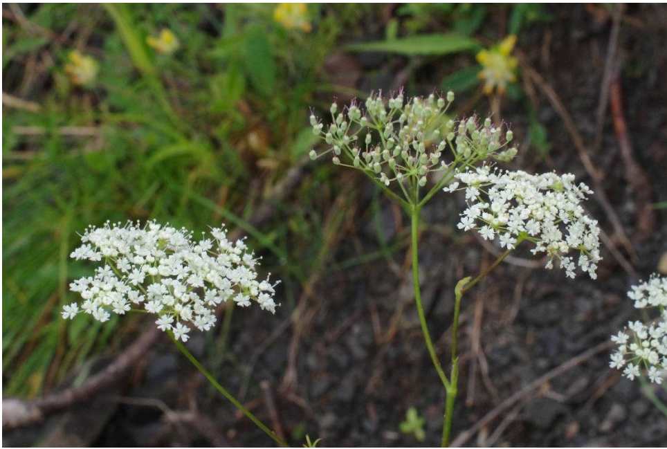
Pimpinella tragium subsp. tragium