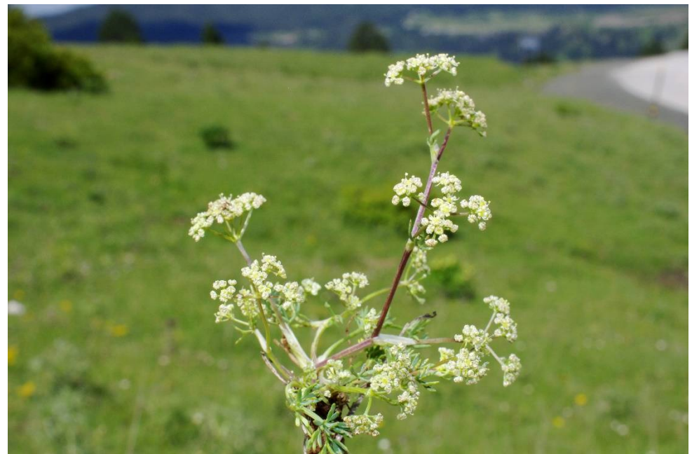
Trinia glauca subsp. pindica

Ioannina, NO Metsovo, 1559 m, 39°47'31"N, 21°12'17"E, 19.07.2017