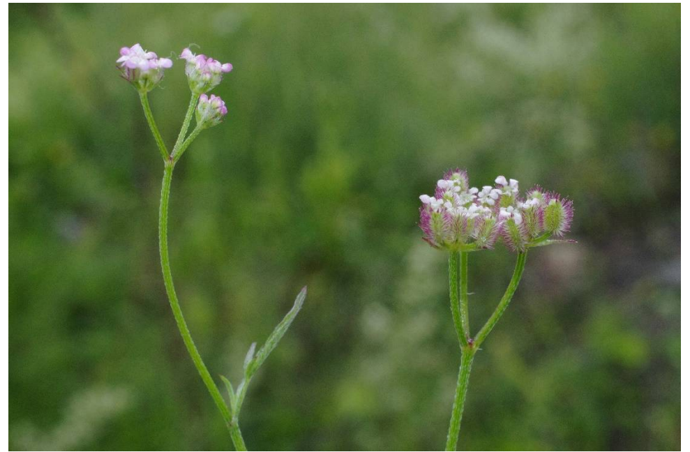
Ioannina, W Metsovo, 1165 m, 39°46'03"N, 21°10'06"E, 16.06.2017