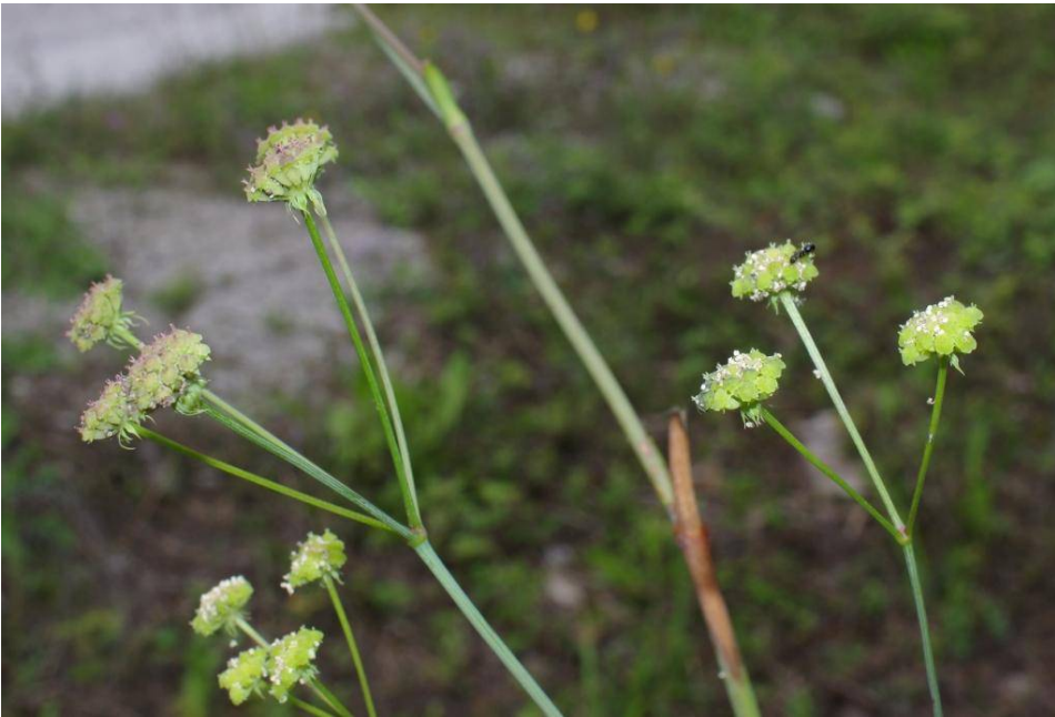
loa 971, Ioannina, S Piji, 40°03'43"N, 20°47'37"E, 20.9.14 224