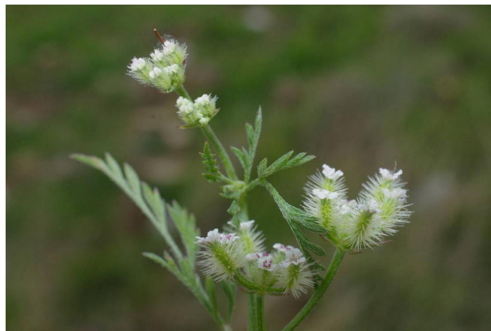
Hal 312, Chalkidiki, N Simantra, 40°24'11"N, 23°19'56"E, 16.05.2019; 299.102