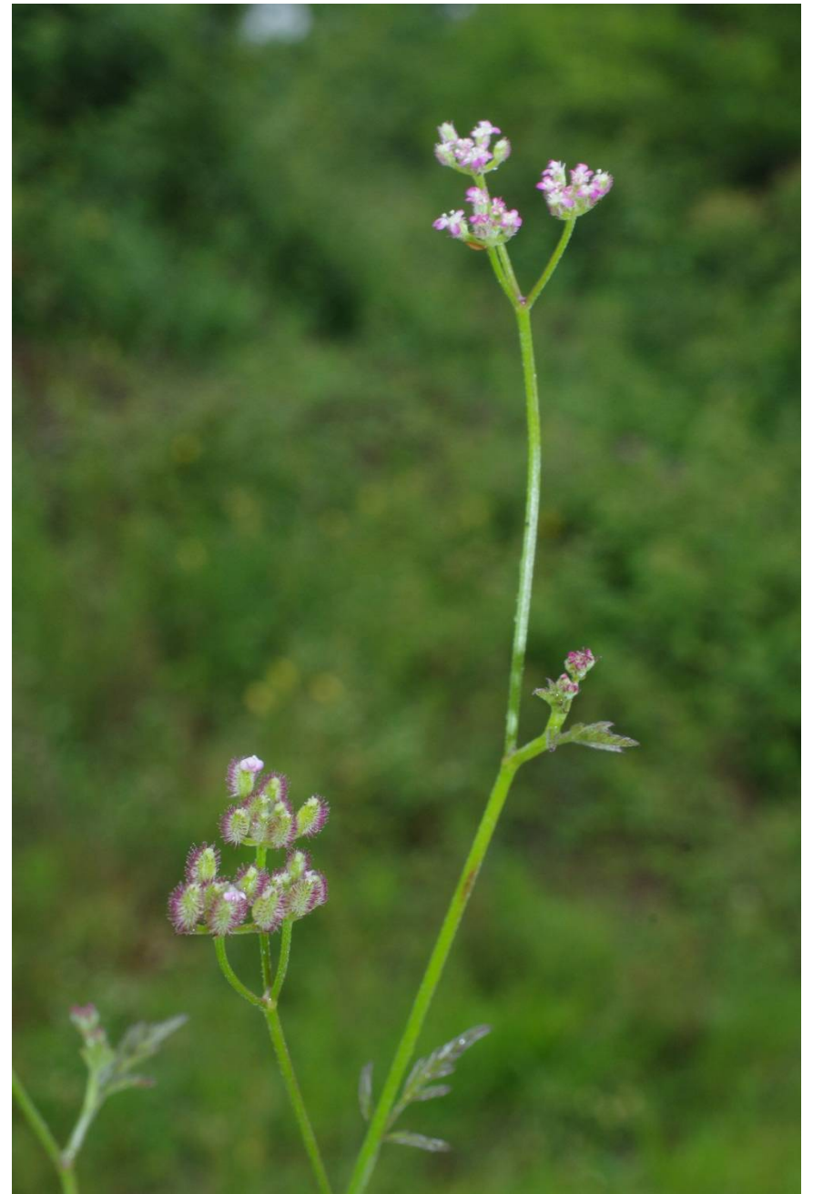
Arta, SW Vourgareli, 39°19'19"N, 21°09'44"E, 20.05.2016