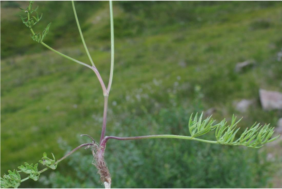
Trinia glauca subsp. pindica

Pella, Kajmaktsalan, 1873 m, 40°54'09"N, 21°49'32"E, 14.07.2017; 283.333