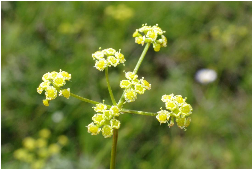
Trinia glauca subsp. pindica

Ioannina, NO Metsovo, 1559 m, 39°47'31"N, 21°12'17"E, 19.07.2017; 276.391