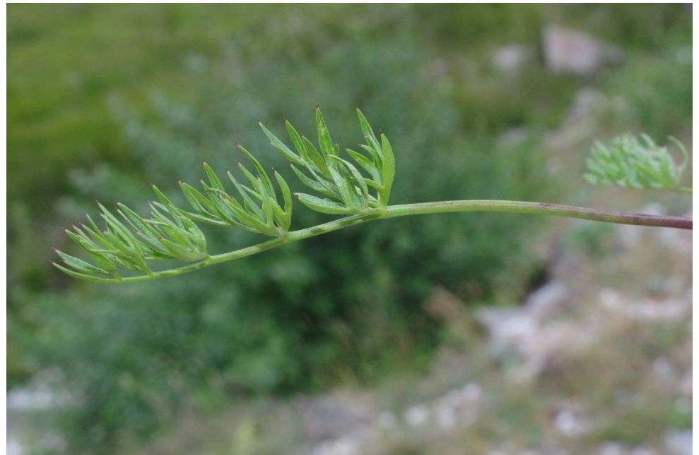
Trinia glauca subsp. pindica

Pella, Kajmaktsalan, 1873 m, 40°54'09"N, 21°49'32"E, 14.07.2017; 283.333