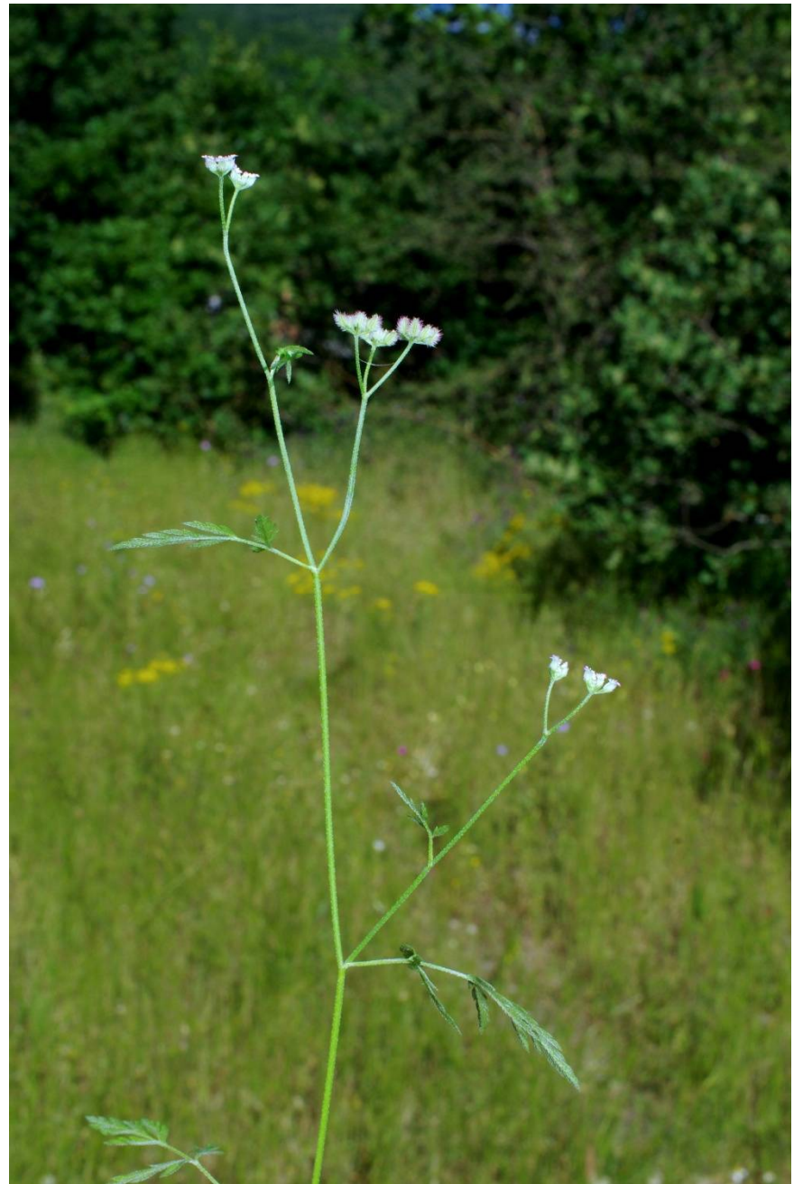
Trikala, W Kalambaka, 39°44'41"N, 21°31'47"E, 25.05.2016