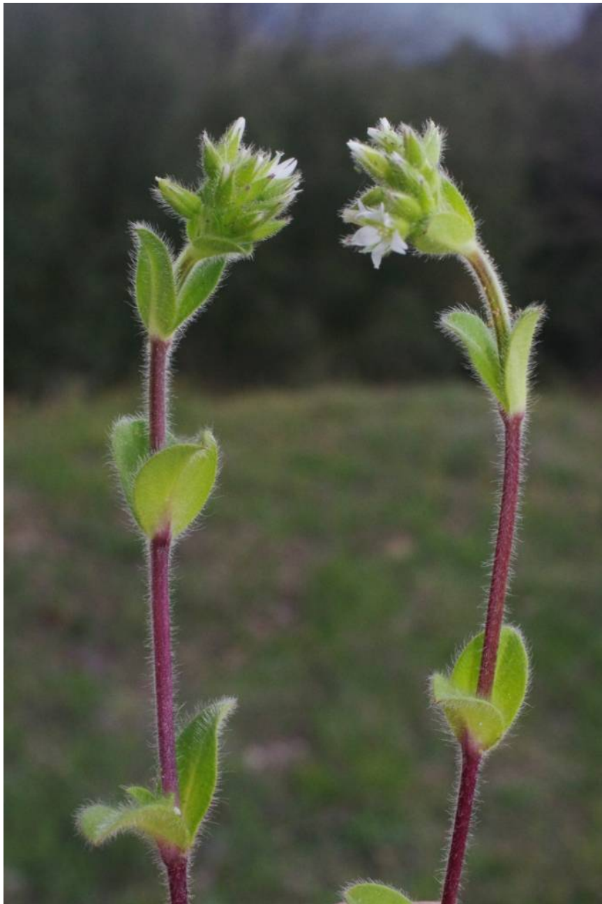
Cerastium glomeratum 255.057 Halkidhiki, Vavdos, 40°26'26"N, 23°19'17"E, 25.04.2015