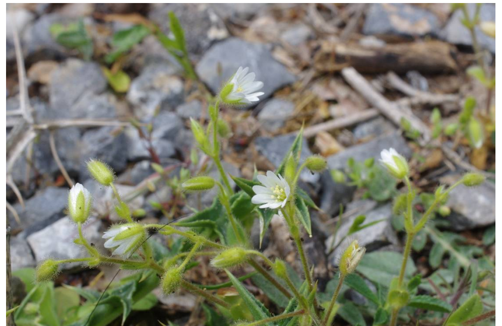
Cerastium brachypetalum subsp. doerfleri

Kreta, Irakleion, NNW Gergeri, 35°08'56"N, 24°56'21"E, 23.04.2017; 276.139