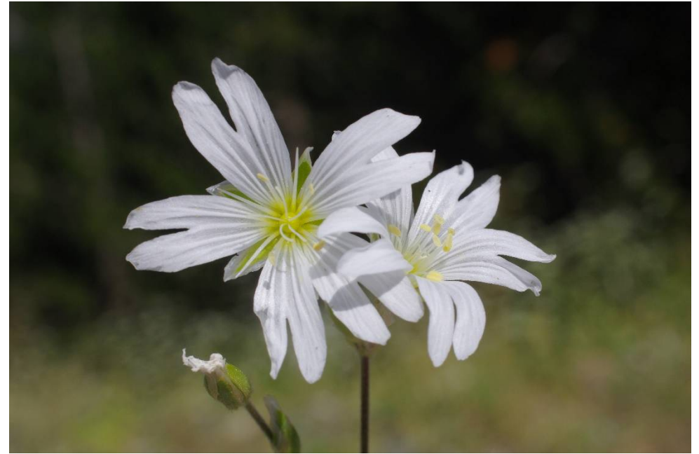
Ioannina, Katara-Pass, 1775 m, 39°46'55"N, 21°13'30"E, 19.07.2017; 284.015