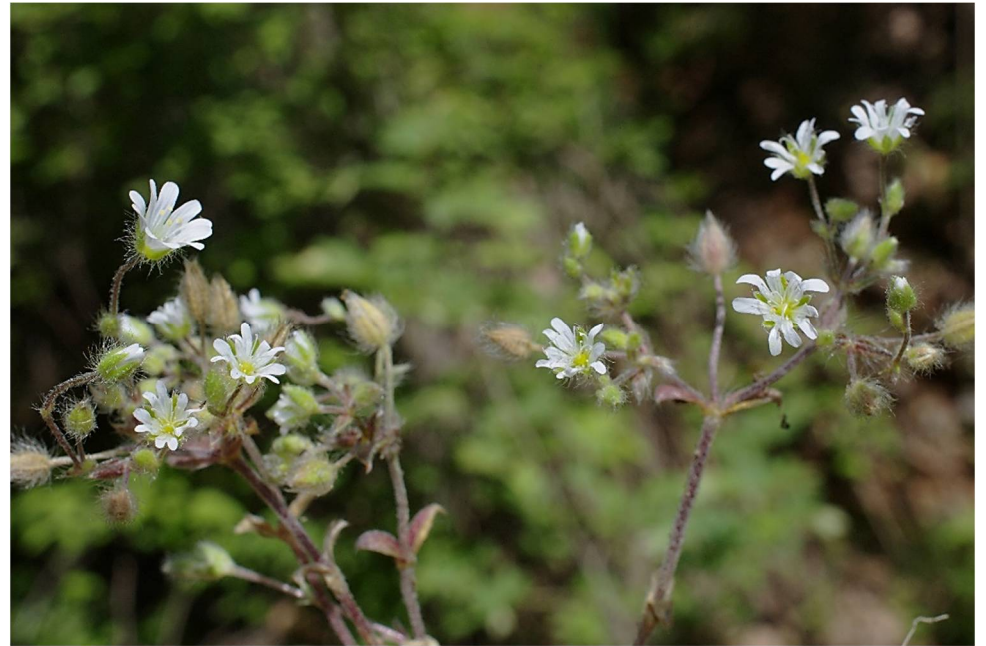
Cerastium brachypetalum subsp. atheniense Arkadia, Ag.Petros, 37°17'35"N, 22°35'30"E, 26.05.2018; 291.101