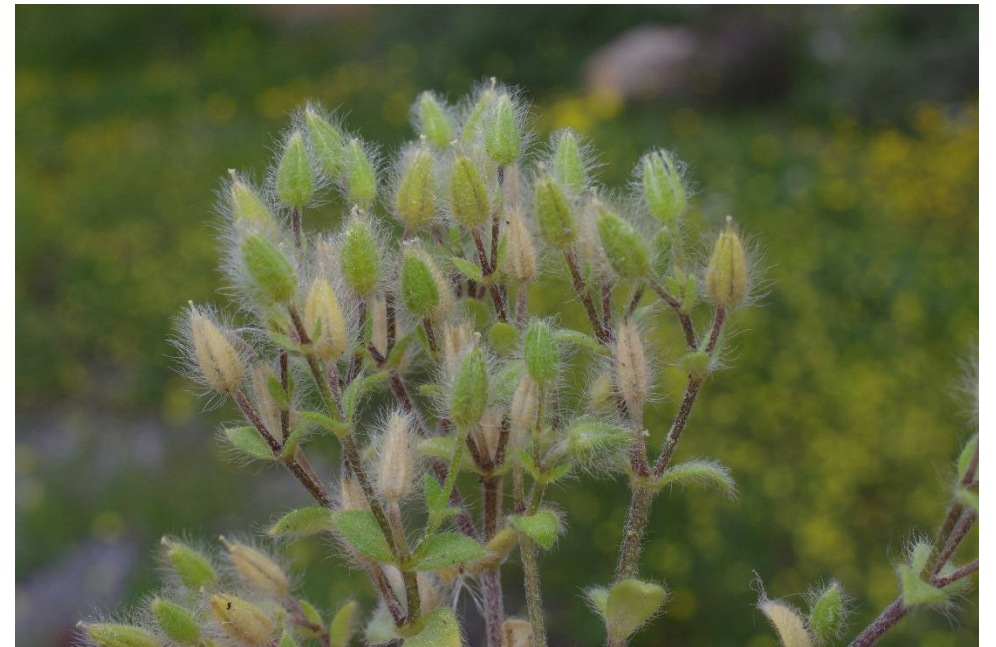
Cerastium comatum Kreta, Lassithi, O Ag. Ioannis, 35°03'09"N, 25°52'23"E, 19.04.2017