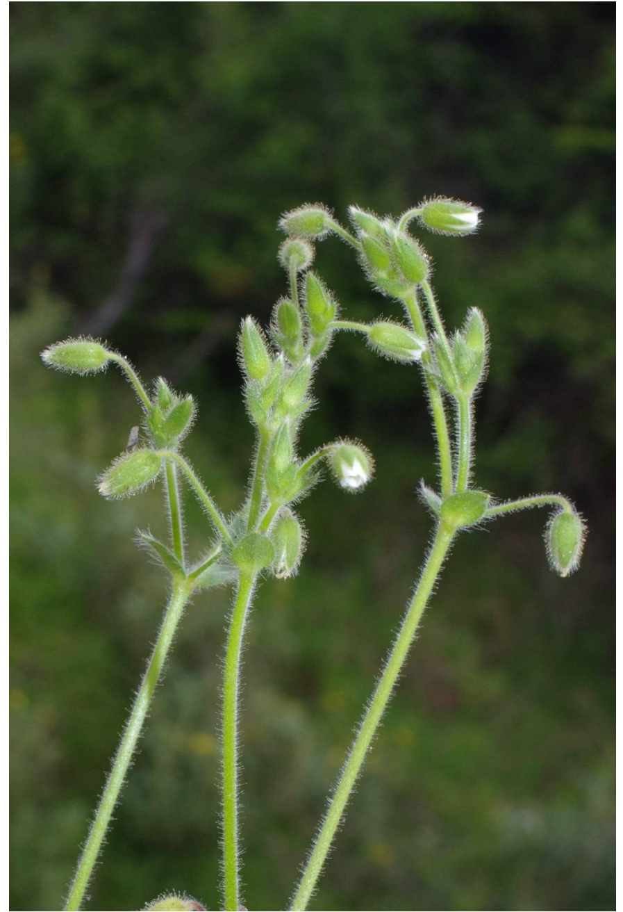
Cerastium brachypetalum subsp. roeseri Arta, W Vourgareli, 39°22'49"N, 21°10'46"E, 18.05.2016