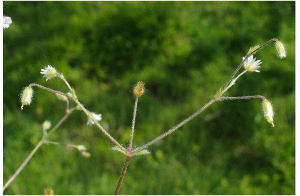
Cerastium brachypetalum subsp. tenoreanum SW Echinus, 41°15'54"N, 24°56'44"E, 18.05.2015; 261.867