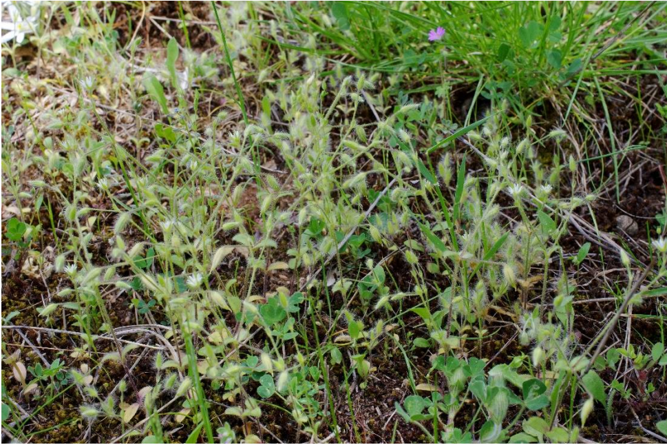
Cerastium brachypetalum subsp. atheniense