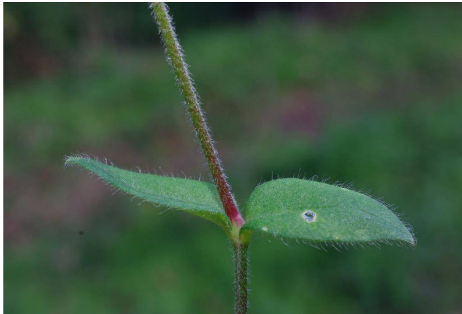
Cerastium holosteoides Grevena, Perivolaki, 40°02'05"N, 21°13'58"E, 29.09.2014; 247.811