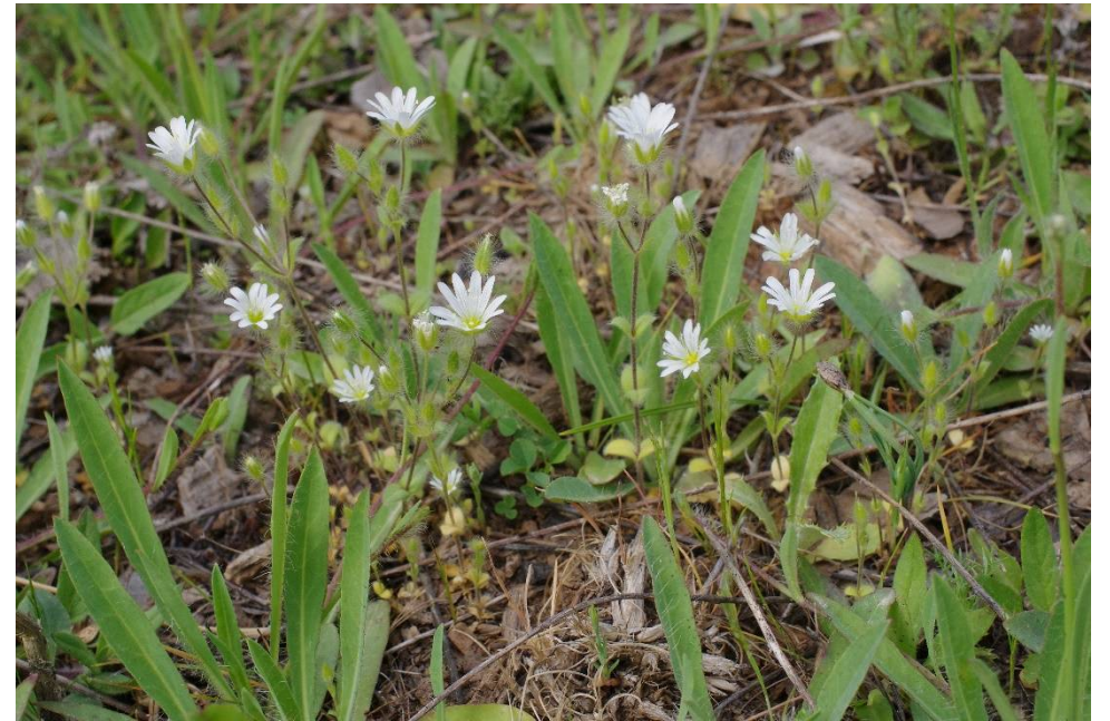
Cerastium brachypetalum subsp. atheniense Korinthia, NW Karya, 38°01'39"N, 22°23'40"E, 02.05.2018; 285.650