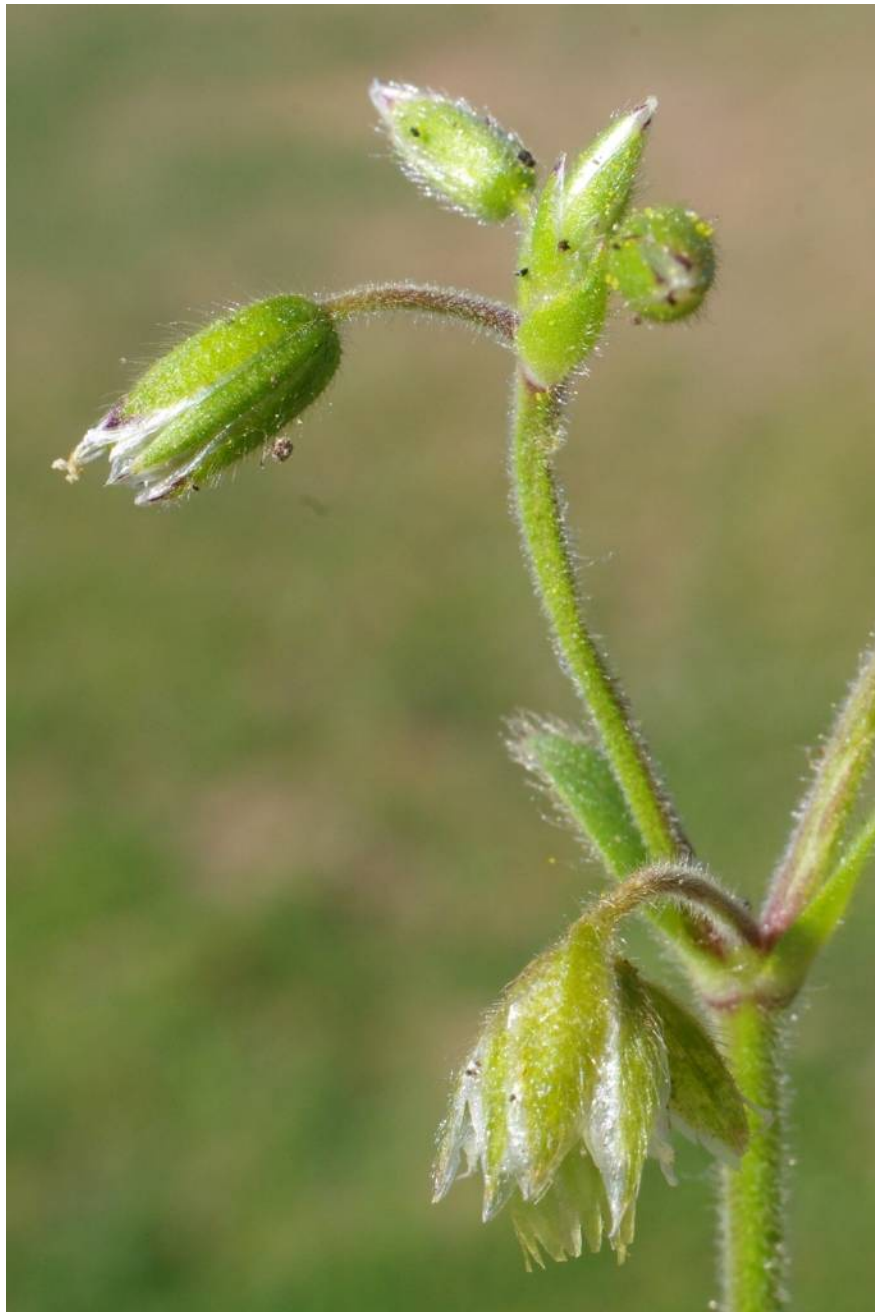
Cerastium brachypetalum subsp. roeseri Drama, Volakas, Falakron, 41°18'23"N, 24°00'33"E, 26.05.2015