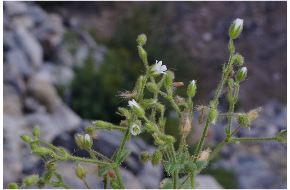
Cerastium brachypetalum subsp. roeseri Kreta, Irakleion, Zaros, 35°08'50"N, 24°54'25'E, 23.04.2017; 276.119