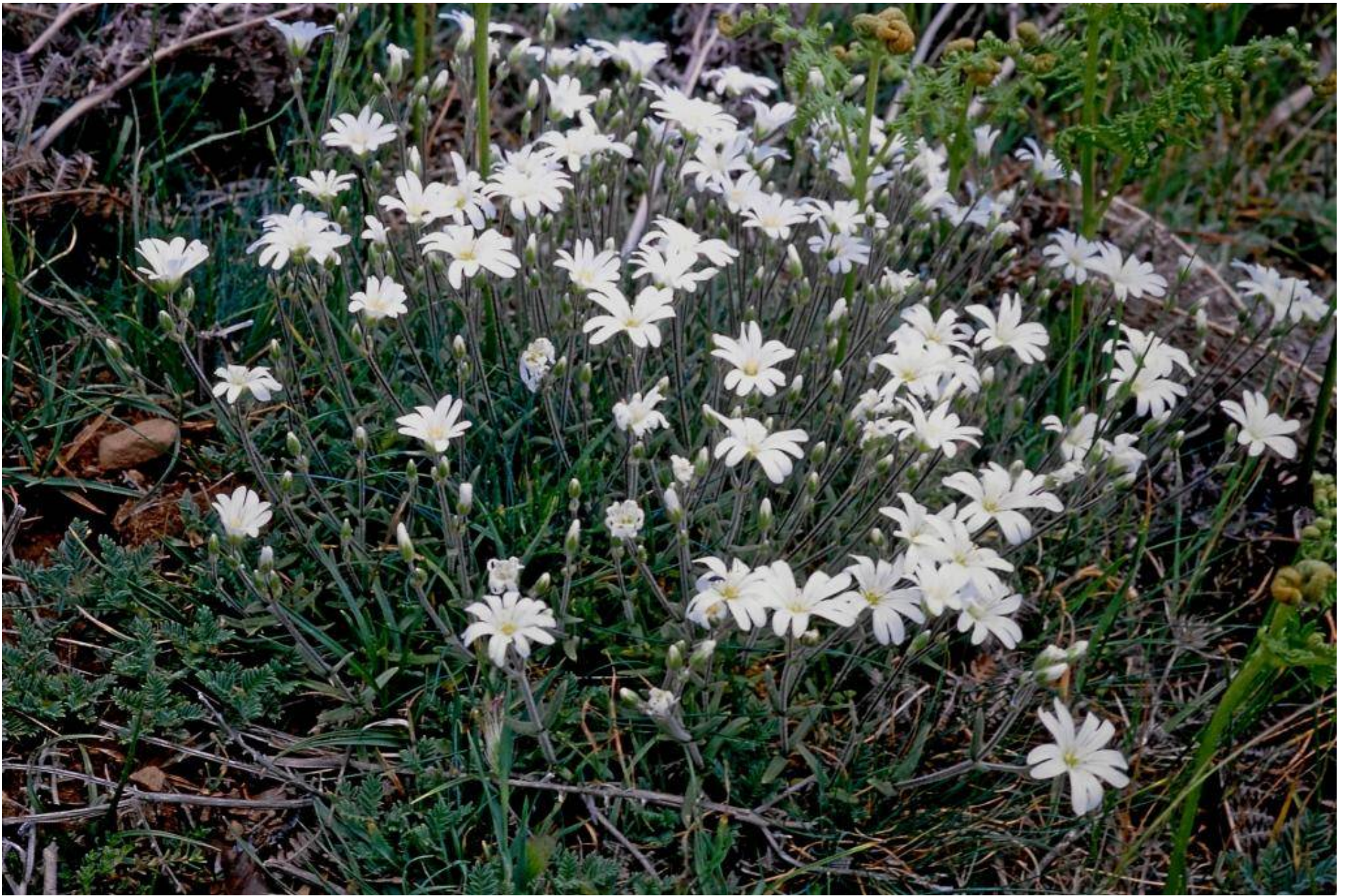
Cerastium banaticum subsp. speciosum

Evritania, 2,7 km O Aj. Nikolaos, 1350 m, 28.05.1988