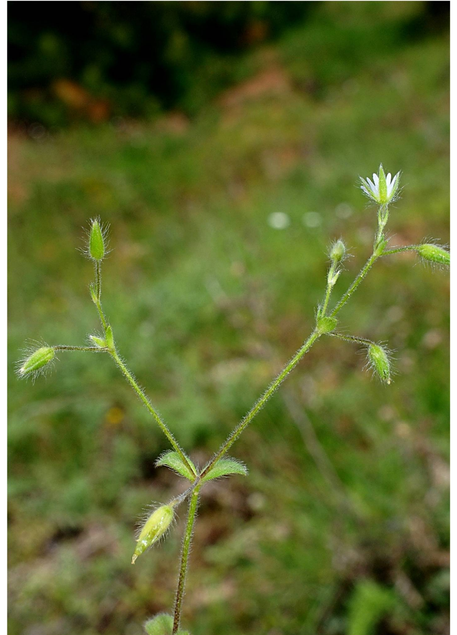
Korinthia, WSW Evrostina, 38°02'52"N, 22°23'04"E, 02.05.2018; 285.590