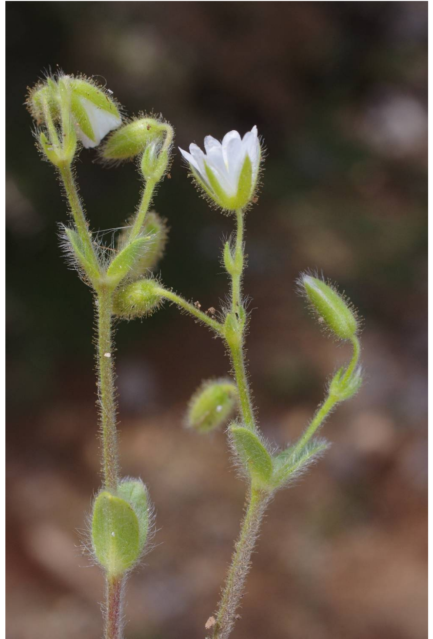
Cerastium brachypetalum subsp. doerfleri

Kreta, Irakleion, NNW Gergeri, 35°08'56"N, 24°56'21"E, 23.04.2017