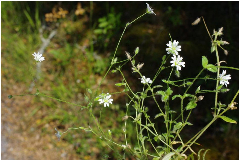
Cerastium brachypetalum subsp. tenoreanum

Ioannina, NO Dodoni, 645 m, 39°33'19"N, 20°46'39"E, 12.06.2017; 276.336