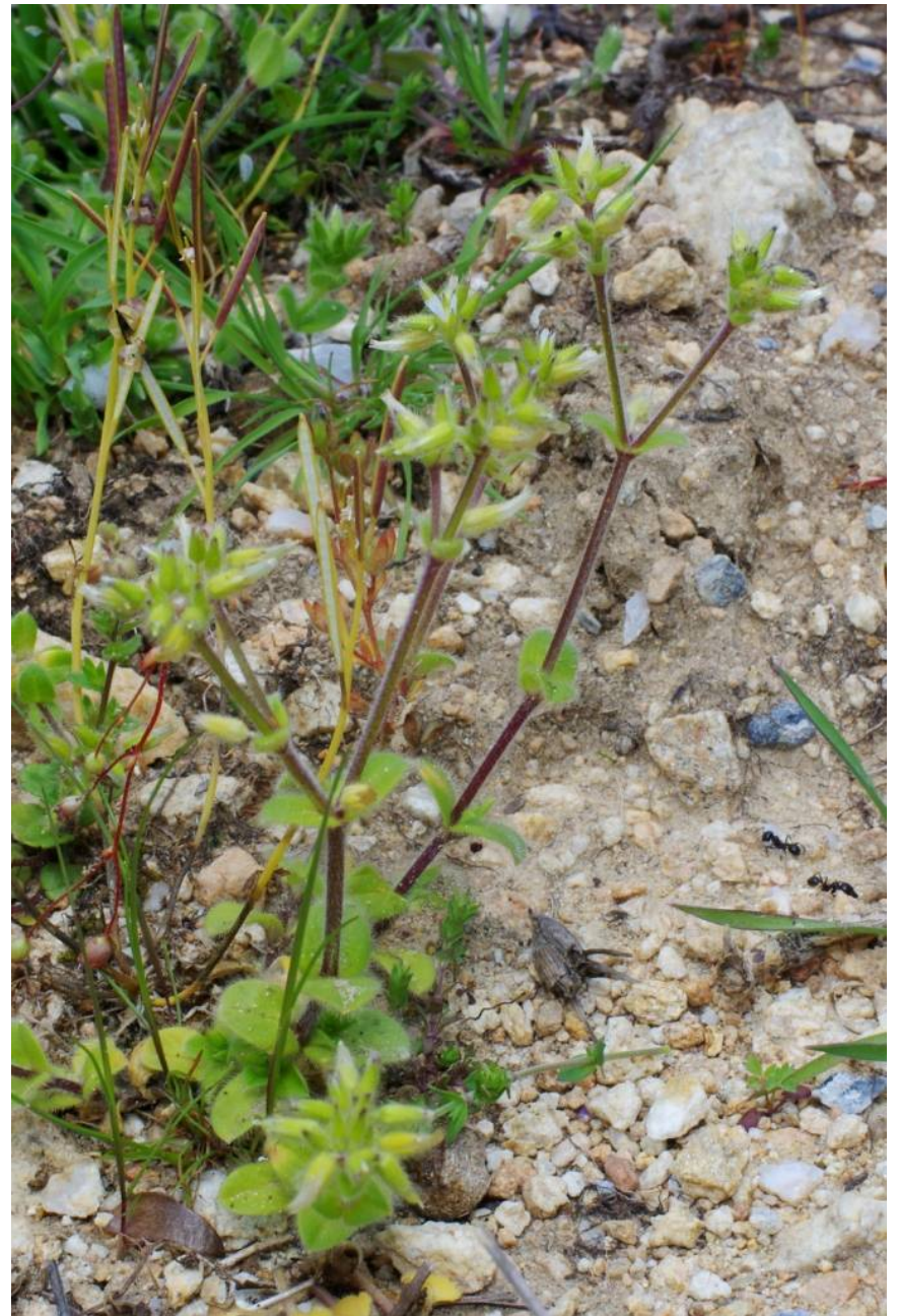
Halkidhiki, Stanos, 40°31'58"N, 23°35'3 "E, 26.04.2015; 255.345