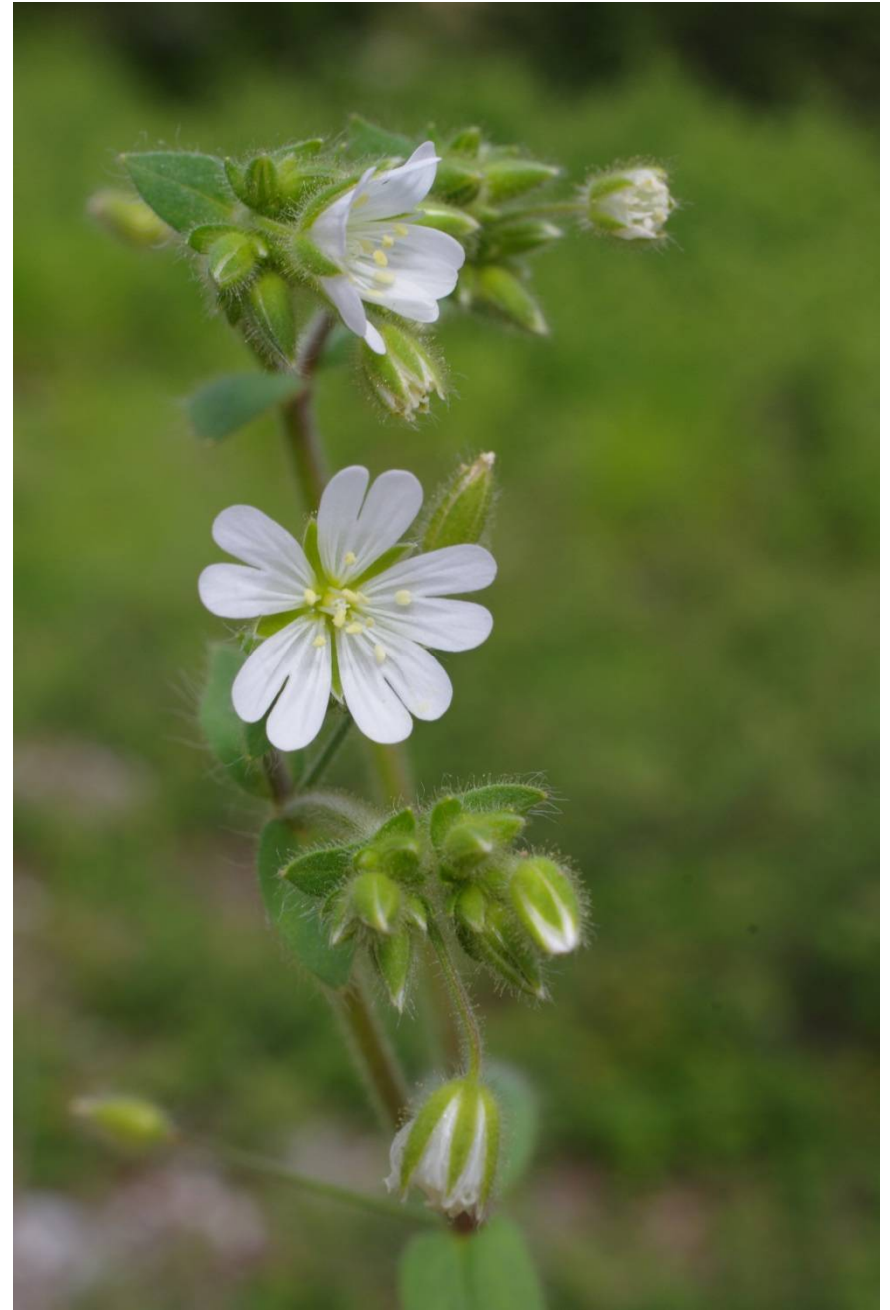
Cerastium brachypetalum subsp. pindigenum

Arta, SO Athamani, 39°21'03"N, 21°14'52"E, 19.05.2016 273.715