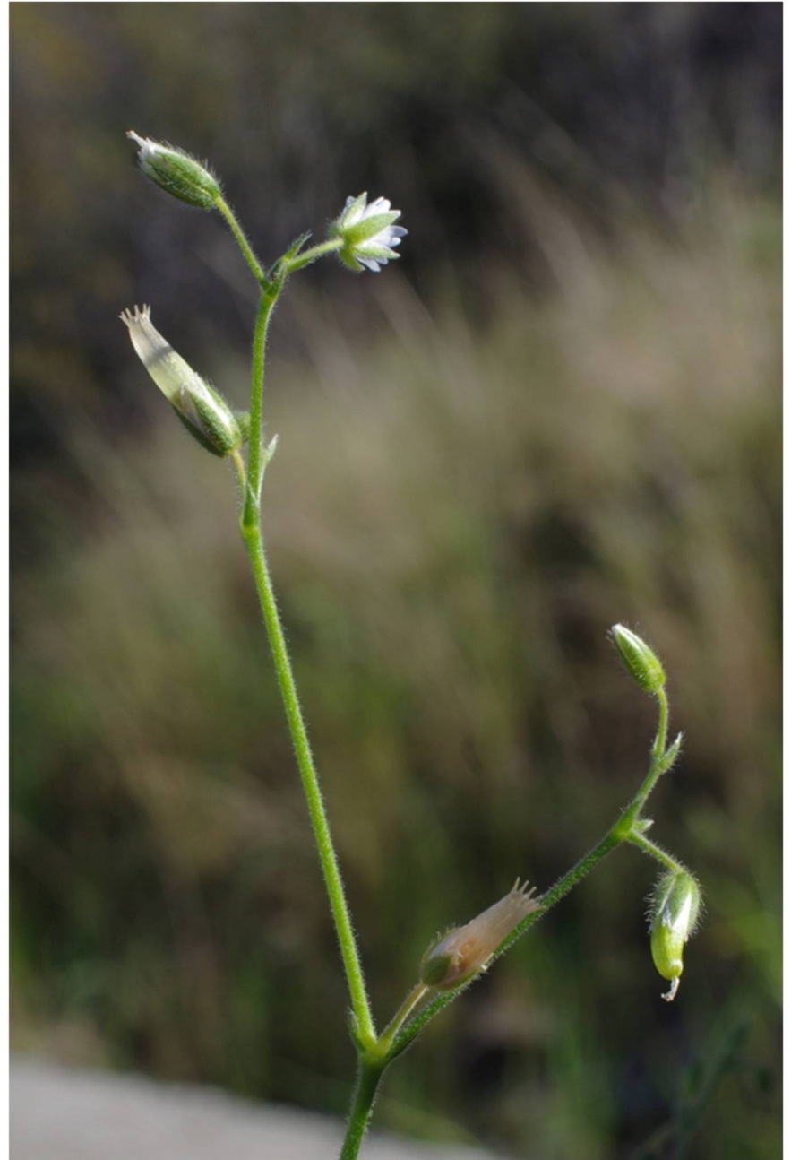
Imathia, Kato Vermion, 40°33'04"N, 22°01'43"E, 21.10.2014