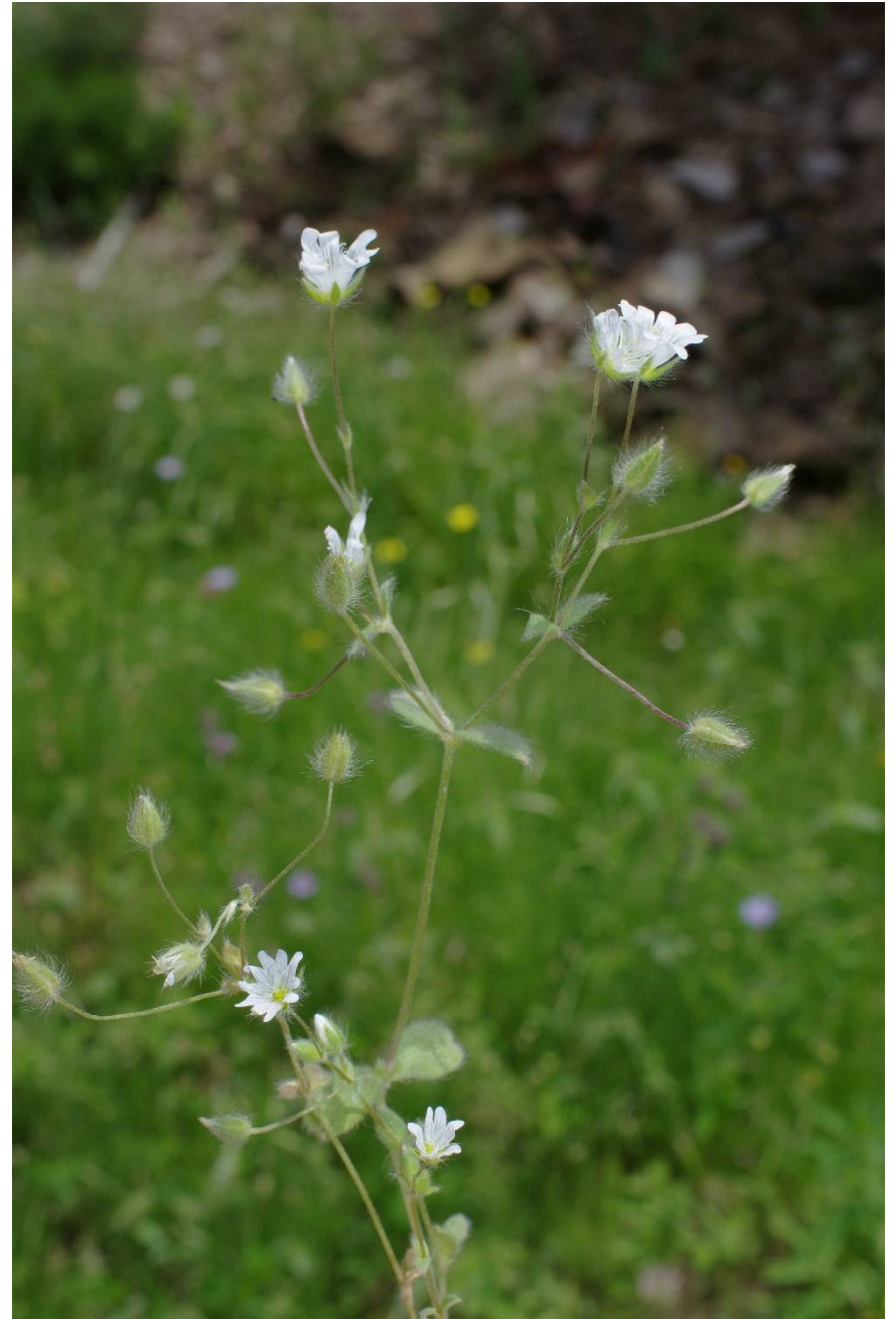
Arkadia, WNW Mega Tourla, 37°17'02"N, 22°35'19"E, 26.05.2018; 291.177