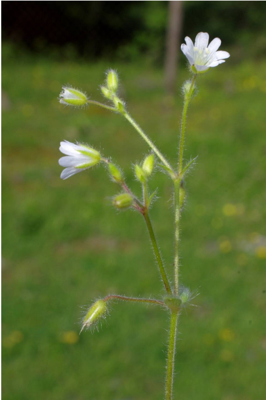
Cerastium brachypetalum subsp. tenoreanum

Arta, S Athamani, 39°22'20"N, 21°13'56"E, 19.05.2016