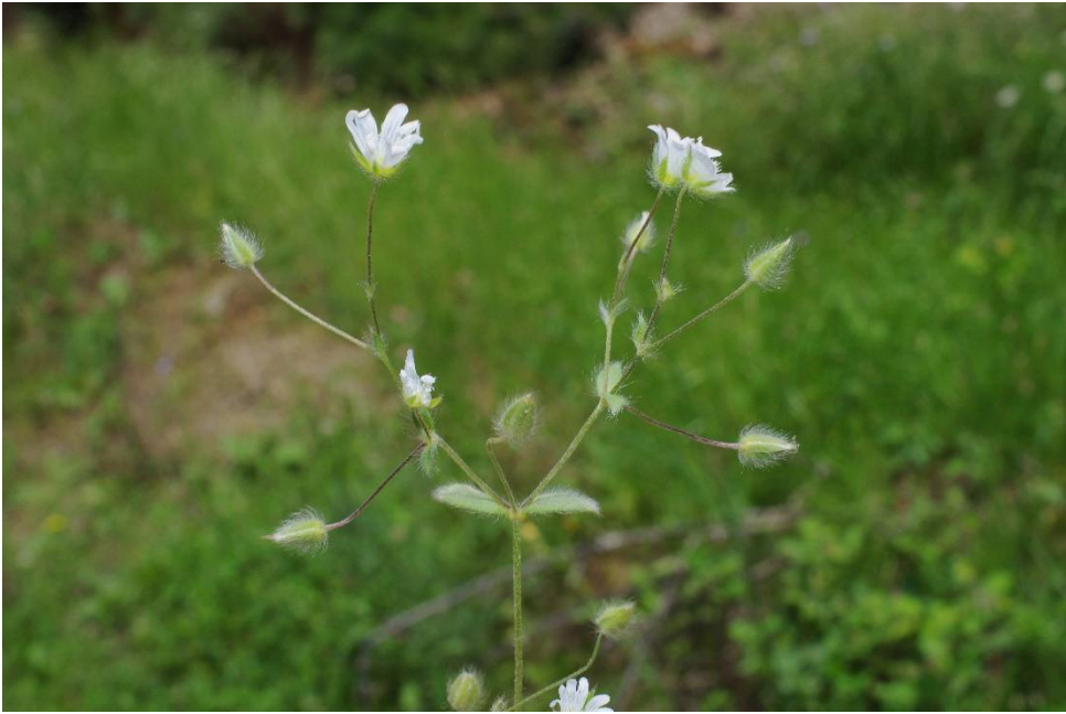
Cerastium brachypetalum subsp. atheniense