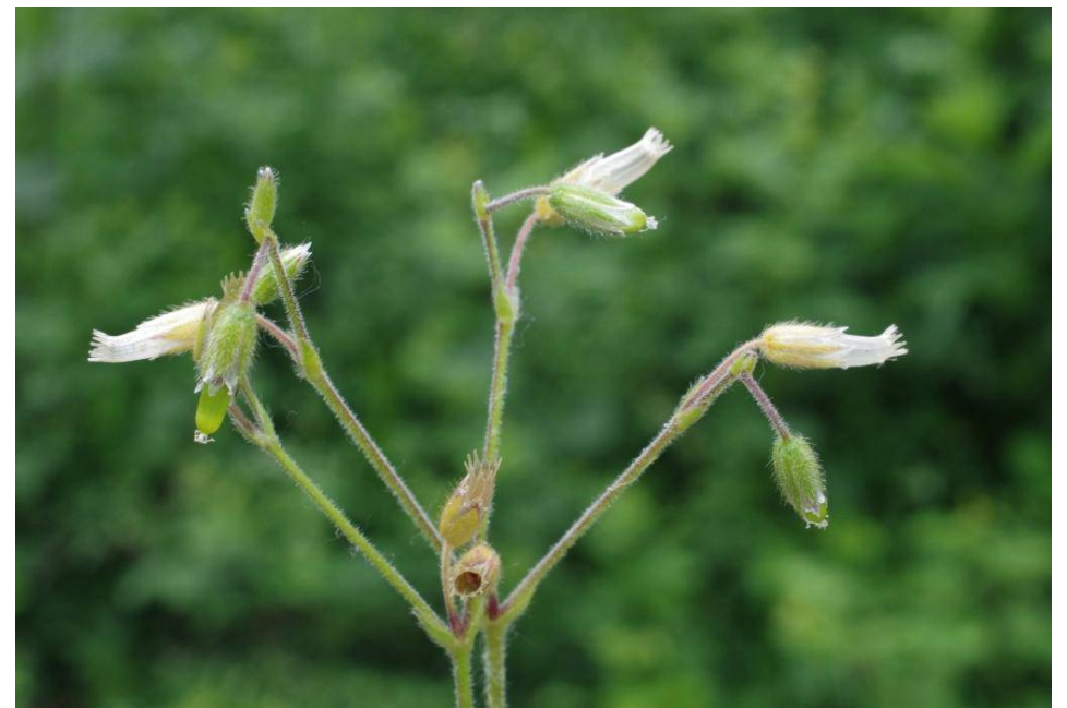
Drama, NO Volakas, 41°23'02"N, 24°03'56"E, 28.05.2015; 265.096