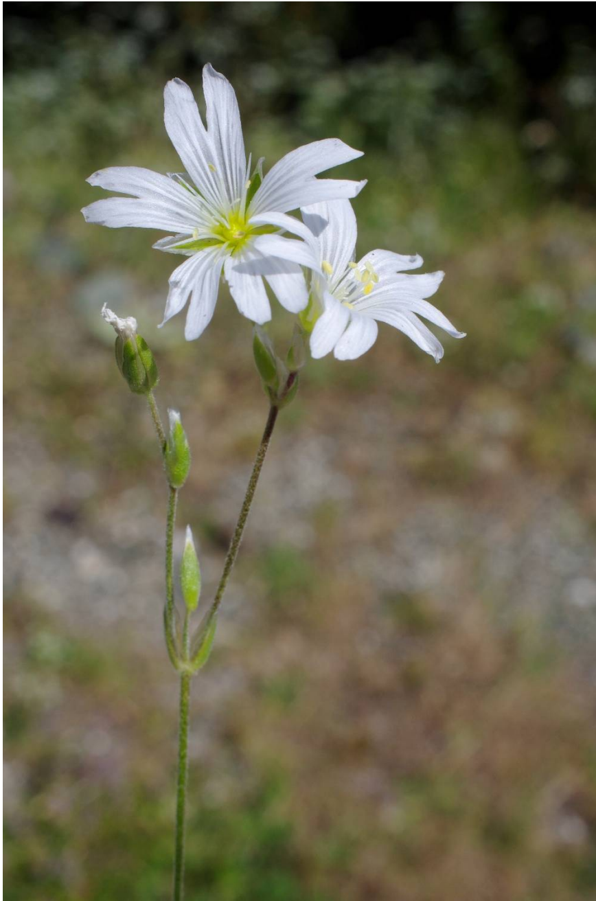
Cerastium banaticum subsp. speciosum