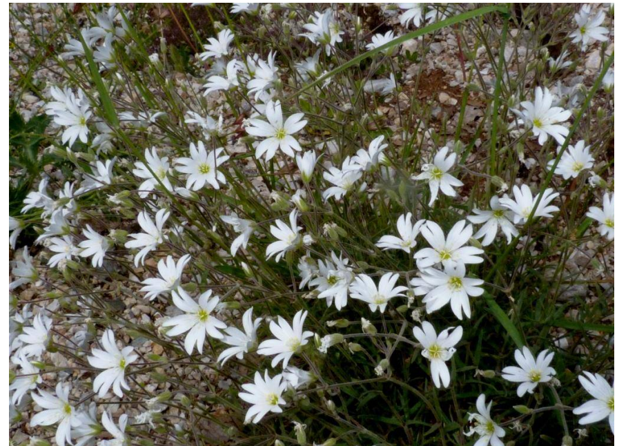
Cerastium banaticum subsp. banaticum

Kozanis, S Galatini, 40°17'37"N, 30.5.12, 21°32'54"E, 30.5.12