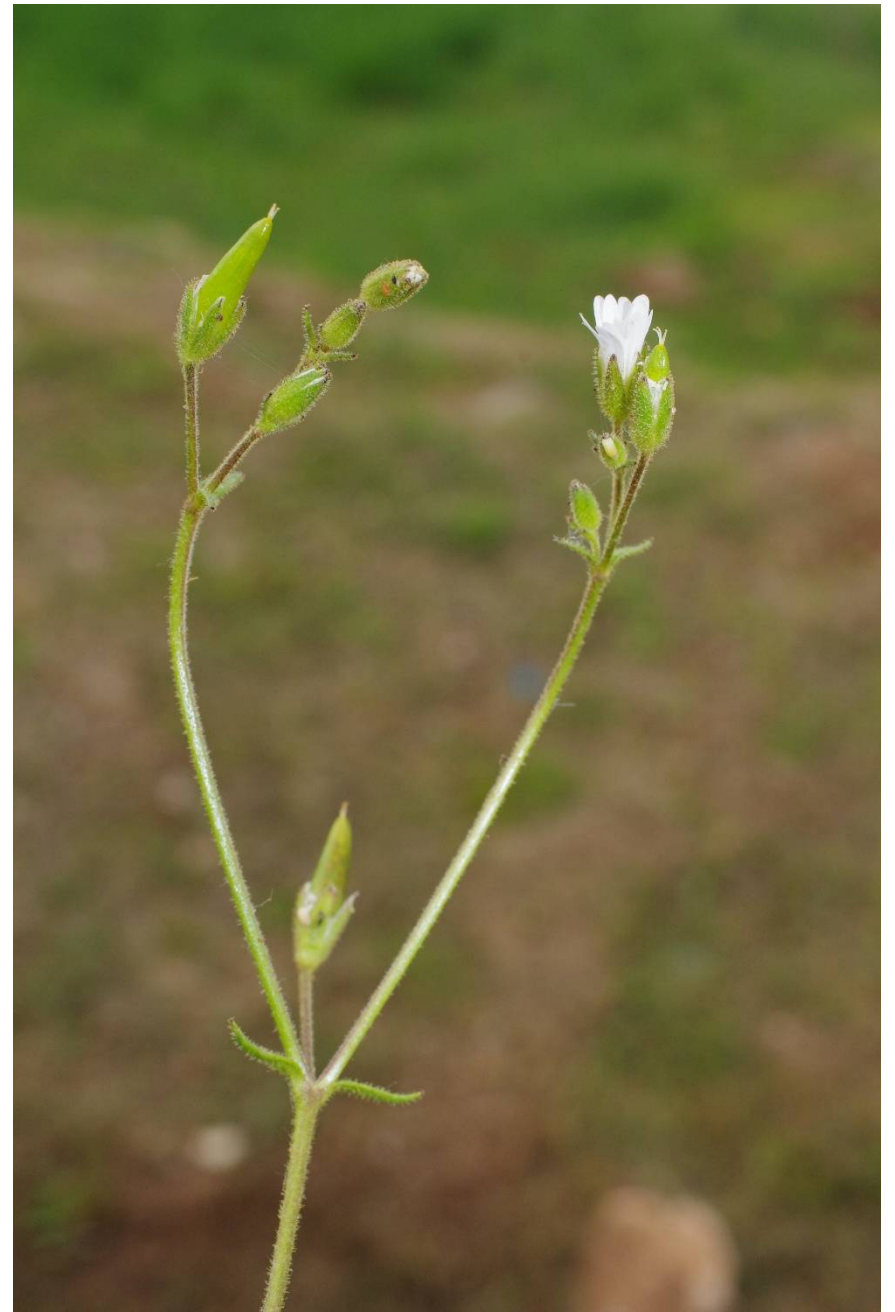
Kozanis, WSW Kozanis, 40°17'43"N, 21°43'16"E, 24.04.2019; 293.926