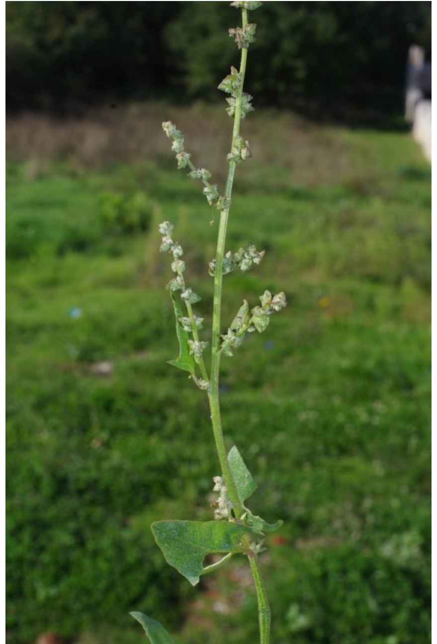
Florina, N Florina, 40°47'40"N, 21°24'46"E, 11.10.2014; 250.616