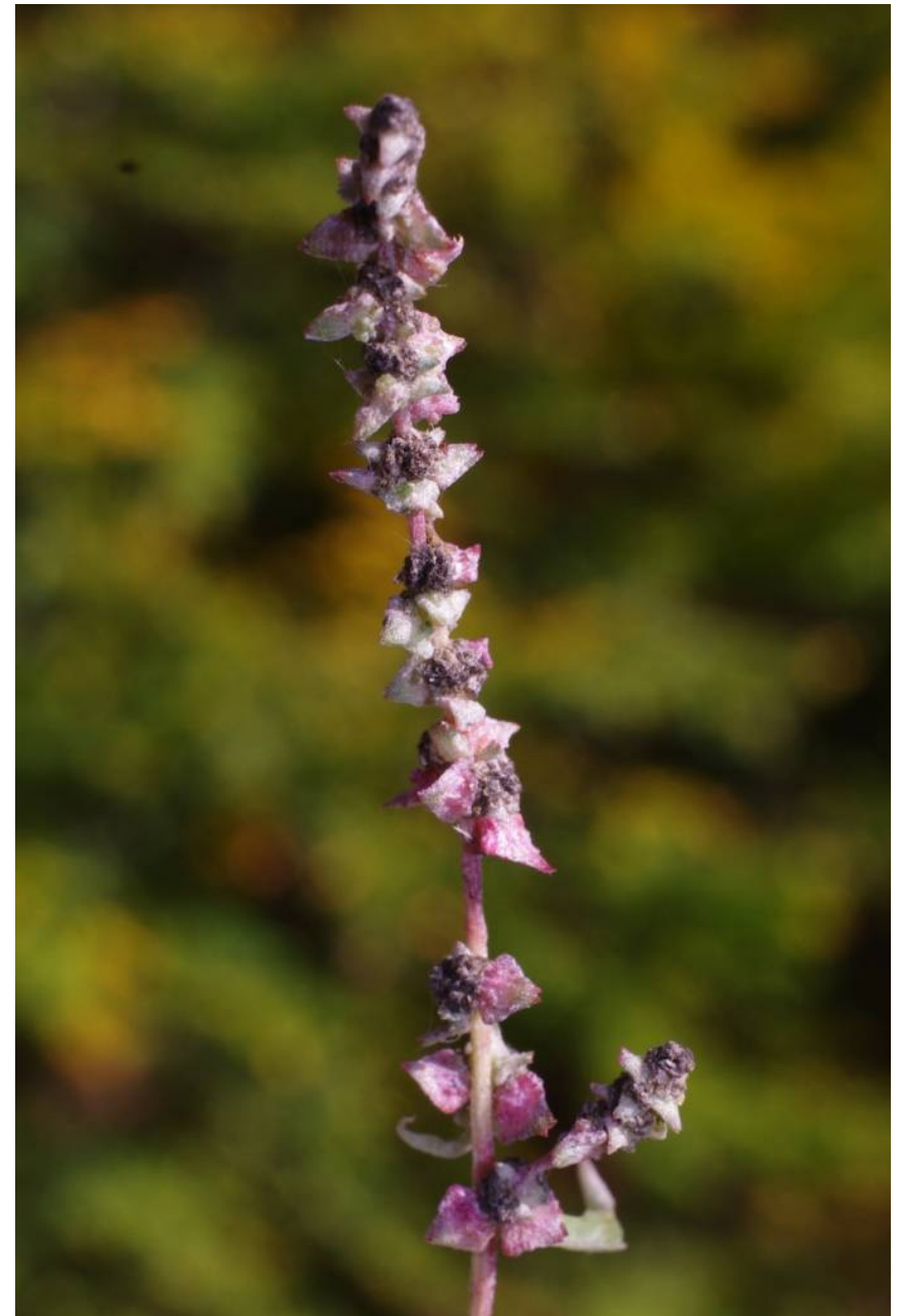
Florina, NO Antartiko, 40°47'11"N, 21°13'24"E, 10.10.2014; 250.538