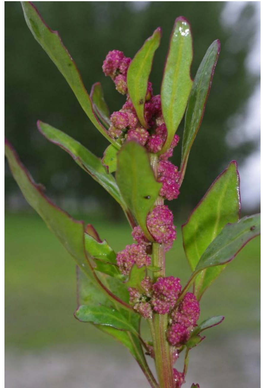
Kastoria, S Mavrochori, 40°30'23"N, 21°19'21"E, 06.10.2014; 249.474