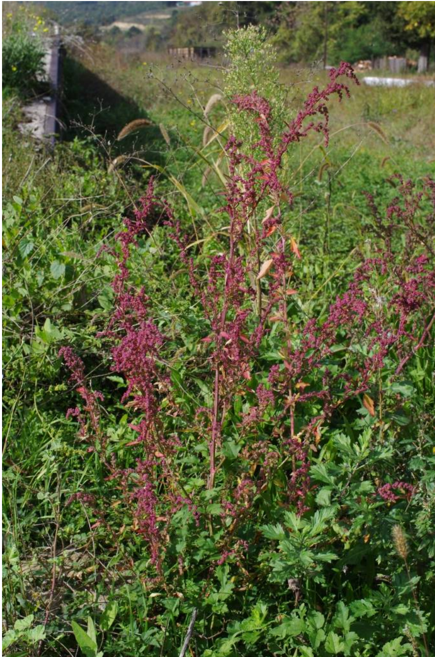
Chenopodium "Blätter rotrandig"