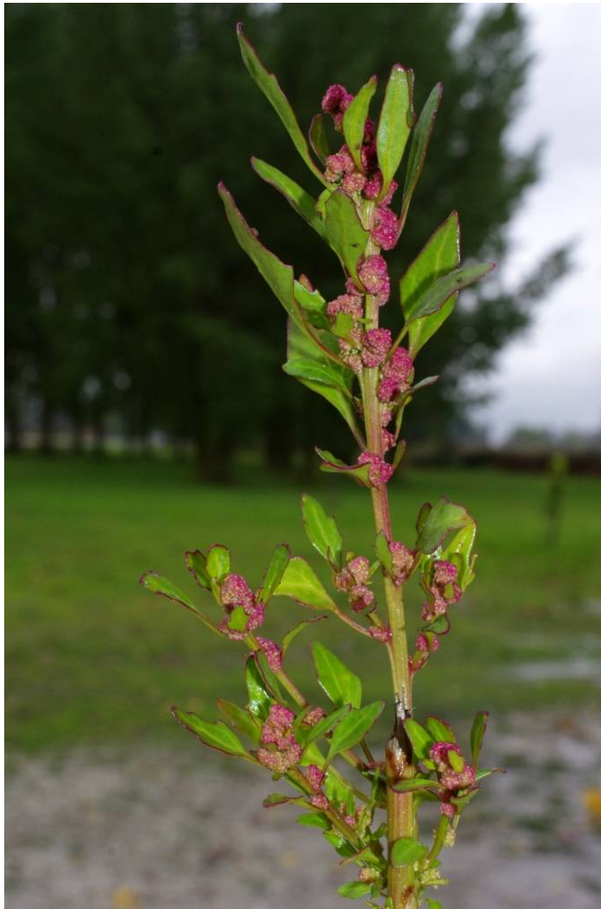
Blitum virgatum ( Chenopodium foliosum )