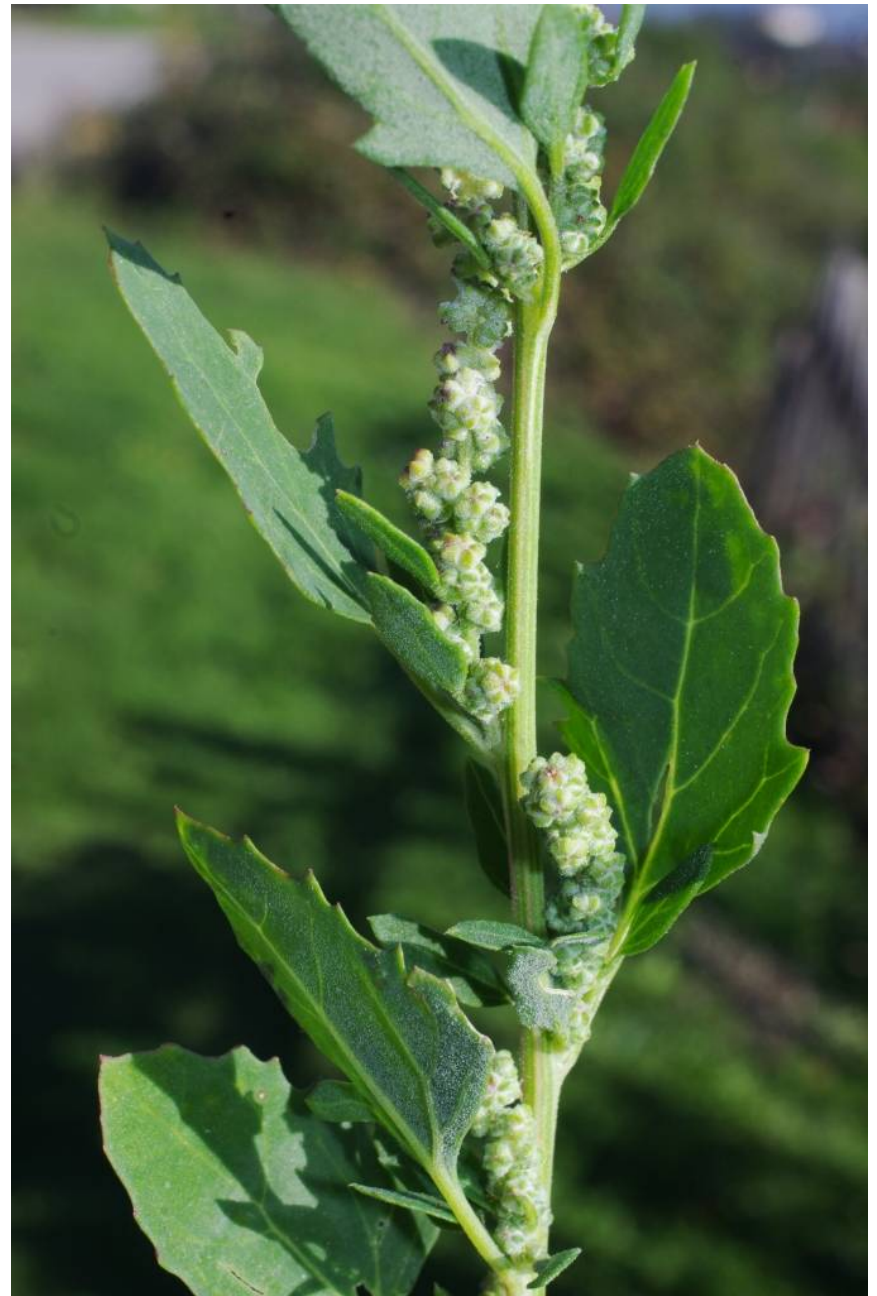
Imathia, Arkochori, 40°36'48"N, 22°03'31"E, 21.10.2014; 253.046