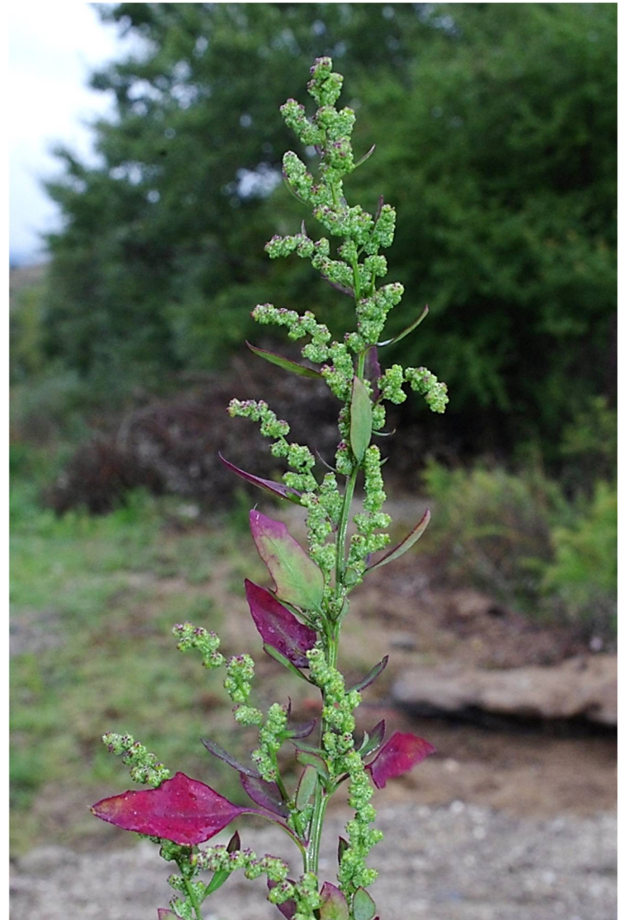
Kastoria, N Mavrochori, 40°32'58"N, 21°19'33"E, 06.10.2014 249.512