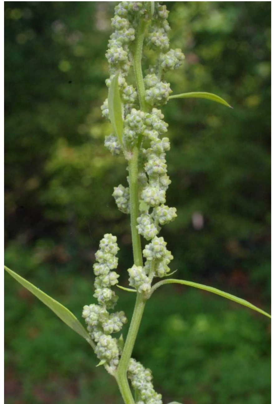
Ioannina, NW Molista, 40°07'33"N, 20°48'46"E, 23.09.2014; 246.480