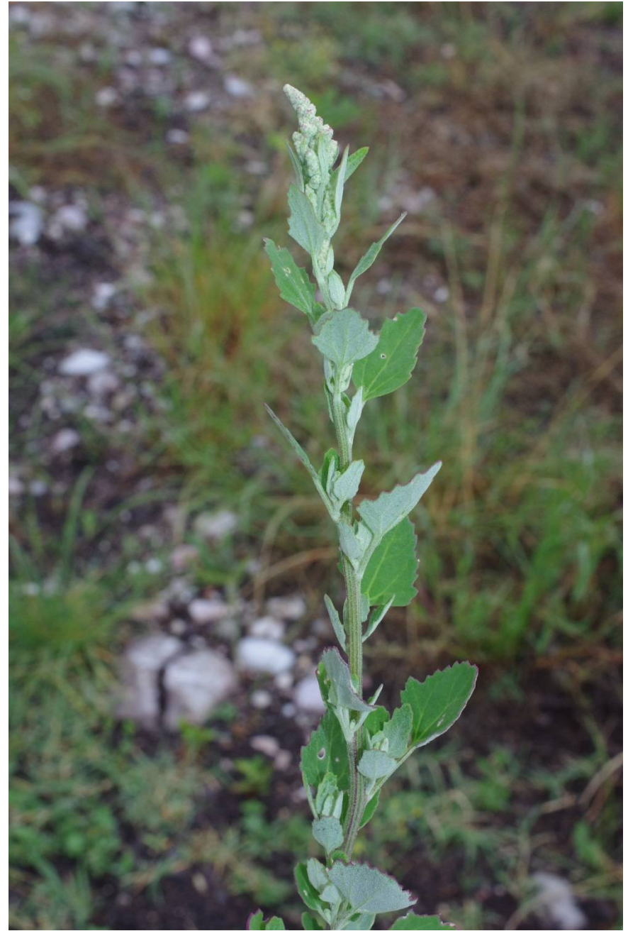
Trikala, Pyli, 39°27'39"N, 21°37'59"E, 22.05.2016