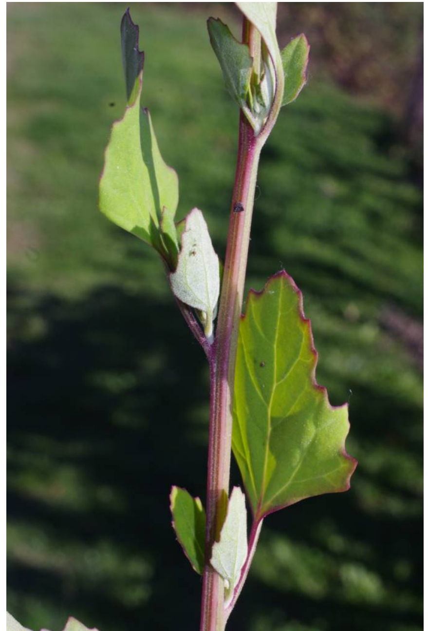
Chenopodium "Blätter rottrandig"

Imathia, Arkochori, 40°36'48"N, 22°03'31"E, 21.10.2014 253.048