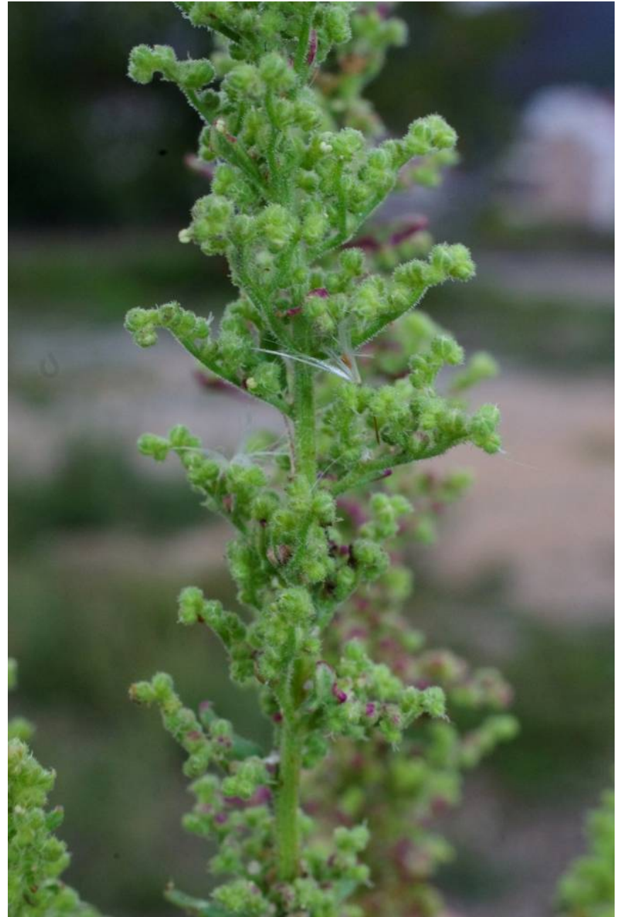
Kastoria, Chloi, 40°32'14"N, 21°15'26"E, 07.10.2014