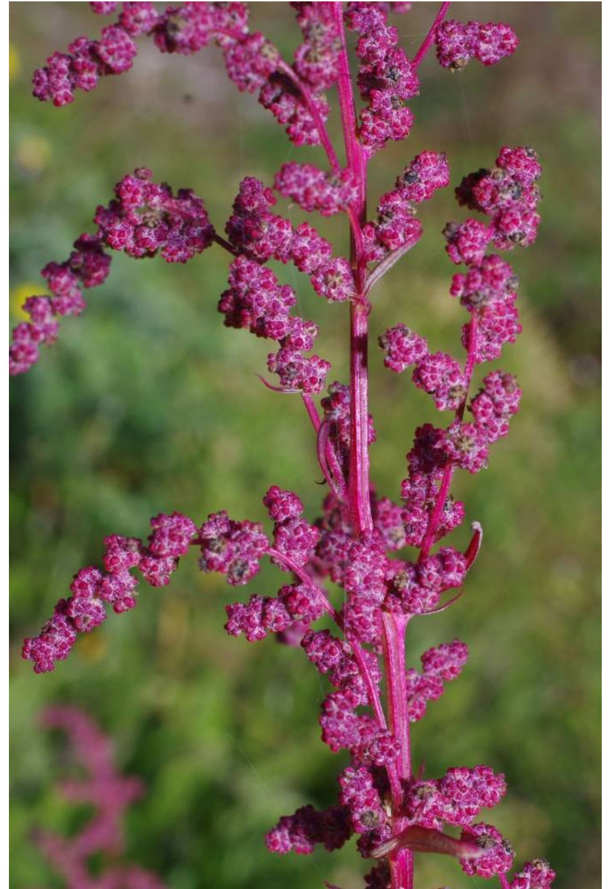
Pella, Agra, 40°48'34"N, 21°58'52"E, 15.10.14 251.619