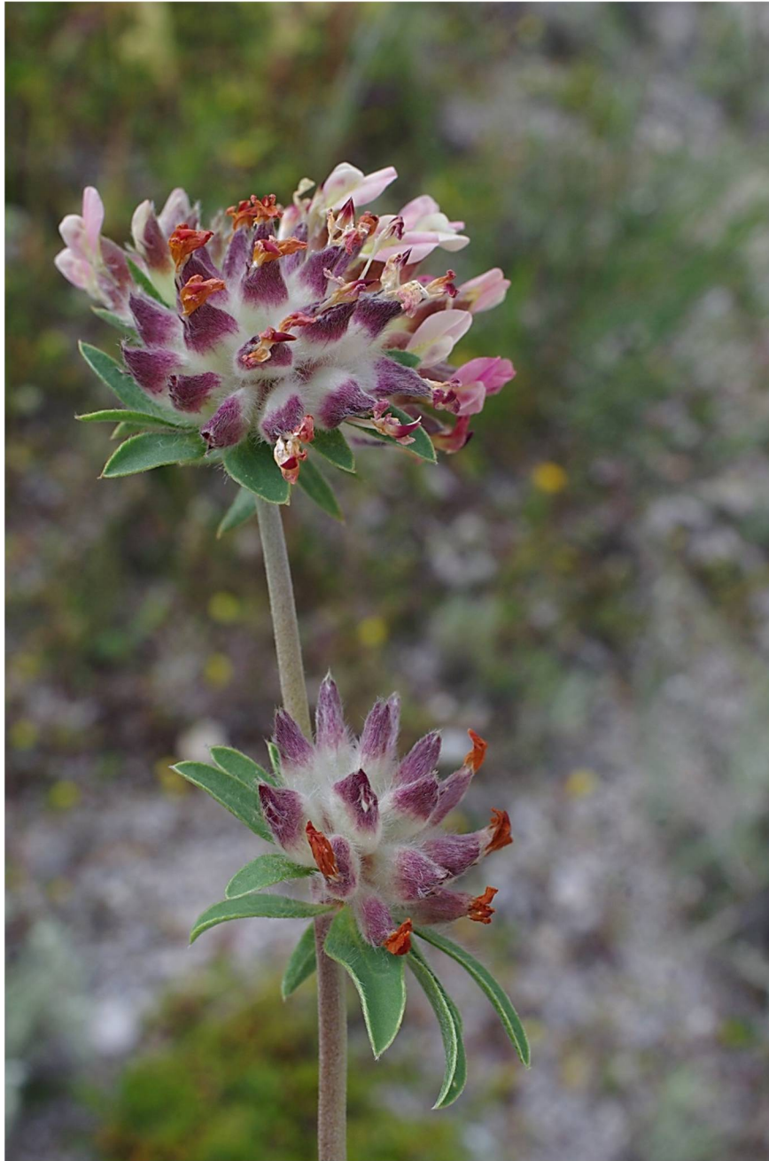
Anthyllis vulneraria subsp. rubriflora Preveza, SO Skepasi, 39°10'39"N, 20°38'36"E, 23.04.2016