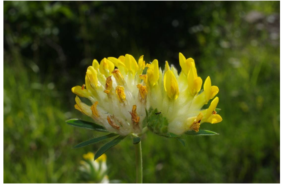
Anthyllis vulneraria subsp. alpestris

Trikala, NO Katara-Pass, 1525 m, 39°48'11"N, 21°14'34"E, 13.06.2017; 276.468