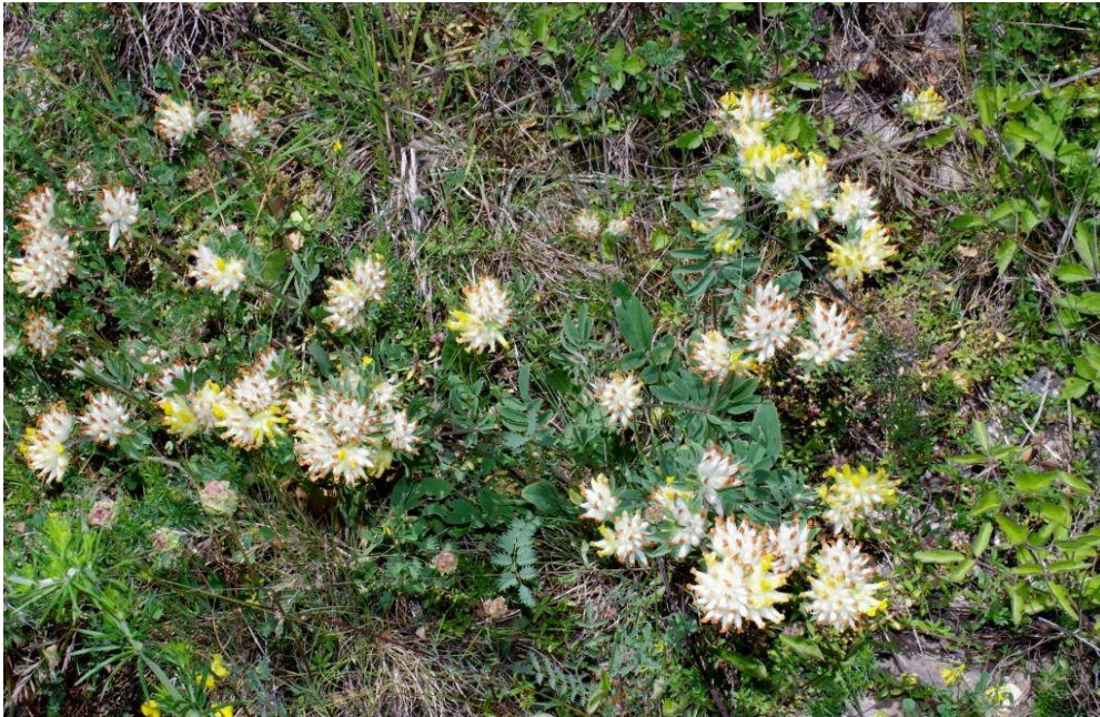
Anthyllis vulneraria sbsp. pindicola Evrytania, SO Klavsi, 38°51'34"N, 21°46'59"E, 3.6.2013