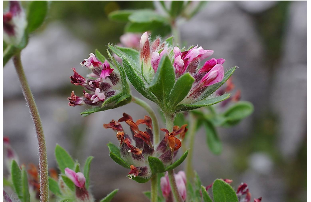
Anthyllis vulneraria subsp. rubriflora

Drama, Falakron, 1365 m, 41°17'25"N, 24°01'42"E, 03.07.2017; 280.835