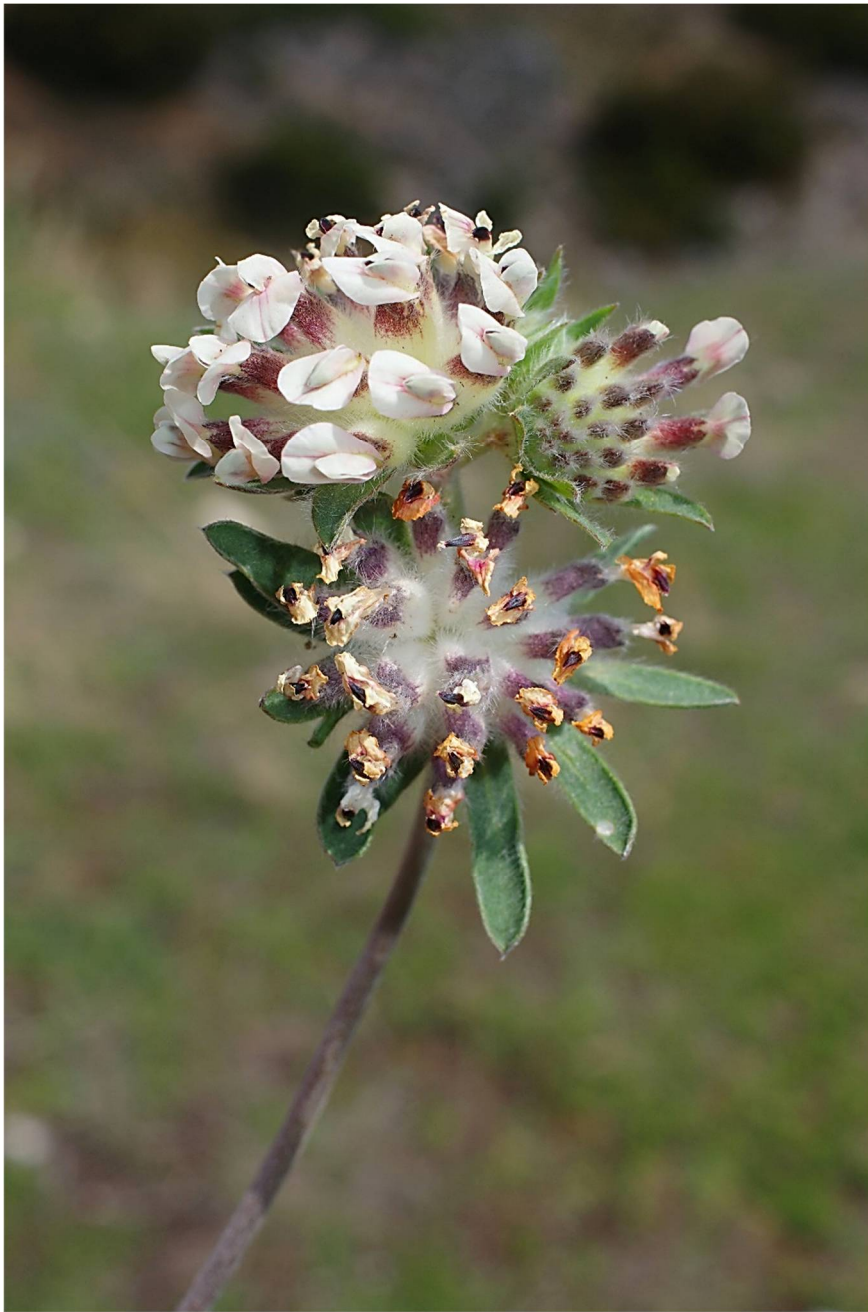
Anthyllis vulneraria subsp. bulgarica