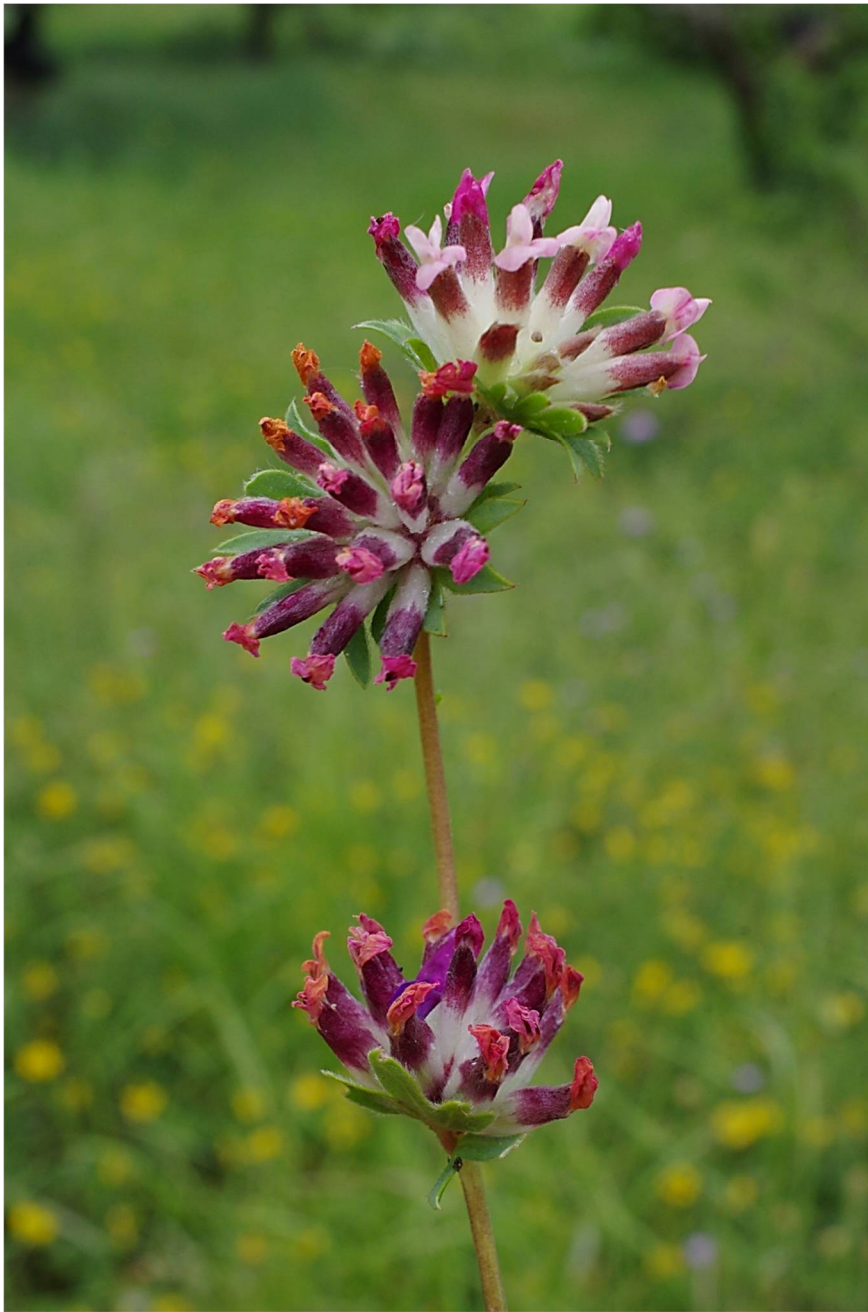
Anthyllis vulneraria subsp. rubriflora