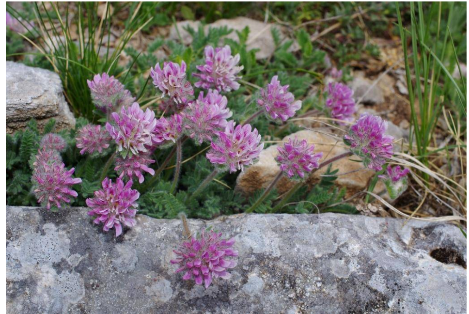
Anthyllis montana subsp. jacquinii

Drama, Falakron, 41°18'29"N, 24°02'58"E, 26.05.2015; 264.695