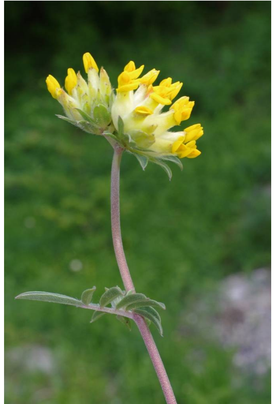
Ioannina, Metsovo, 39°46'44"N, 21°10'32"E, 29.05.2015; 265.380