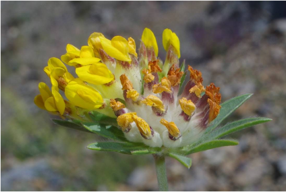
Anthyllis vulneraria subsp. bulgarica