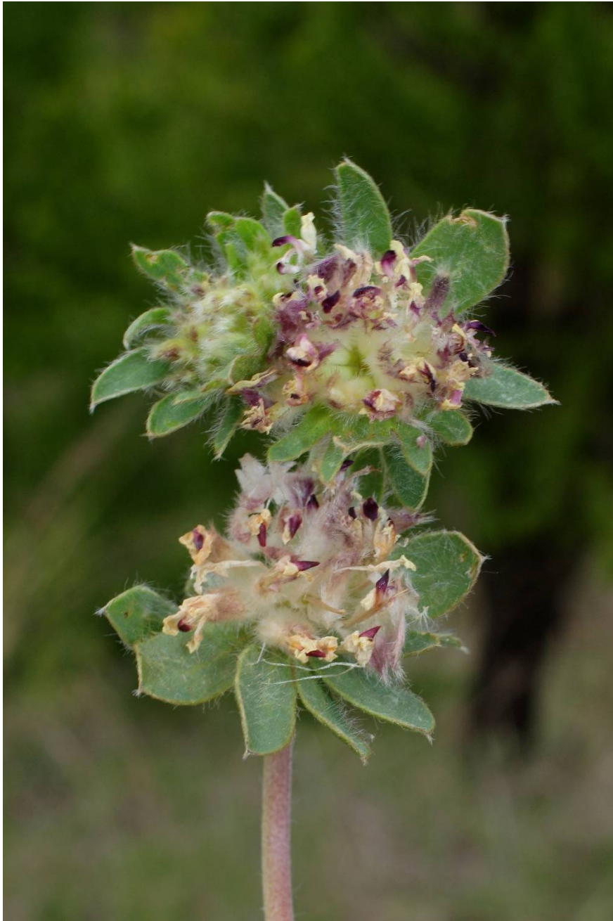
Anthyllis vulneraria subsp. bulgarica

Kozanis, NO Kozanis, 40°21'43"N, 21°47'43"E, 24.04.2019