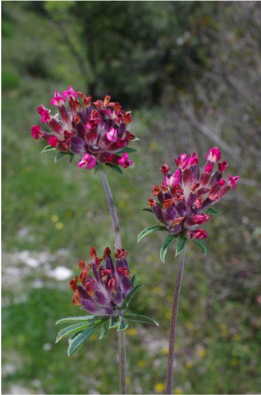
Anthyllis vulneraria subsp. rubriflora