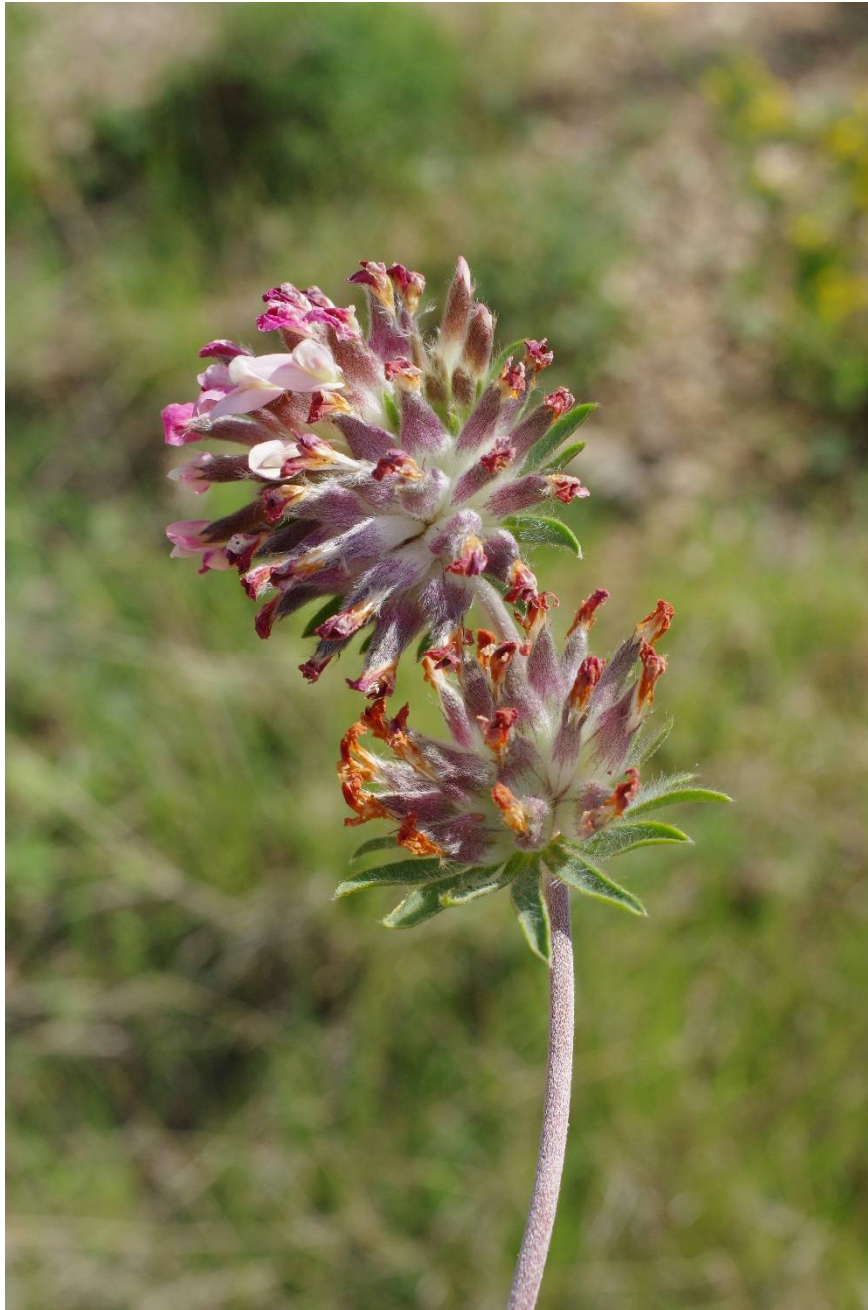
Anthyllis vulneraria subsp. rubriflora Korinthia, SSW Zemenos, 38°01'01"N, 22°36'00"E, 26.04.2018; 284.410