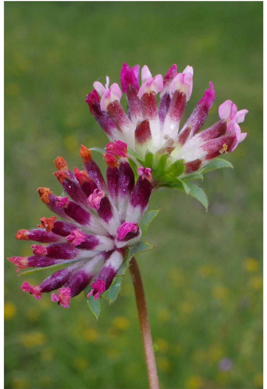
Lefkas, Lazarata, 38°46'46"N, 20°39'14"E, 12.05.2016 271.915