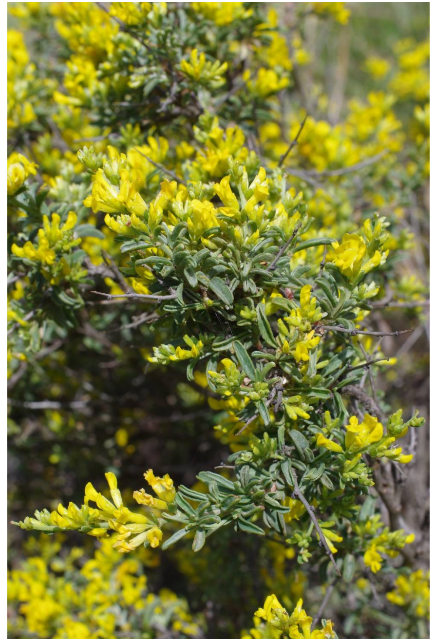
Anthyllis hermanniae Ahaia, S Platanos, 38°09'57"N, 22°15'57"E, 26.05.2010; 194.758