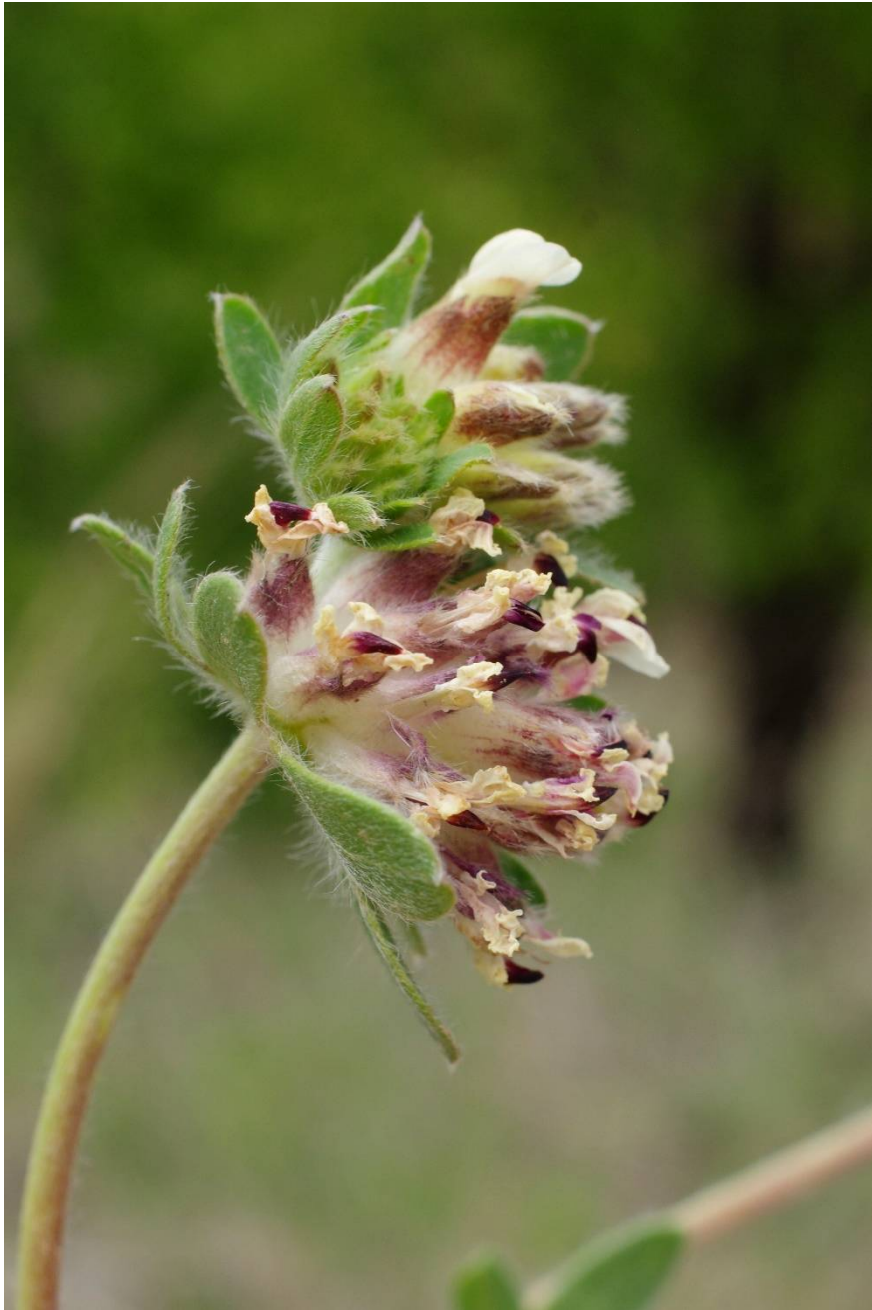
Anthyllis vulneraria subsp. bulgarica