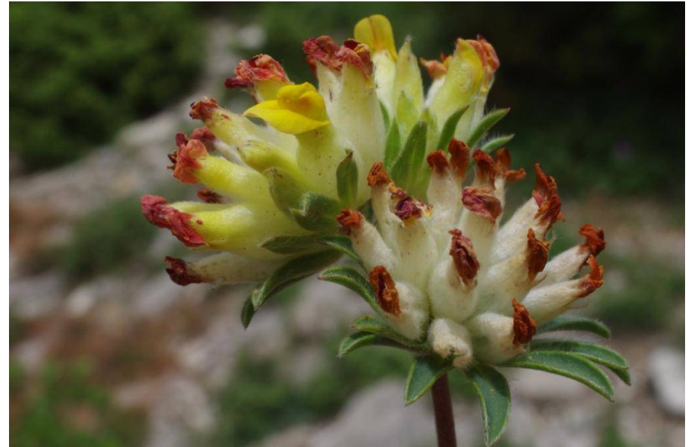
Etolia-Akarnania, W Aetopetra, 38°37'13"N, 21°39'43"E, 17.5.2013