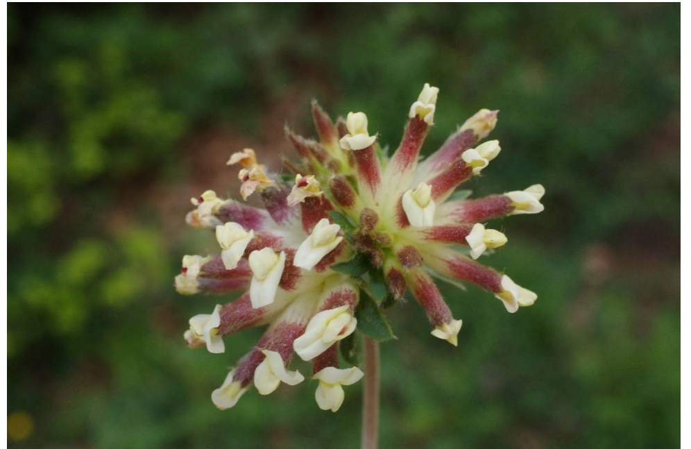
Anthyllis vulneraria subsp. rubriflora Korinthia, S Evrostina, 38°01'58"N, 22°24'01"E, 02.05.2018; 285.637