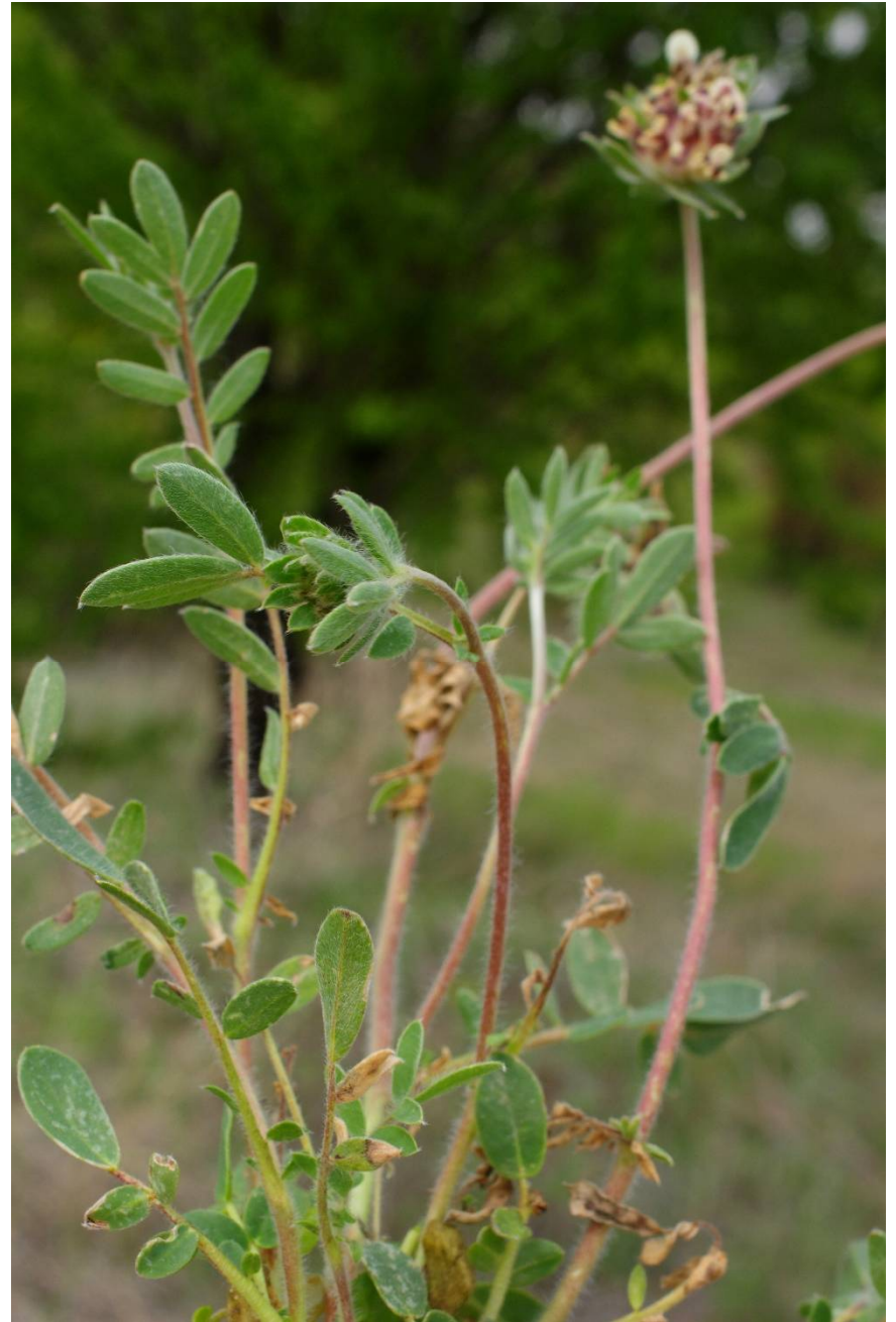
Kozanis, NO Kozanis, 40°21'43"N, 21°47'43"E, 24.04.2019