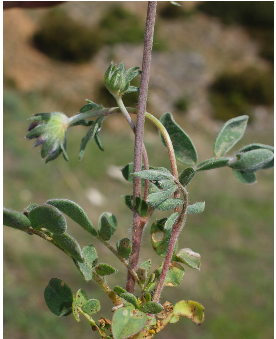
Kozanis, Serbia, 40°10'48"N, 22°00'41"E, 30.04.2019