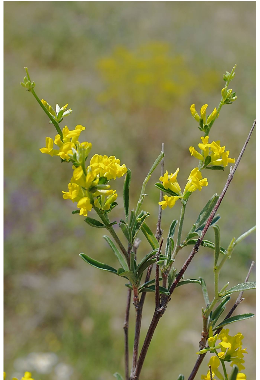
Kavala, SO Paralia Ofryniou, 40°44'36"N, 23°57'31"E, 28.05.2019