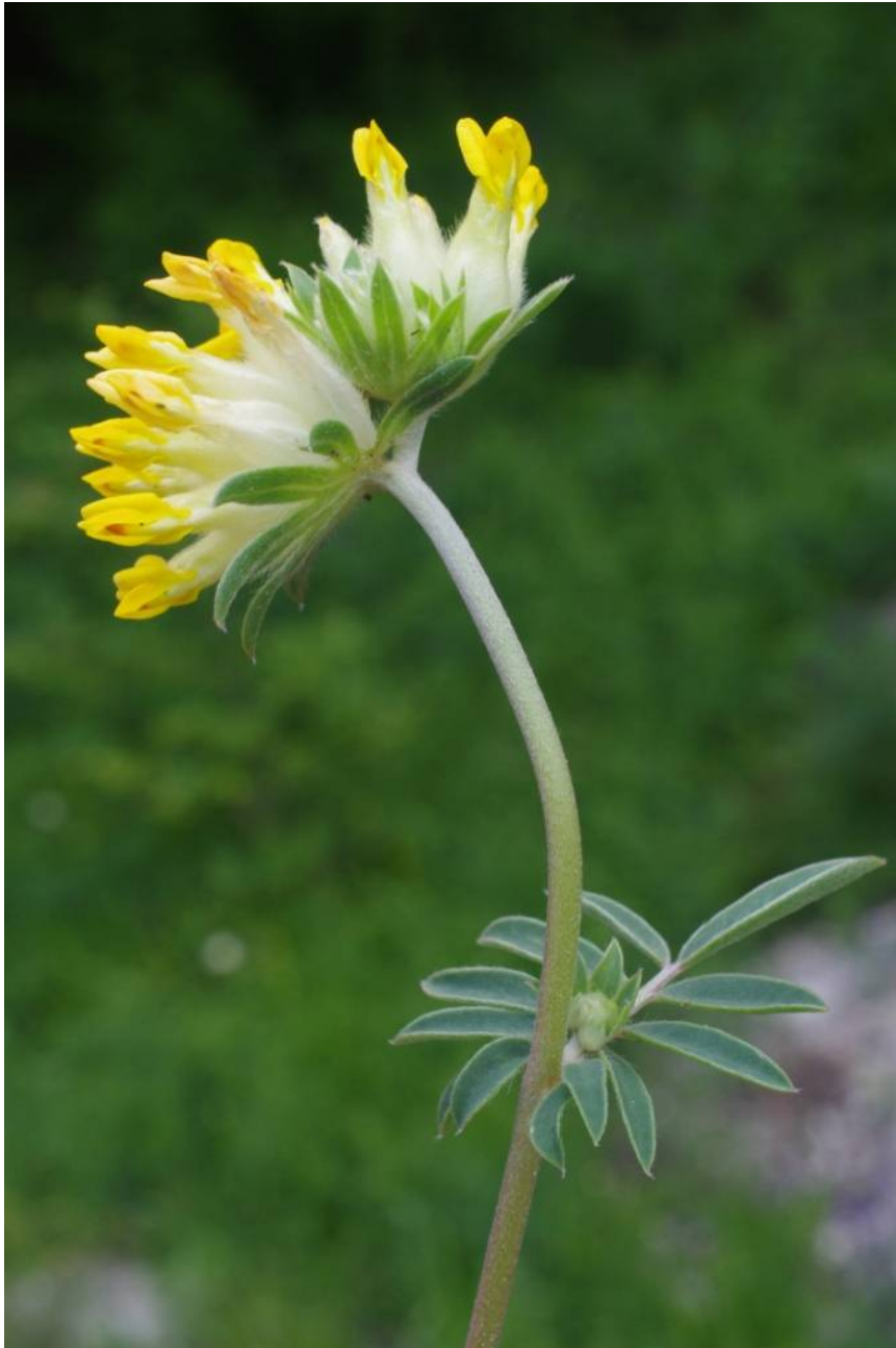
Anthyllis vulneraria subsp. pindicola