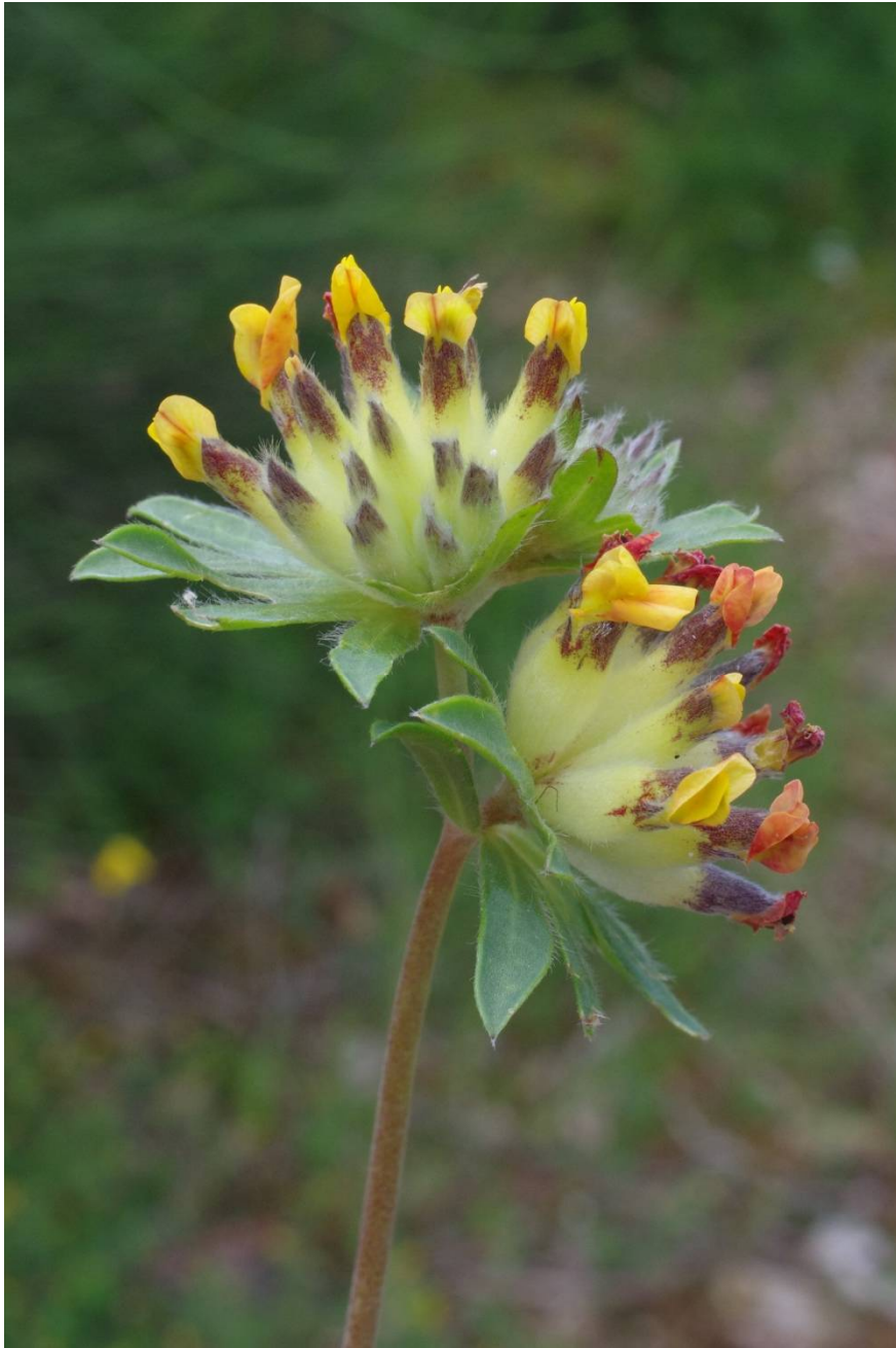
Anthyllis vulneraria subsp. pindicola

Arta, O Vourgareli, 39°22'47"N, 21°07'15"E, 18.05.2016 273.434