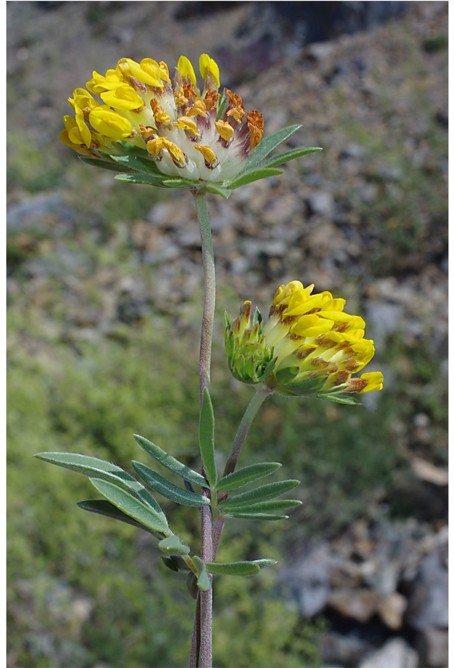
Trikala, Trigonas, 39°46'30"N, 21°27'06"E, 25.05.2016; 275.292