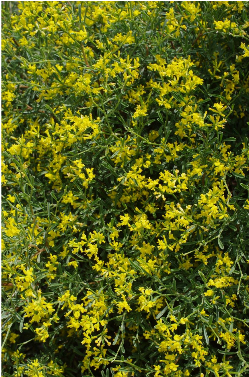
Antyllis hermanniae Korinthia, Loutraki, 38°00'19"N, 22°56'08"E, 08.05.2018