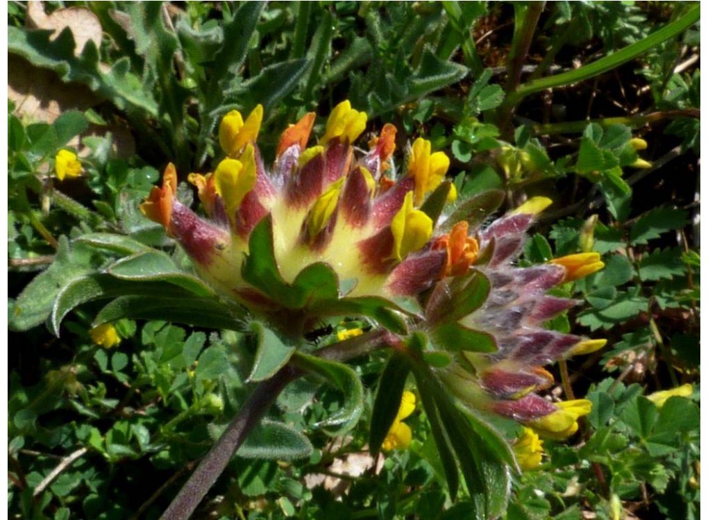
Grevena, Oropedio, 40°09'10"28.2 D, 21°15'40"E, 25.5.12