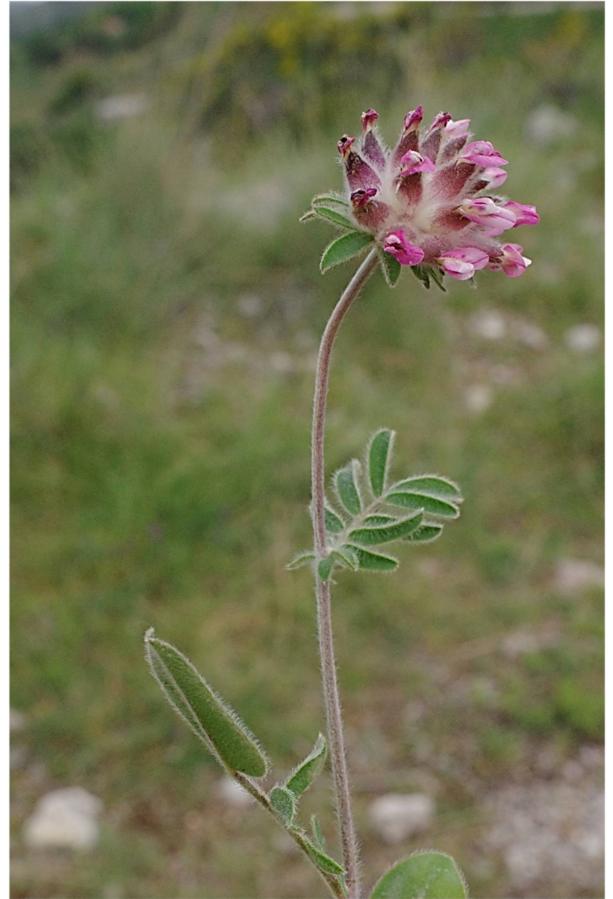
Ahaia, S Valimi, 38°05'18"N, 22°16'43"E, 30.04.2018; 285.201