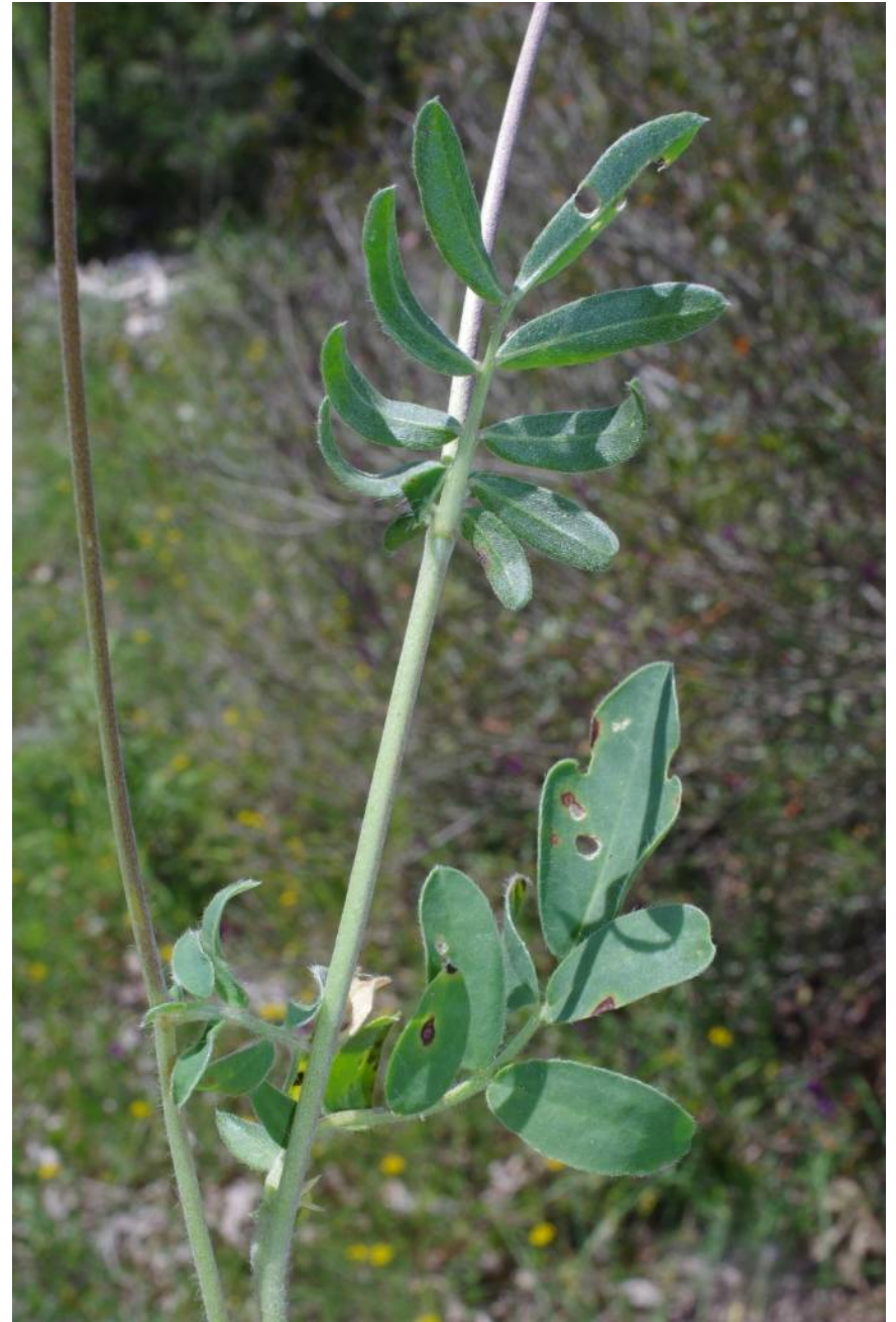
Lefkas, W Drymonas, 38°46'10"N, 20°37'21"E, 14.05.2016