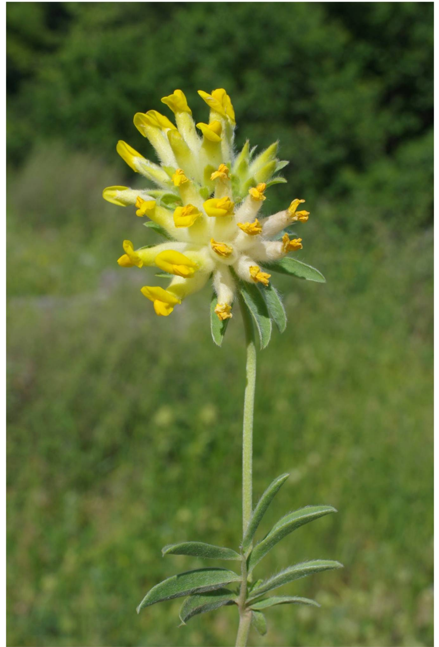
Anthyllis vulneraria subs. pindicola

Karditsa, SW Platania, 39°22'41"N, 21°36'07"E, 23.05.2016 274.958