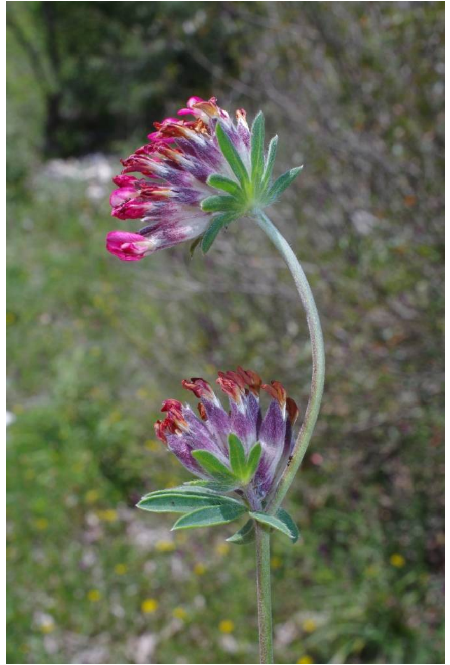
Preveza, SO Skepasti, 39°10'39"N, 20°38'36"E, 23.04.2016 266.982