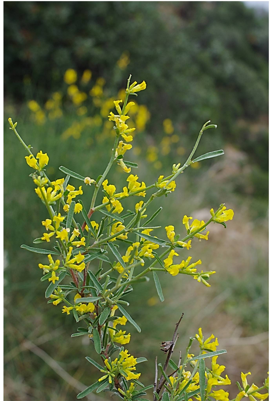
Argolis, WSW Kalamaki, 37°31'13"N, 22°39'34"E, 18.05.2018; 289.253