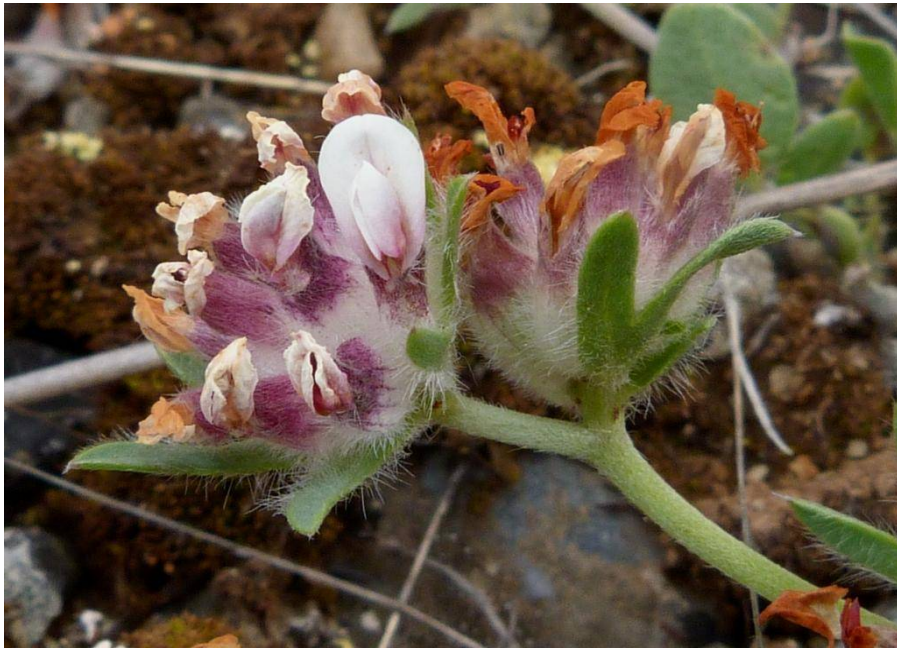
Anthyllis vulneraria subsp. pindicola Kozanis, SW Xirolimni, 40°17'54"28.2 D, 21°39'19"E, 29.5.12