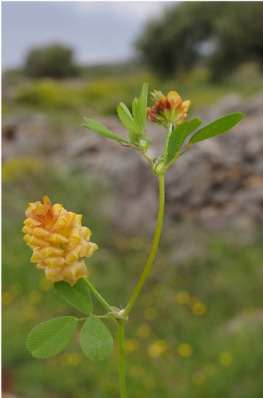
Trifolium campestre Lassithi, O Skinias, 35°19'06"N, 25°42'01"E, 12.04.2017; 275.650