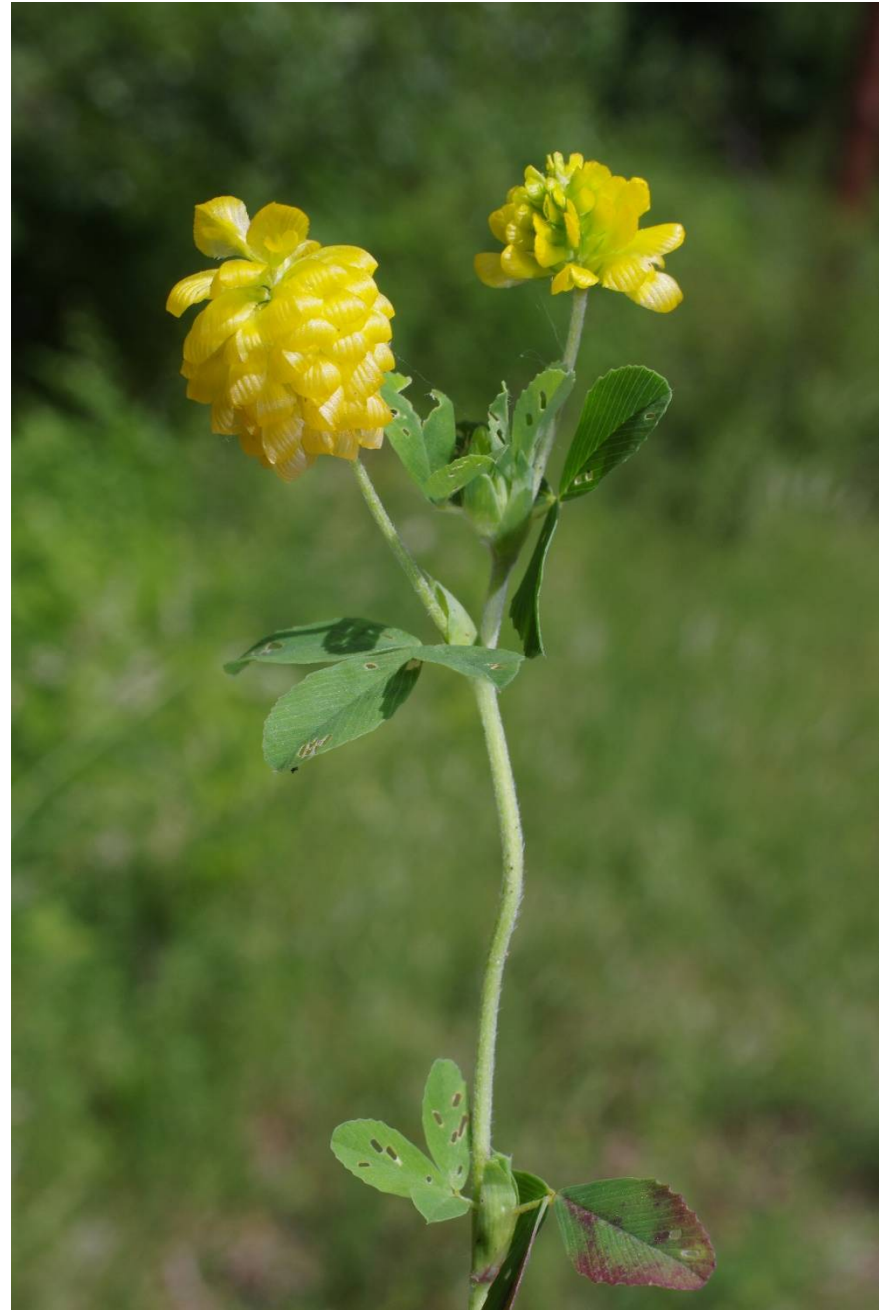
Drama, Livadero, 878 m, 41°18'26"N, 24°13'01"E, 29.06.2017; 279.975