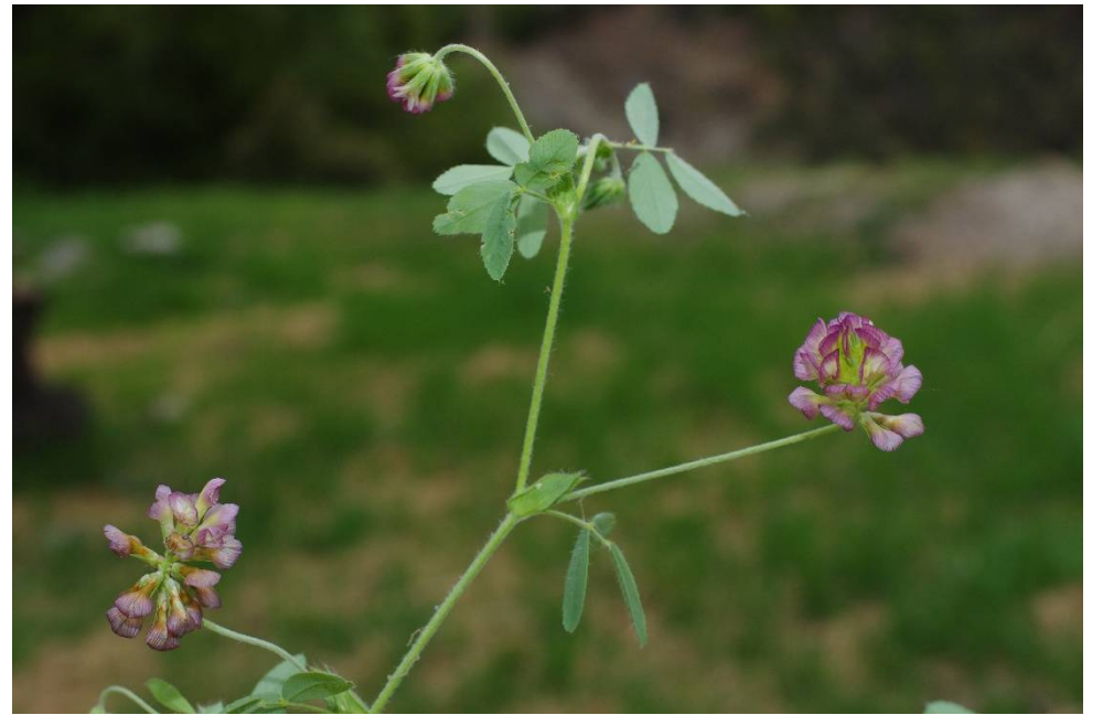
Kozanis, NO Velvendos, 40°19'19"N, 22°05'59"E, 04.05.2019