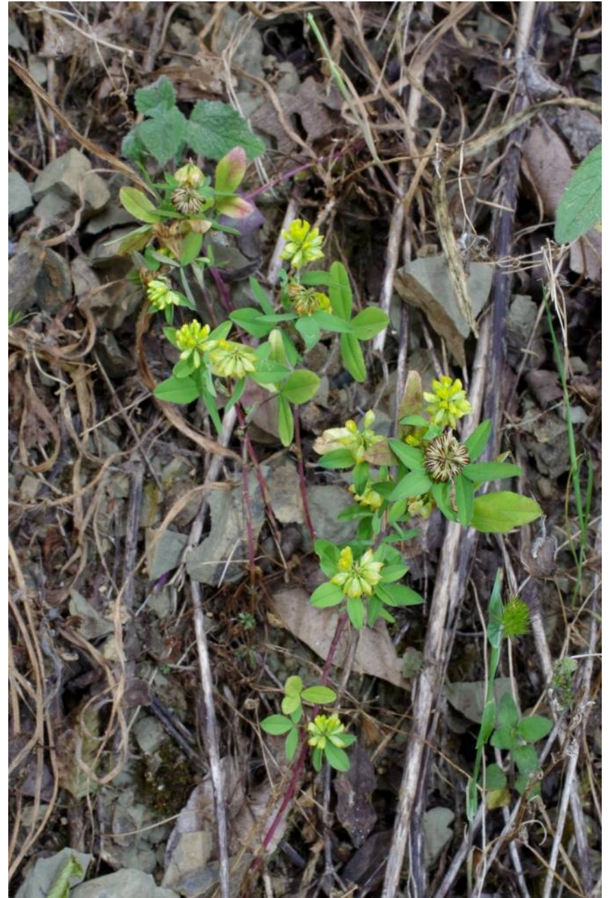
Etolia-Akarnania, SSW Potamoula, 28.05.2013