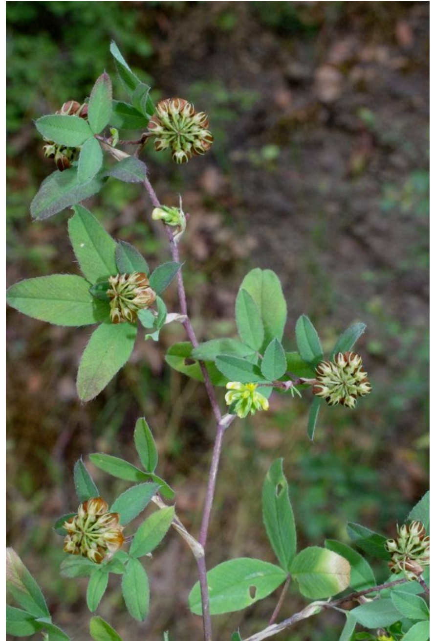
Etolia-Akarnania , SSW Potamoula, 28.05.2013