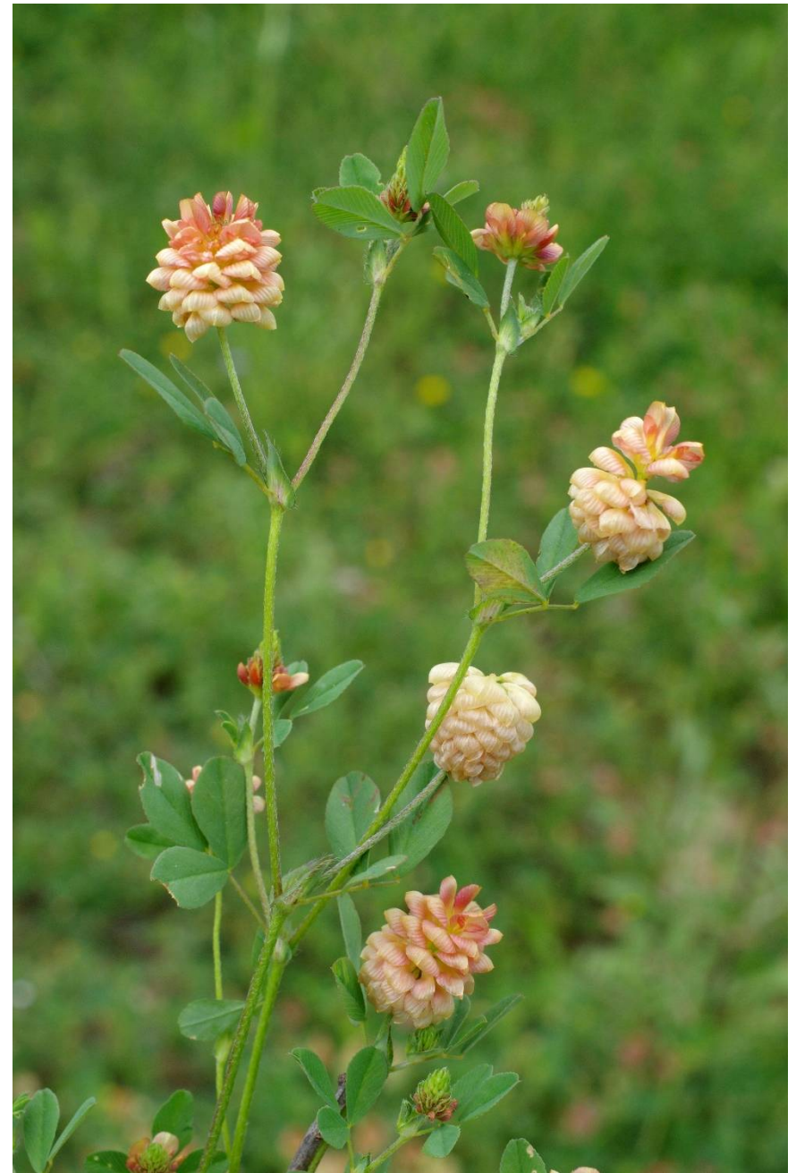
Irakleion, WSW Marta, 35°03'58"N, 25°18'58"E, 22.04.2017