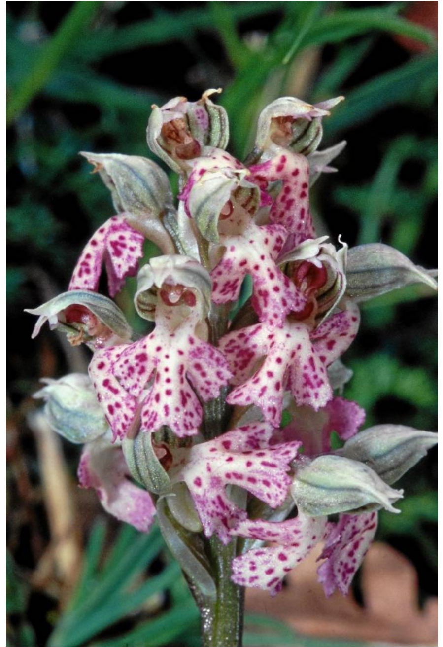
Ilias, NW Andritsena, 37°30'10"N, 21°52'57"E, 2.4.1978