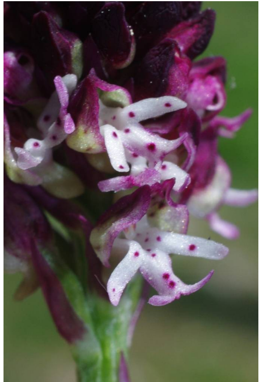
Drama, Volakas, Falakron, 41°17'34"N, 24°00'25"E, 26.05.2015