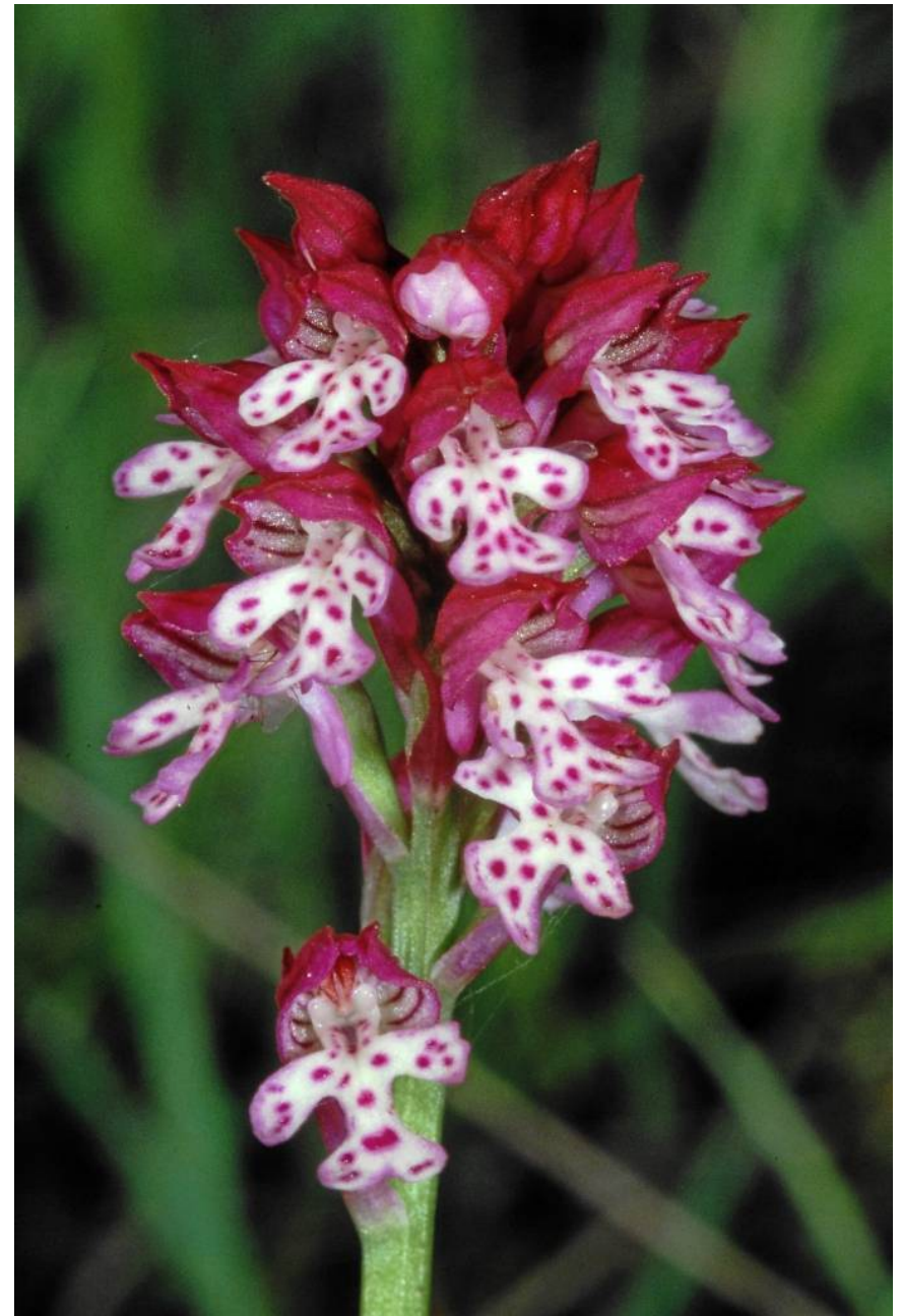
Neotinea tridentata x ustulata