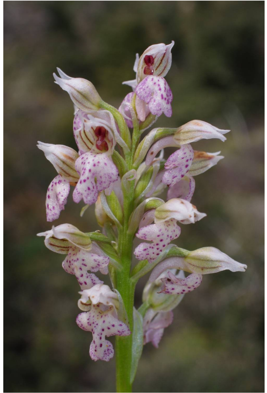
Lassithi, O Roussakiana, 35°12'32"N, 25°32'06"E, 11.04.2017; 275.621