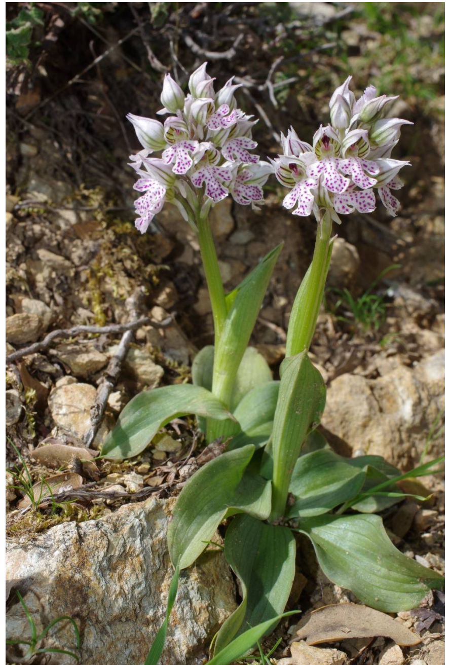
Lassithi, S Meso Potami, 35°12'29"N, 25°31'08"E, 11.04.2017