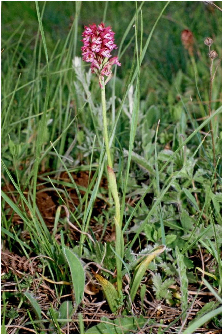
Neotinea tridentata x ustulata