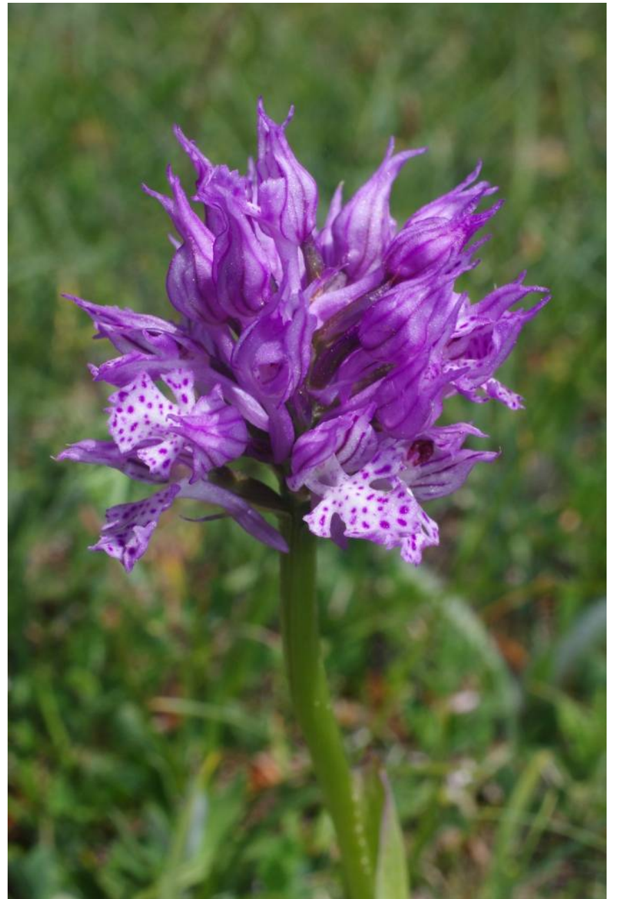
Drama, Volakas, Falakron, 41°17'34"N, 24°00'25"E, 26.05.2015 264.574