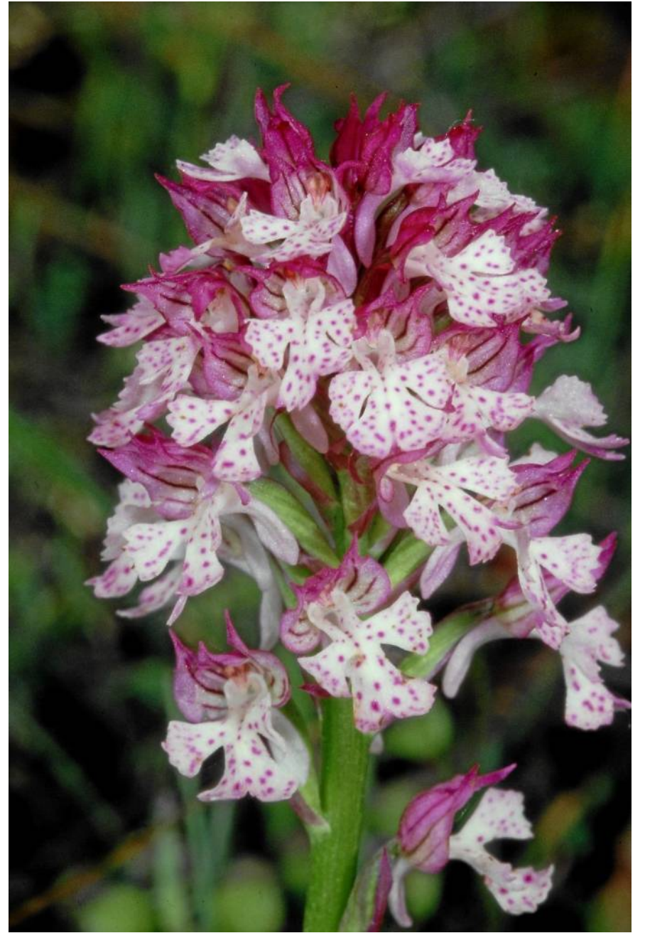
Pella, Pel 76 b, NNW Livadia, 28.5.1986