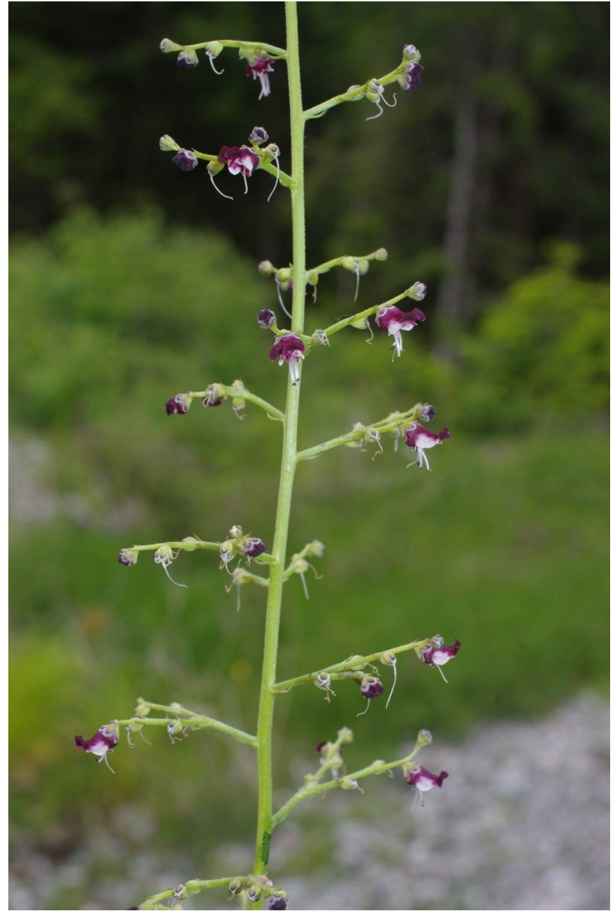
Arta, SO Athamani, 39°21'03"N, 21°15'06"E, 19.05.2016