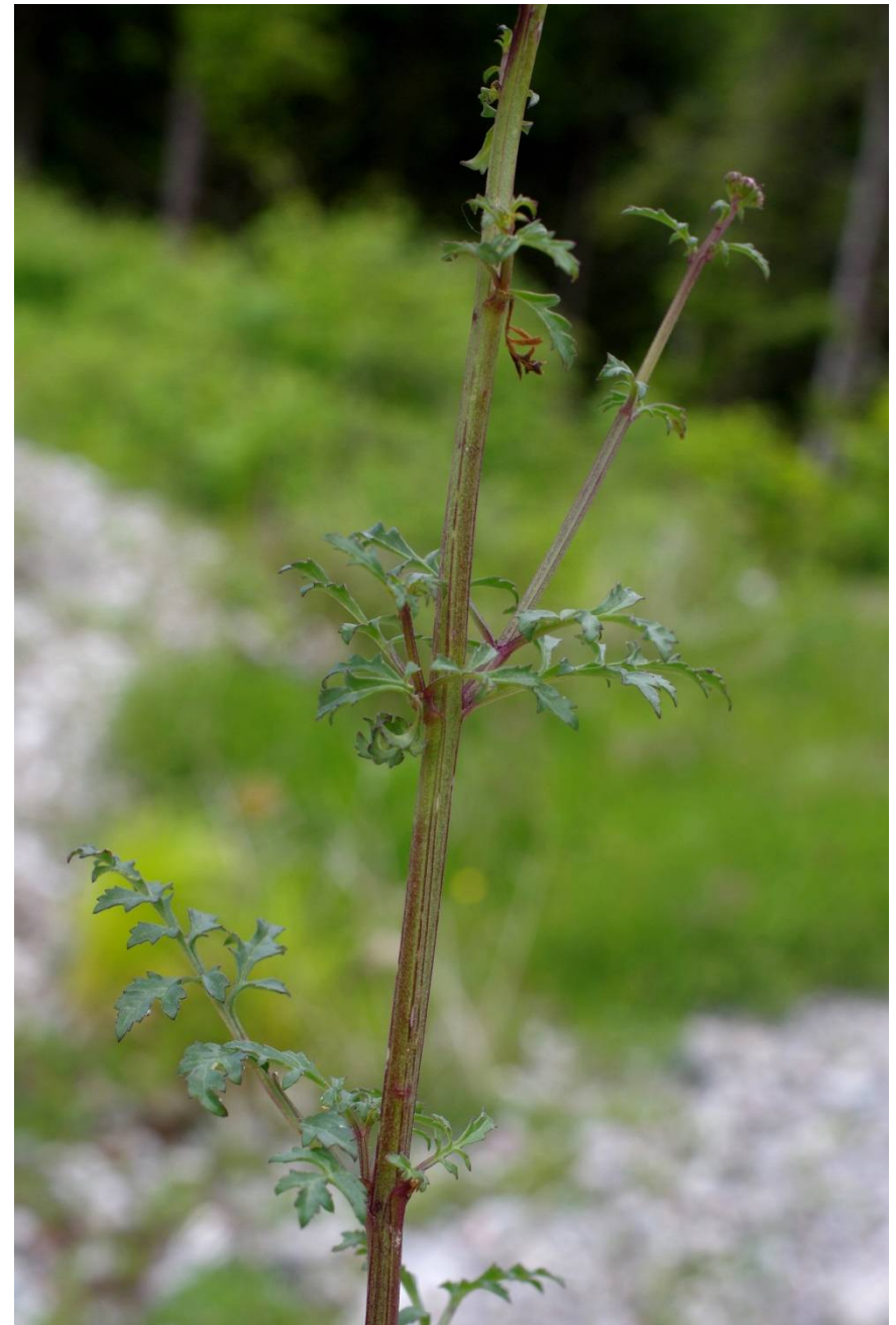
Scrophularia canina subsp. bicolor

Arta, SO Athamani, 39°21'03"N, 21°15'06"E, 19.05.2016