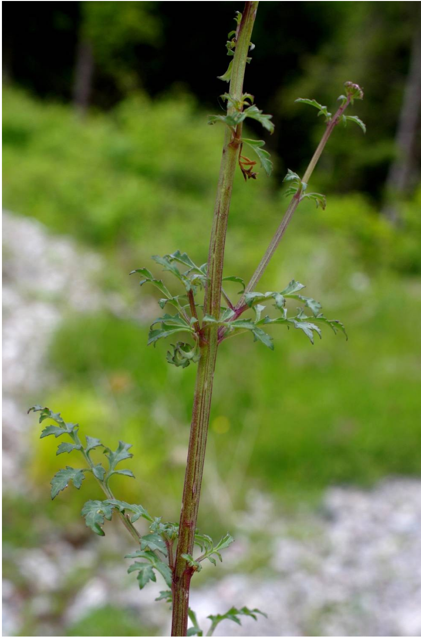
Scrophularia canina subsp. bicolor