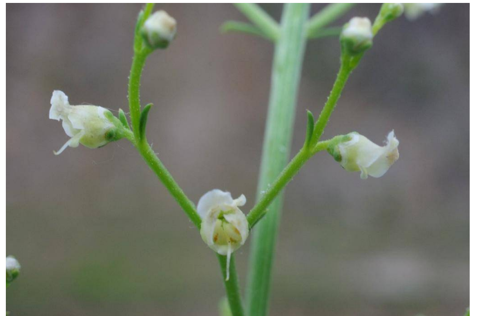
Scrophularia canina subsp. bicolor

Drama, NO Volakas, 41°21'46"N, 24°01'27"E, 27.05.2015; 264.857