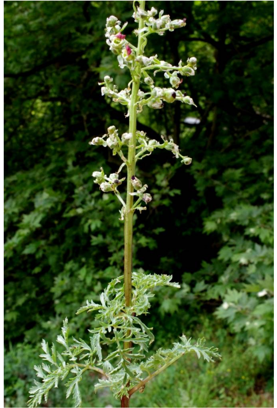
Etolia-Akarnania, WNW Ano Chora, 38°36'02"N, 21°53'49"E, 8.5.2013