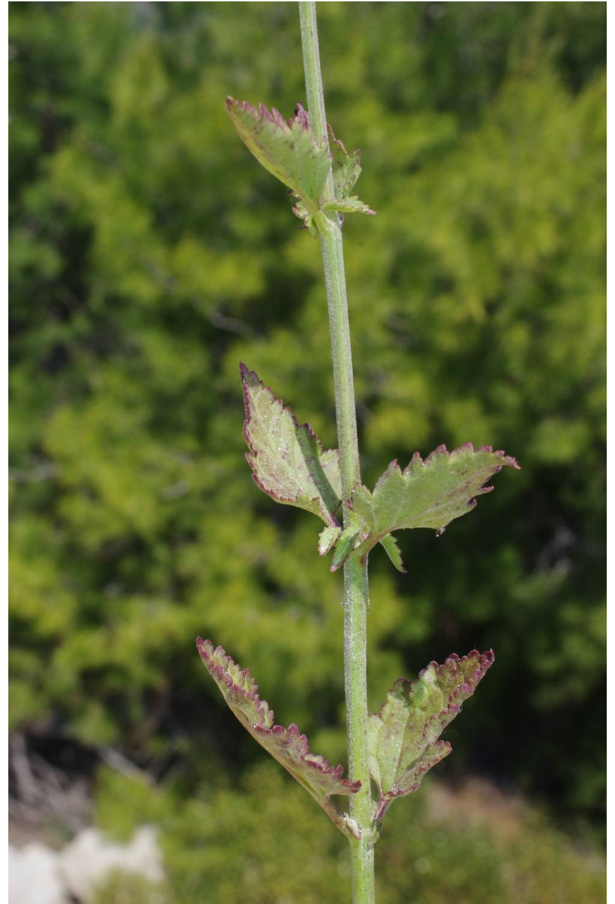
Chalkidiki, S Nikiti, 40°11'41"N, 23°43'05"E, 25.05.2019; 301.241