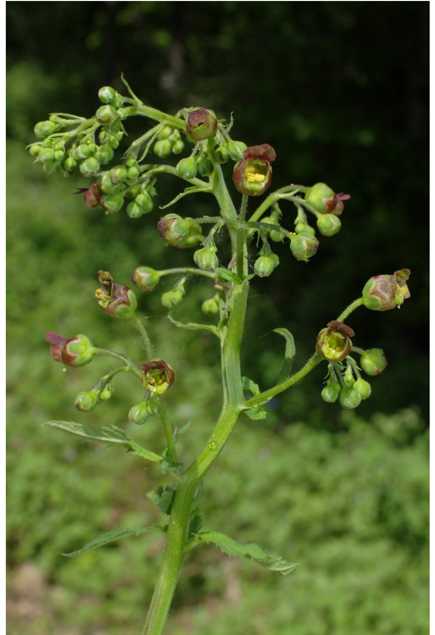
Chalkidiki, NO Polygyros, 40°24'21"N, 23°29'00"E, 18.05.2019; 299.579