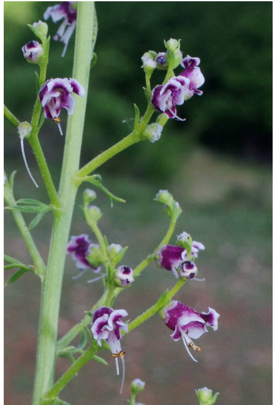
Scrophularia canina subsp. bicolor

Drama, Volakas, Falakron, 41°18'23"N, 24°00'33"E, 26.05.2015; 264.492