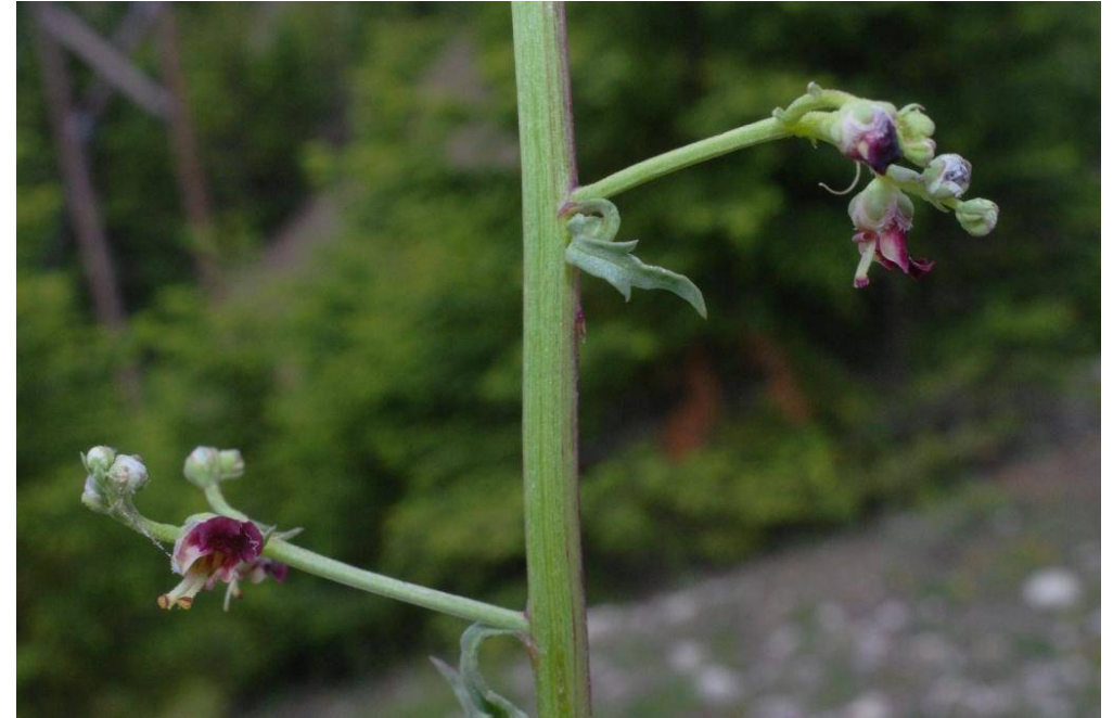
Evrytania, SW Ambliani, 38°45'13"N, 21°53'31"E, 4.6.2013