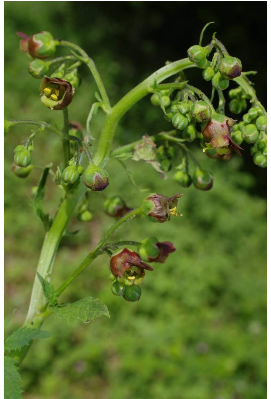
Chalkidiki, NO Polygyros, 40°24'21"N, 23°29'00"E, 18.05.2019; 299.579