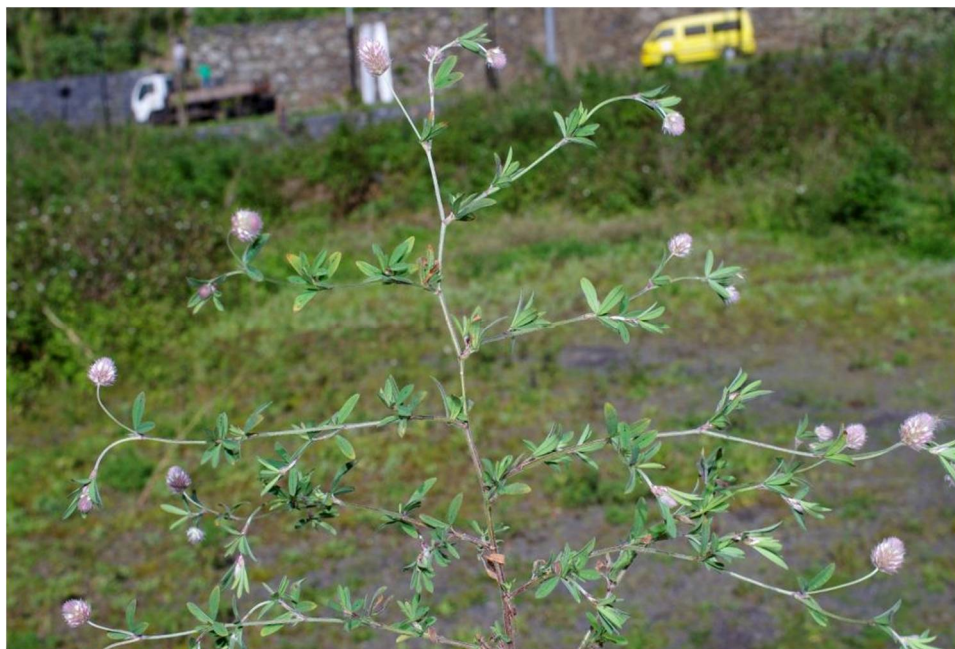
Trifolium arvense M, S.Vicente, 120 m, 32°47'35"N, 17°02'22"W, 25.2.14