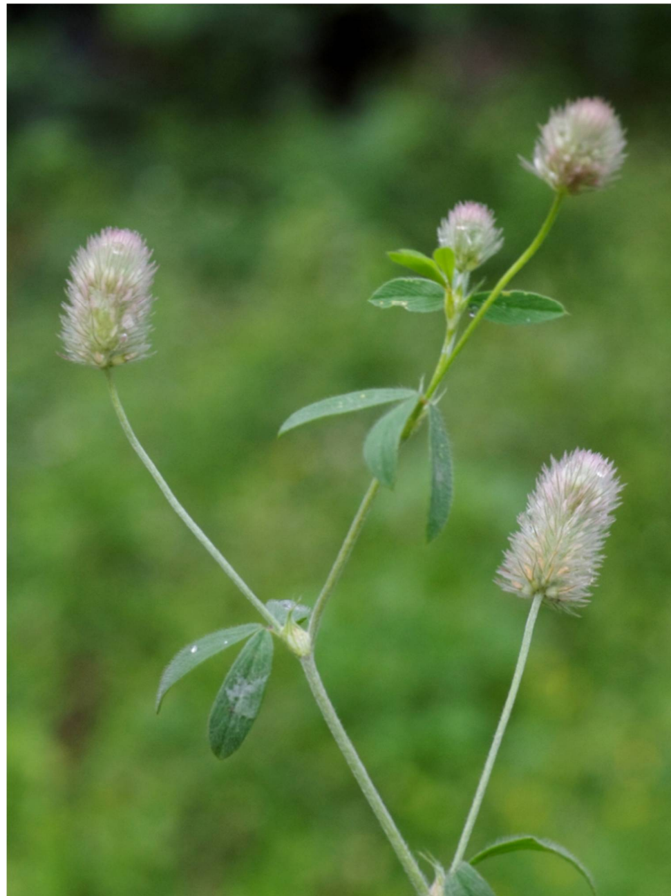
M, NO Ribeira Brava , 32°41'27"N, 17°03'04"W, 16.2.14