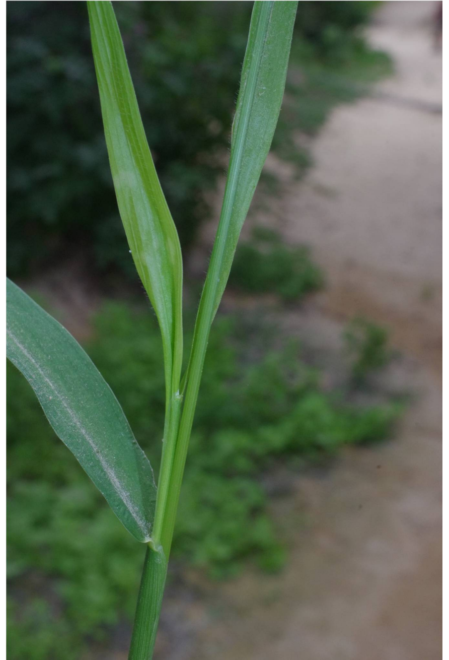
Setaria adhaerens (FORSSK.) CHIOV.

Fuerteventura, Costa Calma, 28°09'32"N, 14°13'53"W, 14.2.2016