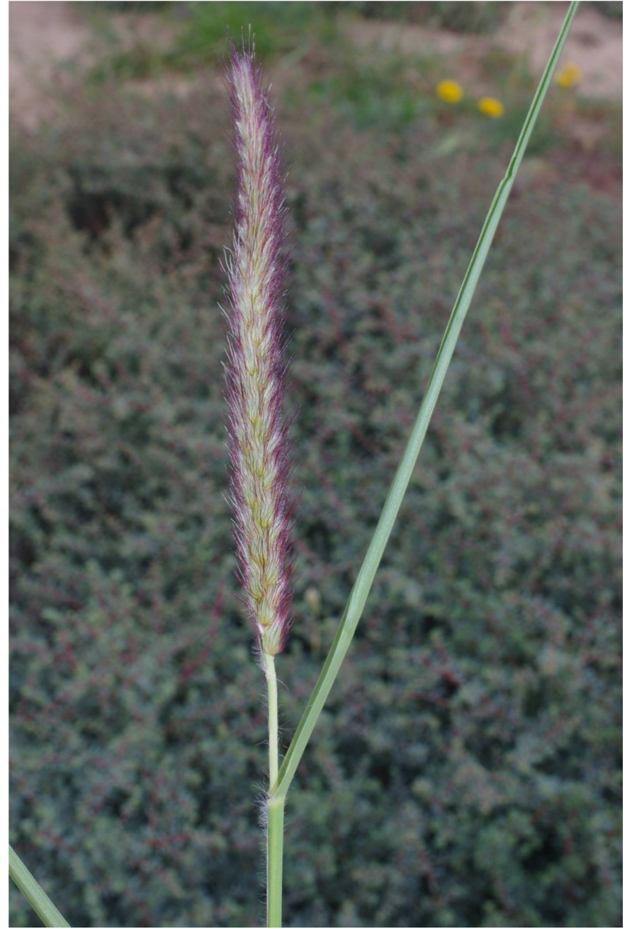
Cenchrus ciliaris L.

Fuerteventura, O Lajares, 28°40'32"N, 13°53'58"W, 13.2.2016