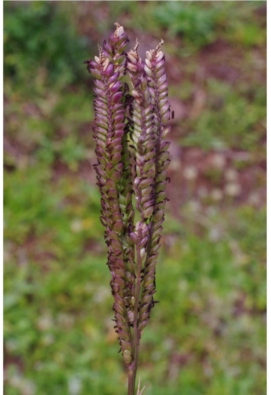
M, Santa Cruz, 40 m, 32°41'30"N, 16°46'34"W, 26.2.14