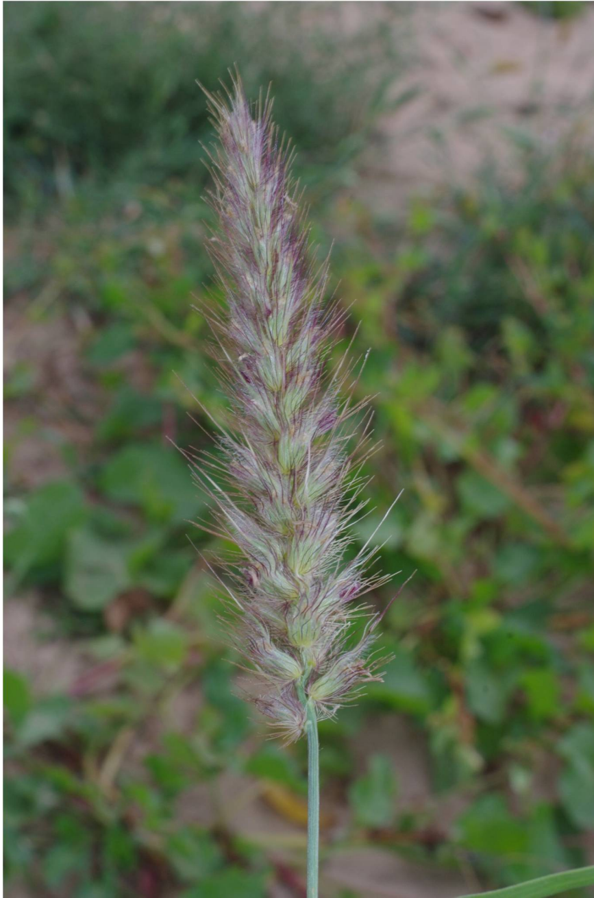
Cenchrus ciliaris L.