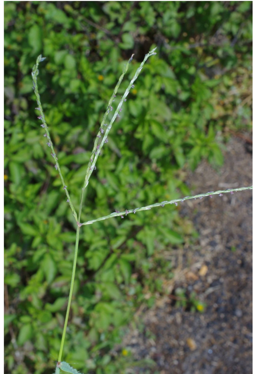
Fuerteventura, Esquinzo, 28°04'20"N, 14°18'23"W, 14.2.2016