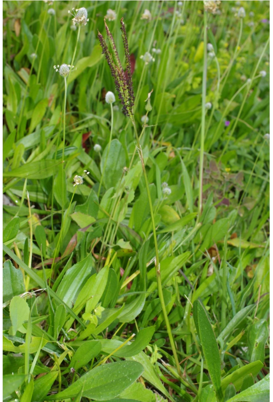
M, Santa Cruz, 40 m, 32°41'30"N, 16°46'34"W, 26.2.14