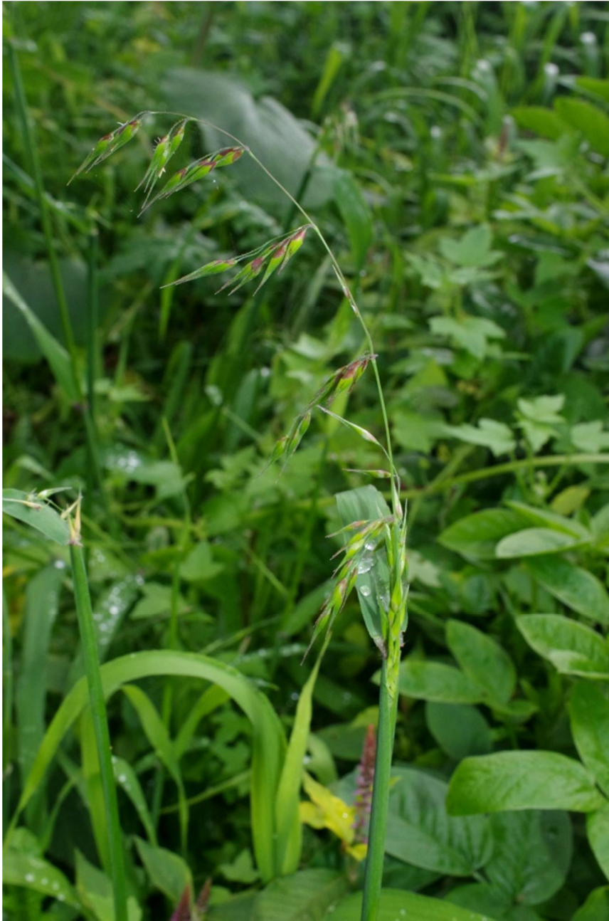
Ehrharta longiflora GC, SSW Moya, 28°05'10"N, 15°35'11"W, 700 m, 1.3.2015