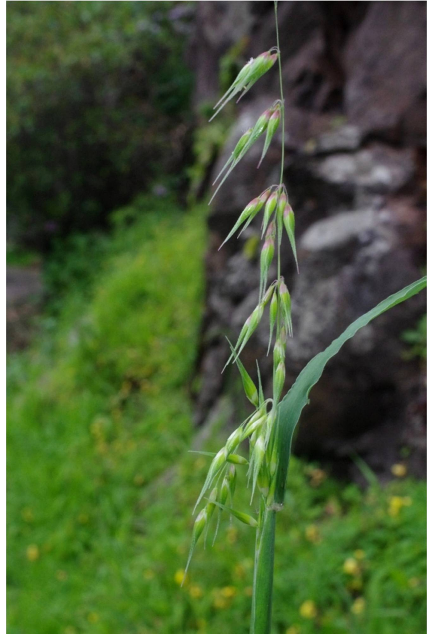
GC, Arucas, 28°06'47"N, 15°33'55"W, 305m, 2.3.2015