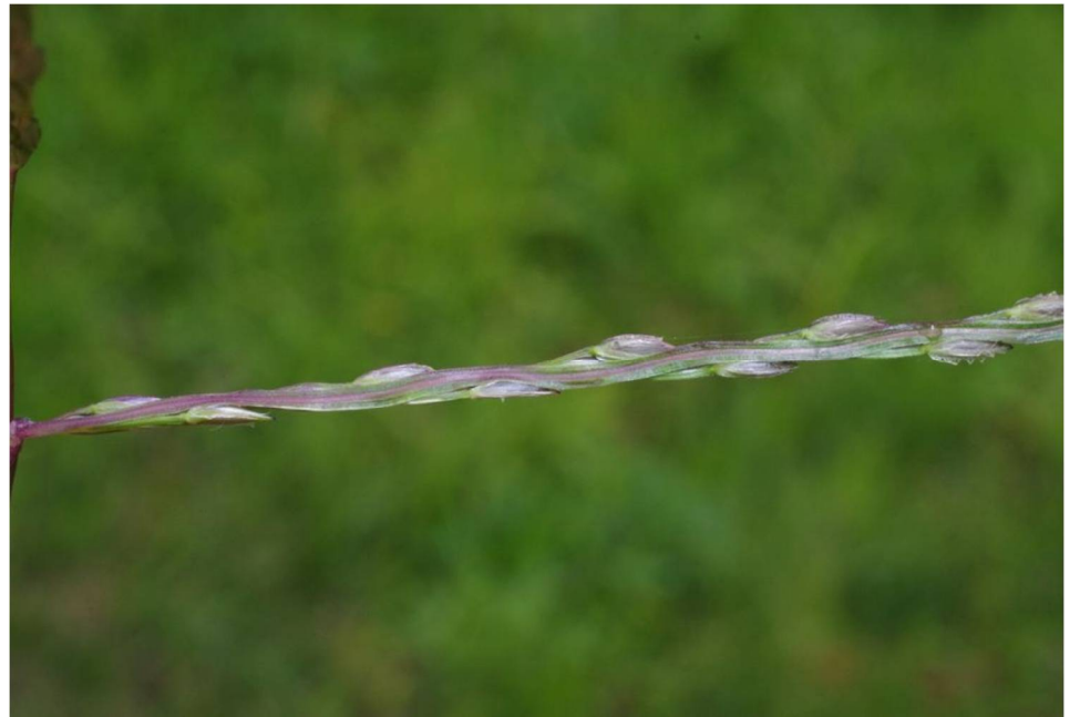
M, Santa Cruz, 40 m, 32°41'30"N, 16°46'34"W, 26.2.14