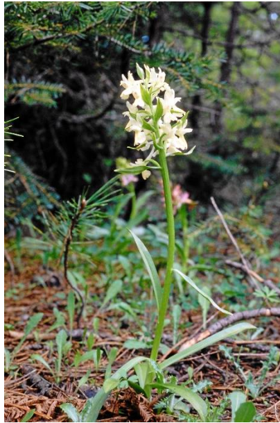
GR, Achaia, S Seliana, 22.05.1980 Rosmarin-Phrygana, Flysch, 800 m Aha 116, 38°02'53"N, 22°20'41"E, FH 11.82